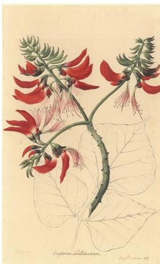
Figure 5. (left) Sydney Parkinson (1768-1771) Erythrina variegata Cook First Voyage Artwork Collection. Retrieved from https://plants.jstor.org/stable/10.5555/al.ap.visual.nhm-uk-l-a391788a-024b-m-1?searchUri=si%3D276%26ff%3Dps_repository_name_str__ps_collection_name_str%26fq%3DcHNfdHlWZToolldhdGVyY29sb3Jzlik%253D%26so%3Dps_group_by_genus_species%2Basc%26Query%3Dps_collection%253ACFVA