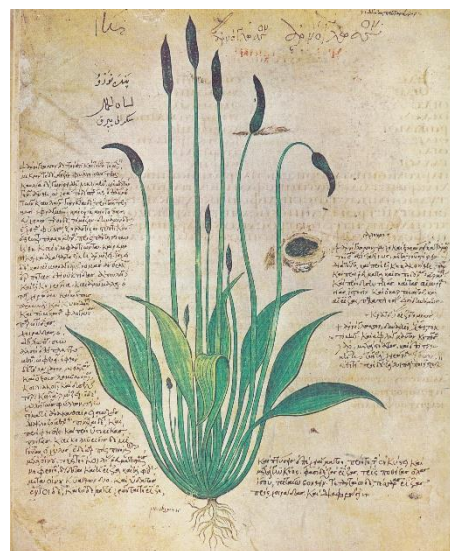
Figure 2. Lamb's tongue ( Plantago lanceolata ): JAC 29v

Earliest records of Botanical Art dates back to hundreds of years before the birth of Christ, from many ancient civilizations from the East to the West. In China, records of herb illustrations date back 4,500 years ago. In Greece, Asia Minor, and Babylon, drawings and descriptions of plants were used for medical treatment (Rix, 2012). Aristotle and Theophrastus were also one of the first to study medicinal properties of plants systemically. The JAC ( Juliana Anicia Codex ) or the Codex Vindobonensis is one of the oldest surviving and most popular revised edition (AD 512) of Greek Herbal entitled [On Medical Matters] by Pedanois Dioskurides in the year 65. Based on the 1500 th Anniversary publication of the JAC, it states that “[i]t was destined to be one of the most famous books on pharmacology and medicine but is also rich in horticulture and plant ecology.” (Janick & Hummer, 2012)