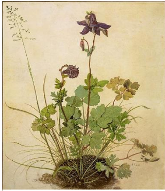
Figure 3. Columbine, watercolor on paper, Albrecht Dürer

The Renaissance: As science, medicine, and technology developed, so did the greater demand for realism in plant illustrations. In the early times of this period, botanical art shook free of the Byzantine style of art and became more realistic, although some are religiously rooted. The artists would also add in the scenery and add relevant objects in the background (Rix, 2012). By the 15 th -16 th century, botanical art was drastically refined when “both scientific precision and artistic sensibility were introduced by Leonardo da Vinci (1452-1519) and Albrecht Dürer (1471 – 1528).” (Buck & Rice, n.d.)