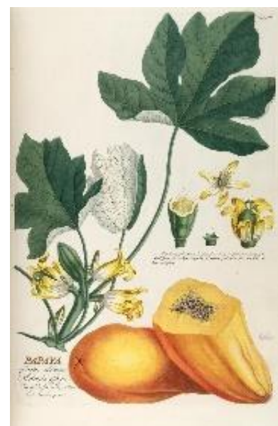
Figure 7. (right) Georg Dionys Ehret. 18th century. Many of the exotic fruits such as the Paw-paw and Pineapple discovered on the voyages of discovery quickly became fashionable in Europe. (n.d.)