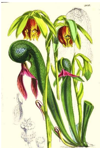
Figure 1. Darlingtonia californica , petal, stamen and pistil, transverse section of ovary – all magnified. Printed from "Darlingtonia Californica", by W. Fitch, del. et lith. 1871, Curtis's Botanical Magazine , Vol. 27, pg.192.

At its peak of sophistication and refinement of botanical art from around the 18 th century to present times, the aesthetic value and technical accuracy of botanical art was what defined it. In such creations, "all these works share an emphasis on careful observation and accurate rendering of botanical subjects so that the image is clearly "readable" by the viewer" (Ben-Ari, 1999).