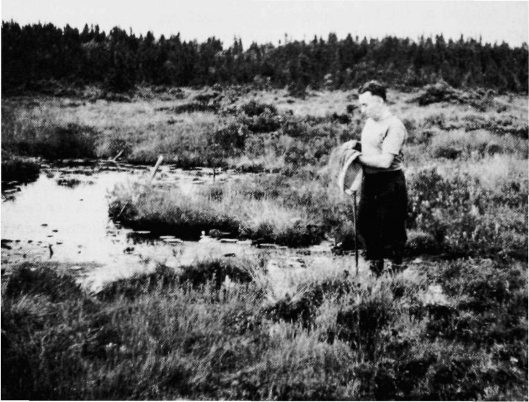
The author at a relict glacial pool near Southwest Harbor, Maine, type locality for Nymphula broweri Heinrich. These pools seem to be unusual in the northeast, but this species has been taken by the author in eight locations of this type in Maine. No out-of-state records are known.

of species from the area and the most accurate names possible. Exchanging for and purchasing additional species of this area to assist in determinations has continued.