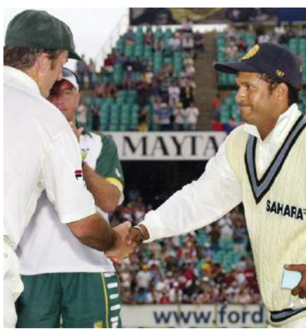
Shaking hands with an old adversary. The 2004 Sydney Test marked the end of Steve Waugh's fantastic career.