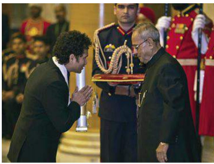
Bharat Ratna – the ultimate honour. With Honourable President Pranab Mukherjee in New Delhi on 4 February 2014.