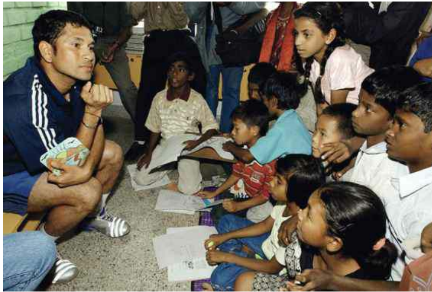
Listening to the children at a home for the underprivileged in Bangalore in 2003.