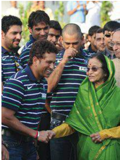
With Honourable President Pratibha Patil the day after winning the final.