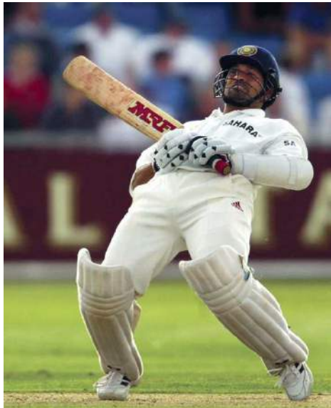
Evading a bouncer during a hostile spell from Andrew Flintoff in the third Test at Headingley in 2002.