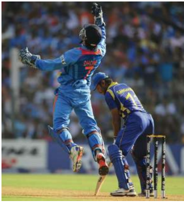
Sangakkara caught Dhoni, bowled Yuvraj – a huge moment in the final.