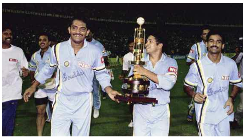
Enjoying the victory lap after winning the five-nation Hero Cup at Eden Gardens in November 1993.