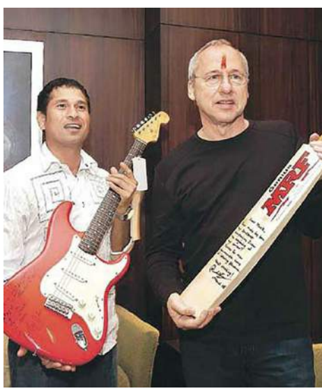
With Mark Knopfler of Dire Straits, one of my all-time favourite bands, in Mumbai. I treasure the guitar he gave me.