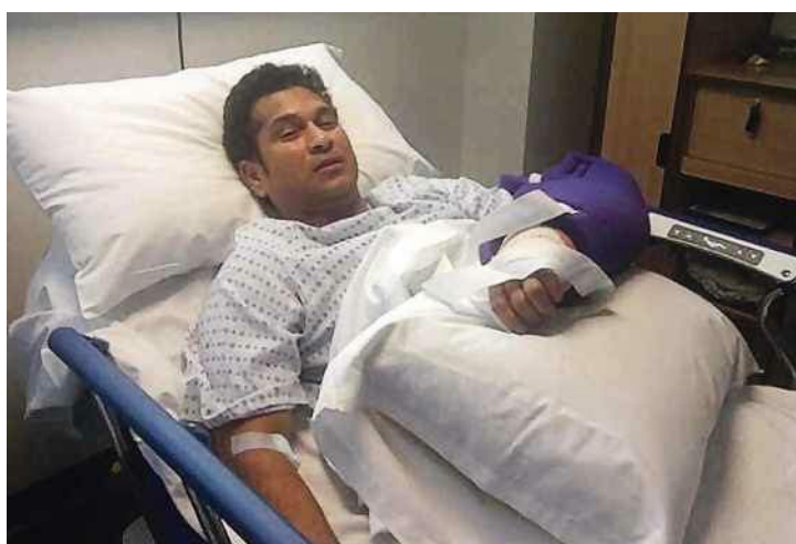
Recuperating after elbow surgery in 2005. It was the most frustrating injury of my career.