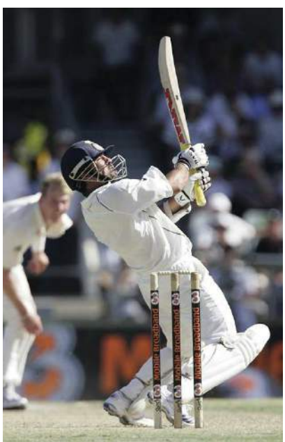
Playing an upper cut to Brett Lee on the way to a very satisfying 154* at Sydney.