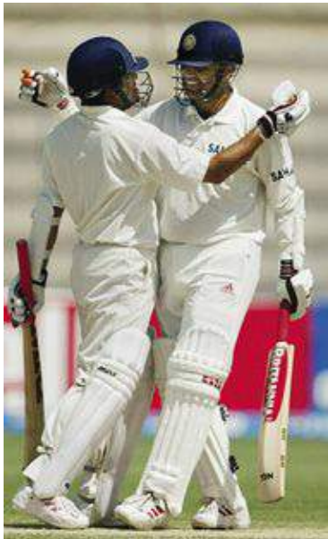
Congratulating Virender Sehwag on reaching 300 in Multan in 2004 – a terrific Test innings.