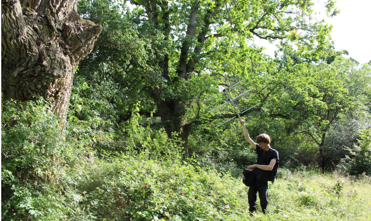
Figure 27. Searching for Cerambyx cerdo with transmitters.

collected. The biggest problem was getting the radio transmitters to stay on the beetles. The preliminary results showed that there were 13 beetles that moved over 100 meters. The longest movement was 453 meters for a male and 392 meters for a female. The size of the males seems to have an effect on how far they move. They could not show any effect of the temperature.