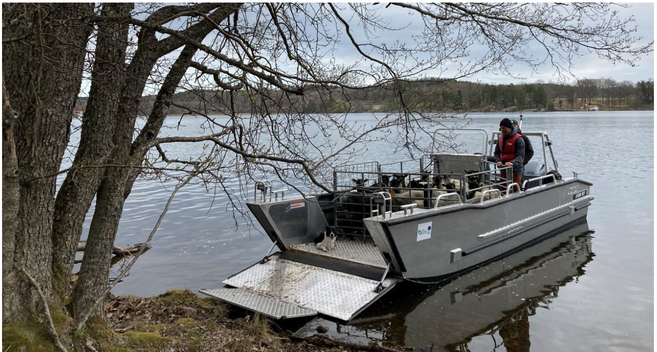
Figure 6. The livestock ferry with sheeps on that are waiting to disembark on Bromön.

It was more expensive than budgeted, but we got a lot for the money. The engine was installed by a Swedish company and they spontaneously said that we should be very satisfied and that a similar ferry built in Sweden had cost at least twice (and probably more) here. After the ferry arrived in the autumn of 2019, several Swedish archipelago residents have contacted us to find out more. The milestone for the ferry in place was 05/2018 and it was in place in October 2019.