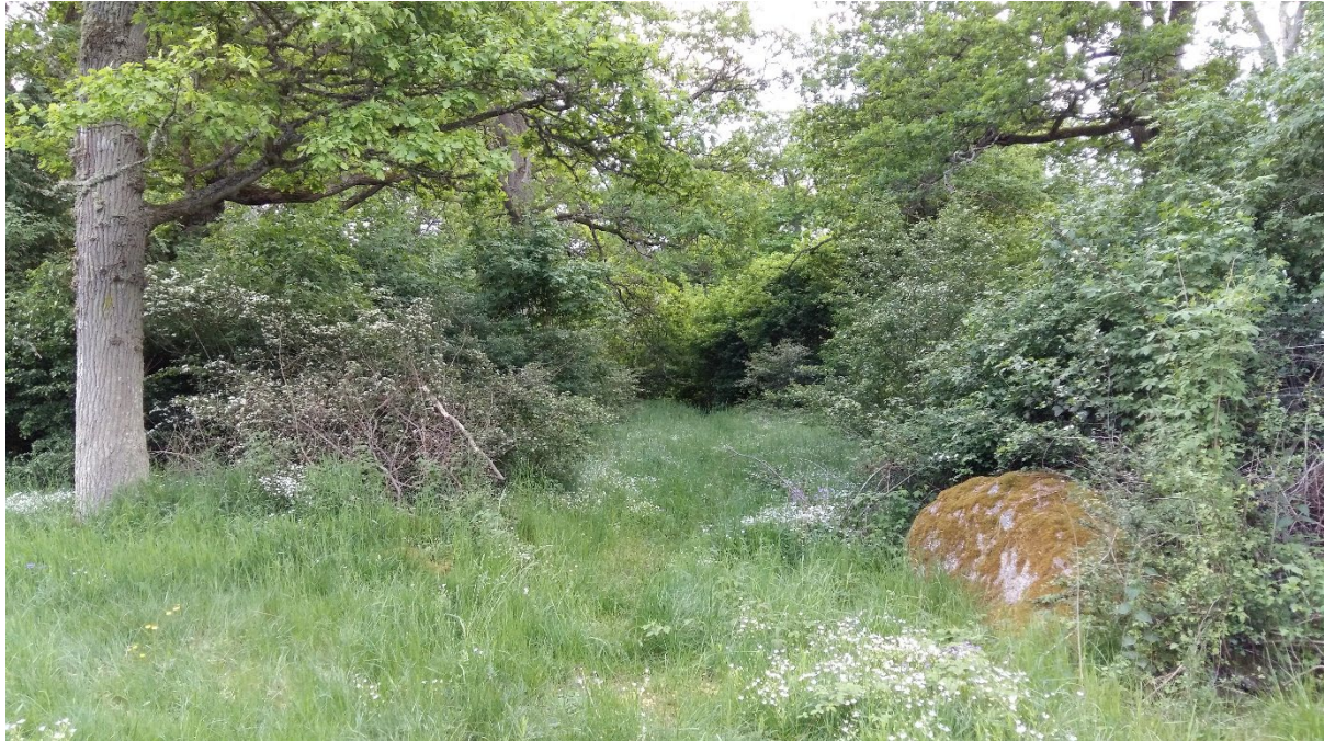
Figure 2. Before restoration at Kummeln.