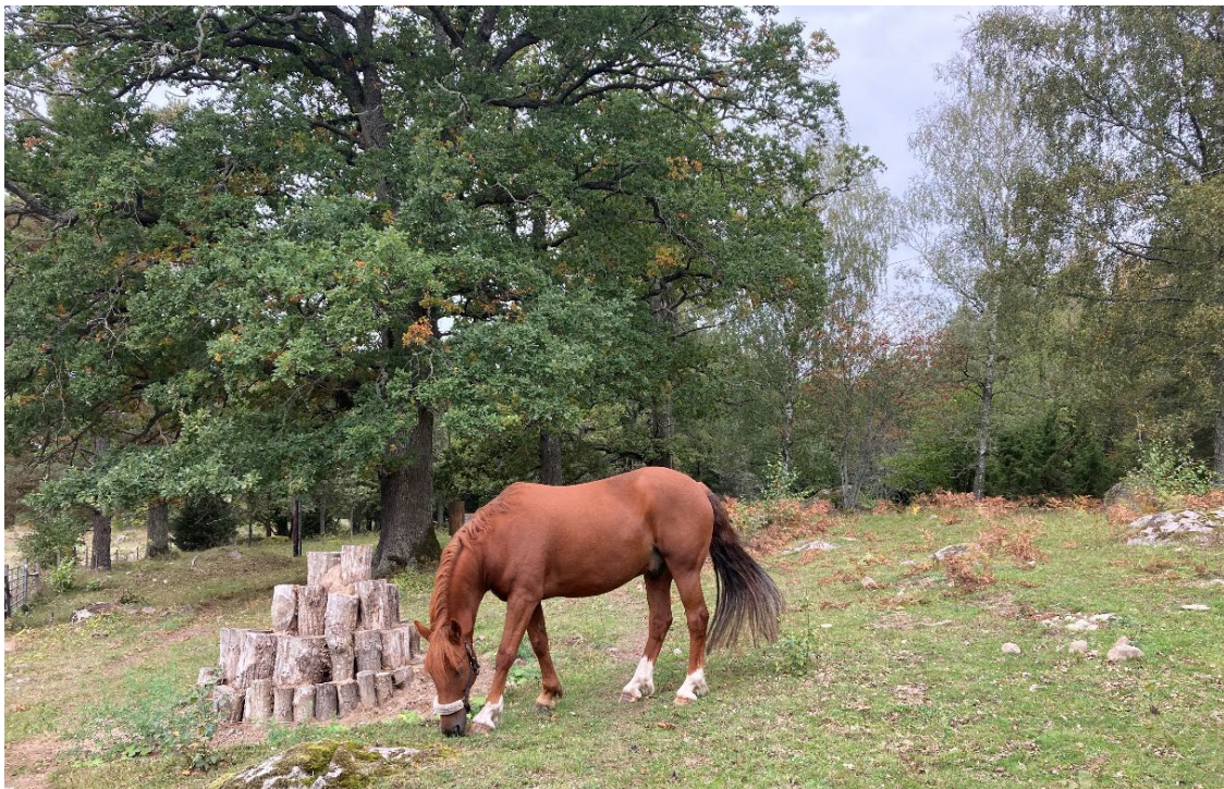
Figure 10. One log pile in an area grazed with horses.

The plan was to put out 185 stag beetle piles at 25 sites in total. 197 piles have been put out in 26 sites. The number of piles varies from a minimum of 1 (several sites) to a maximum of 60 (Tinnerö).