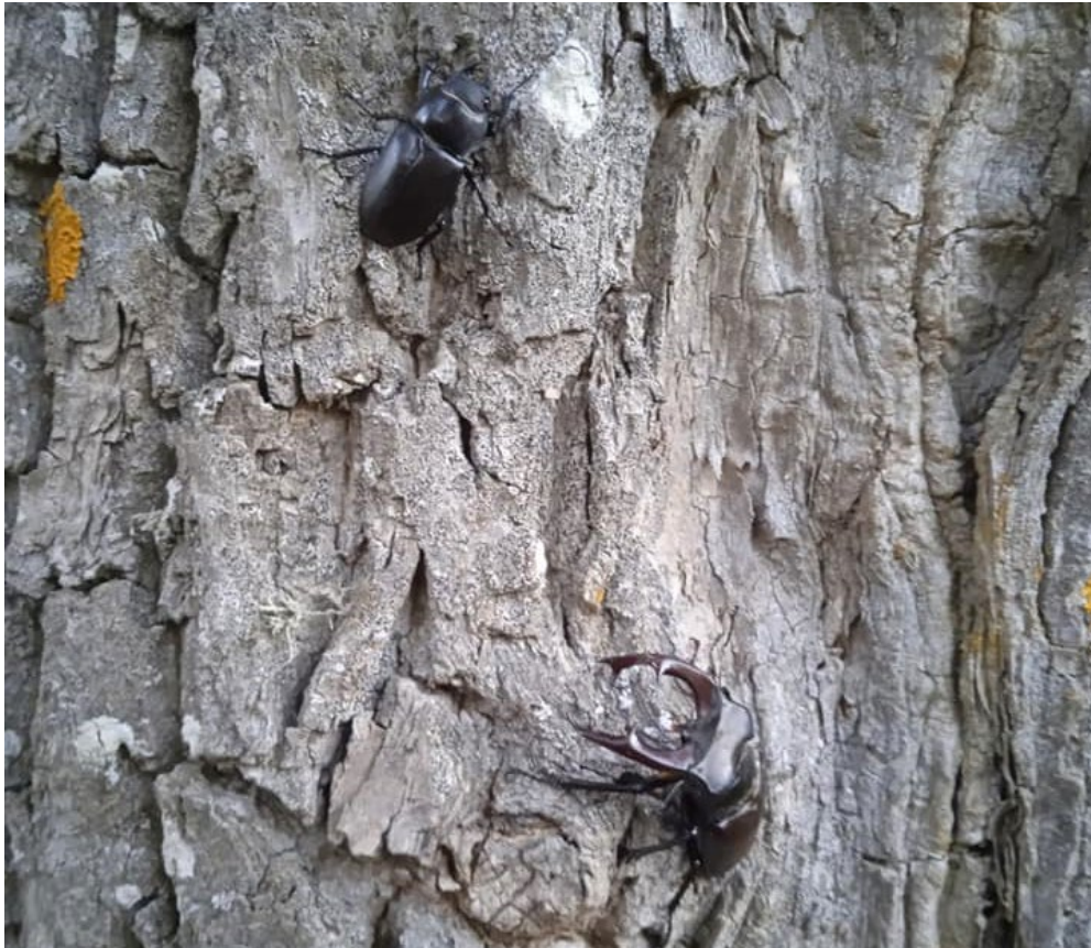
Figure 22. Two stag beetles, one female and one male seen at one of the walks and talks at Johannishus åsar.