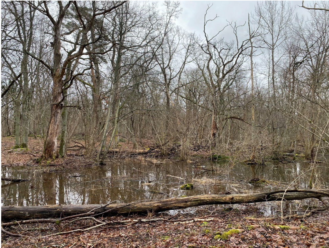
Figure 5. One of the wetlands at Halltorp SE0330024

which meant it was difficult to reach so far. But on the other hand, the machine had good accessibility in the area. It was difficult to fill the entire trench to the surrounding ground level at the plugs, because there were a lot of tree roots in the ground that you wanted to protect. The effect of the ditch plugs must be evaluated in the spring and winter, and then the ditch plugs can be supplemented with more soil if necessary. The advantage of this is that surrounding trees have time to adapt to new conditions a little more. The wetland is so newly constructed that the results will not be visible until 2023.