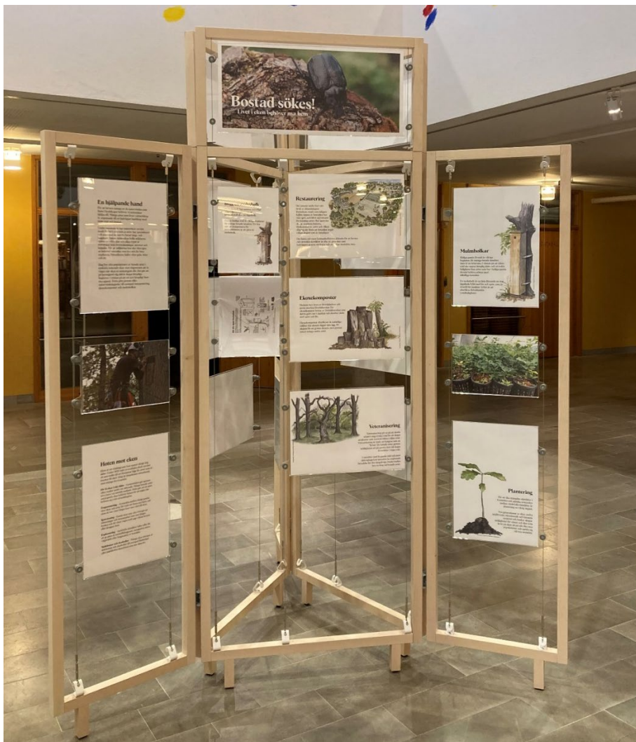
Figure 24. Exhibition done by CAB E at the library in Linköping.

The mobile exhibition that CAB E should do was completed in time and the technical monitor Camilla Strandberg-Panelius could see it at the visit 23 - 24 of November 2022. It was then at the lobby of County Board of Östergötland. In the beginning of January, the exhibition was moved to the library in the city of Linköping. The exhibition will be moved to other libraries in the county and so far, it is booked at a few different libraries until the beginning of May 2023.