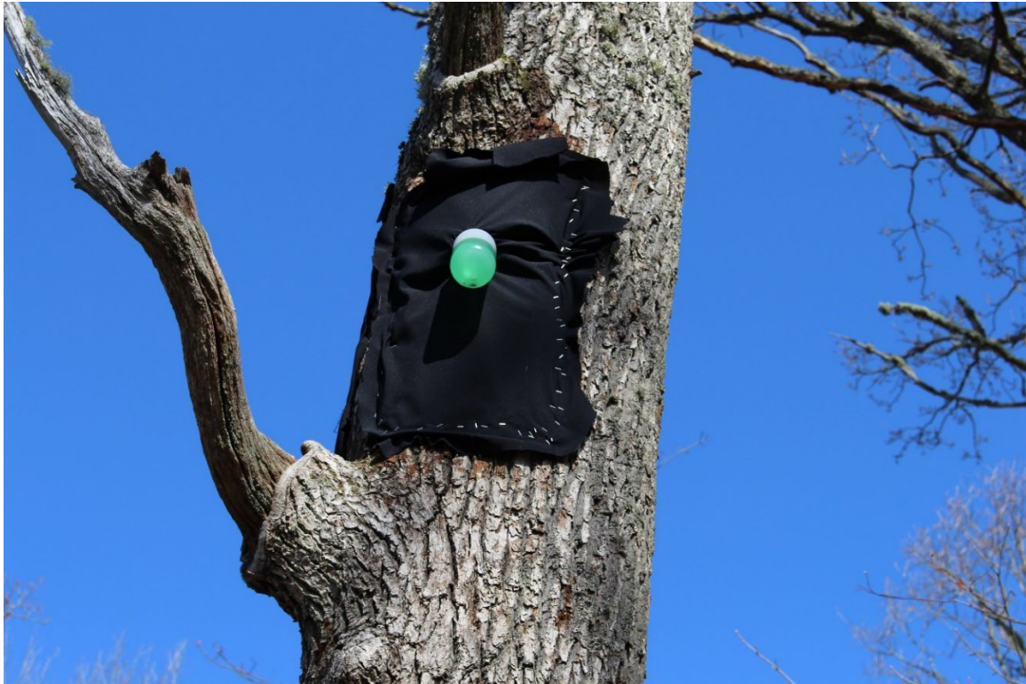
Figure 17. Trap for monitoring in one veteranised tree.

There was a lot of species found, in total 104 species of saproxylic beetles was found. 14 of these are on the Swedish red list. An average of 10 saproxylic beetles per cavity was found. This is a very good result. One individual of the Hermit beetle was caught in one of the veteranisation cavities. This is confusing since Hermit beetles normally appear late in the succession of the cavities and prefer to live in cavities with a large wood mould volume. It remains to be confirmed whether the individual came from the artificially created cavity or from an older pre-existing microhabitat that was already colonized.