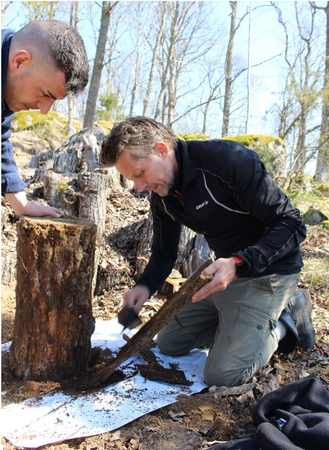
Figure 15. Field work with monitoring of the log piles.