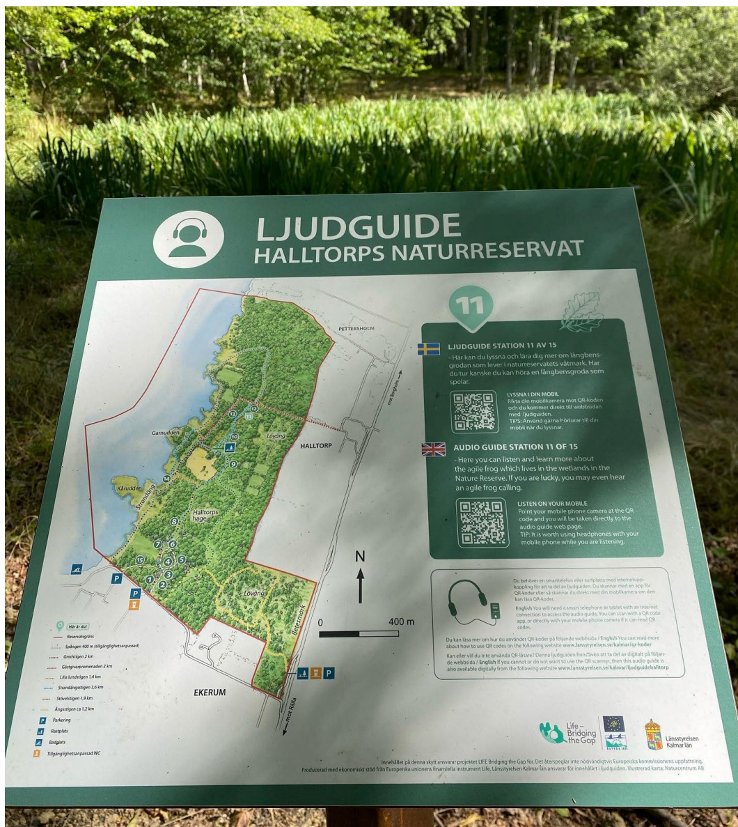
Figure 21. One sign with QR-code to the audioguide at Halltorps nature reserve, SE0330024