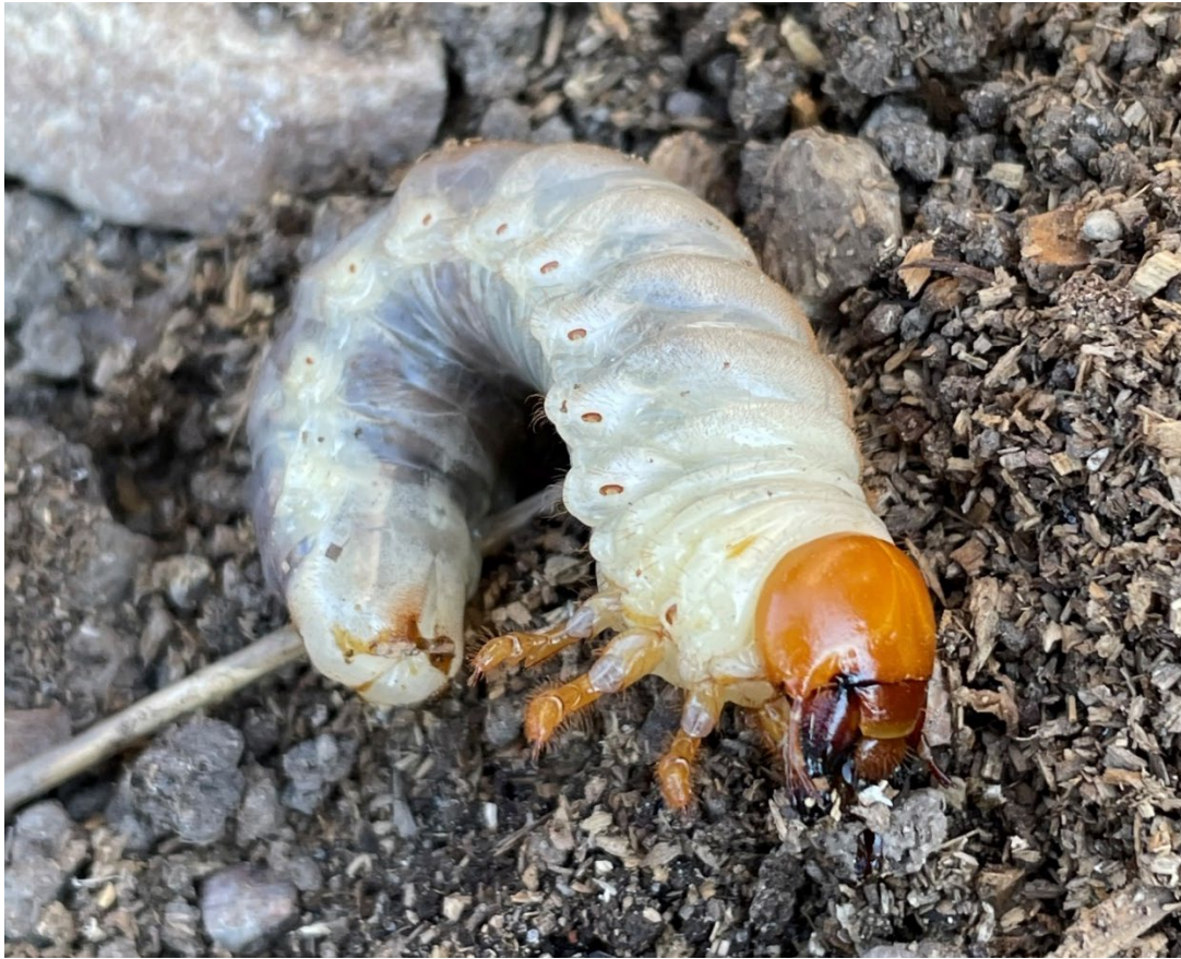
Figure 16. Larvae of stag beetle found during the monitoring