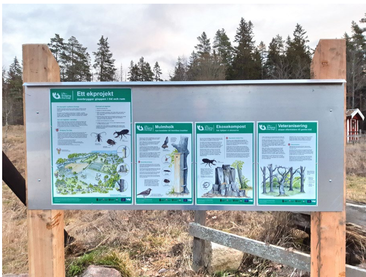
Figure 19. Project sign and the three actions signs.

Three action signs are produced, 60 copies of each. One about veteranisation, one about wood mould boxes and one about stag beetle habitat piles. After the regular order CAB K has printed another 6 copies of the sign about wood mould boxes. The signs was delivered in Midterm report, see 9.1.1 Deliverables in LIFE Bridging the Gap, and they can also be found on the website. https://lifebridgingthegap.se/material/skyltar/