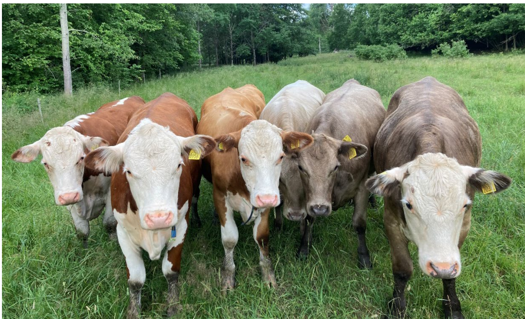
Figure 4. Some of the important grazers at Tinnerö.

This action should have been done in 20 sites and that is also how many sites the action was done in. But in some sites the action has been removed and in others it has been added. 810,4 hectares was in GA and we have worked in 845,5 hectares. There is a mix of grazing and cutting that has been done. The grazing animals are a key-factor to get the habitats in good status.