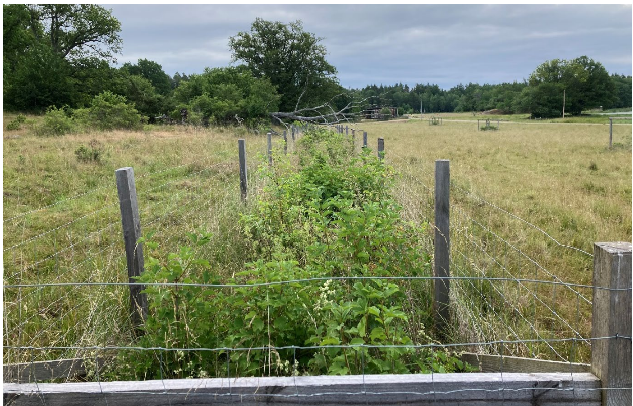
Figure 8. One of many elongated plantings at Tinnerö.

Planting of large oaks has been done at 11 sites in total. There are a little less hectares planted in this action than in GA, however that depends on that the area is instead as C3.4. So, all the large oak is planted but when it has been possible also some bushes was planted around the trees.