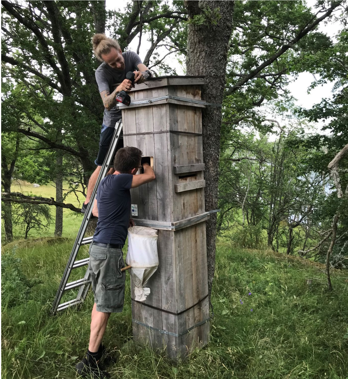
Figure 14. Field work with monitoring of one wood mould box.