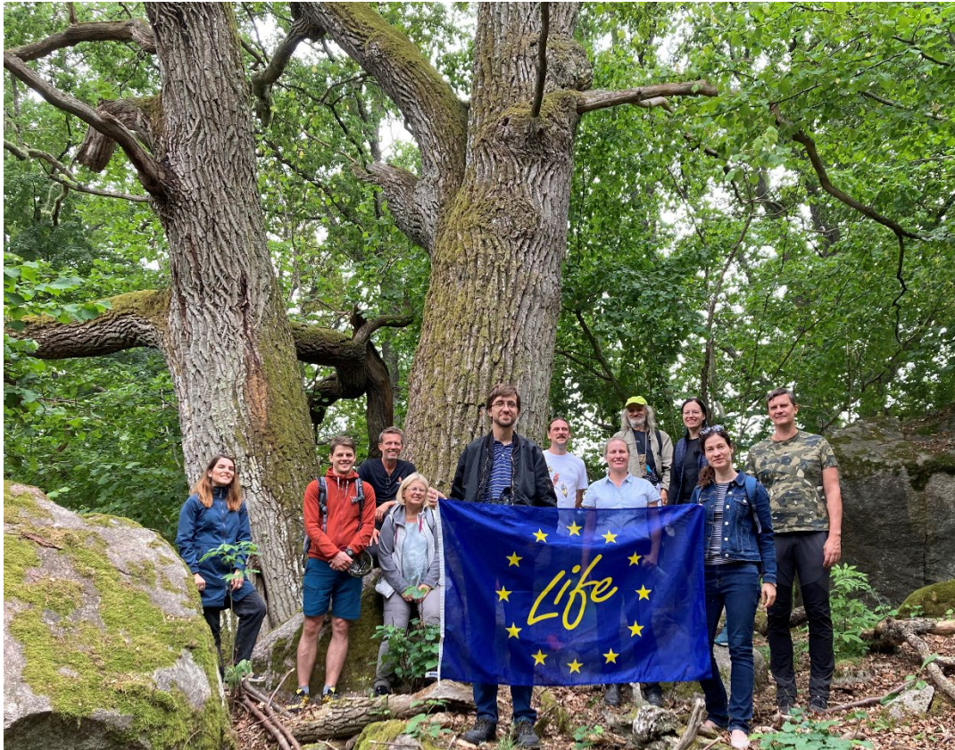
Figure 23. LIFE For Species in Åtvidsnäs nature reserve

Later in May 2019 we were visited for two days by representants from Estonia. They visited LKP and CAB E. We also arranged so that they one day had a meeting with Swedish Board of Agriculture. In June the Lithuanian/Latvian project LIFE Osmoderma visited LIFE BTG for several days. All partners were involved in this networking. In August 2022 LIFE for Species from Latvia visited LIFE BTG. If covid has not been we probably should have got even more visits from other projects.