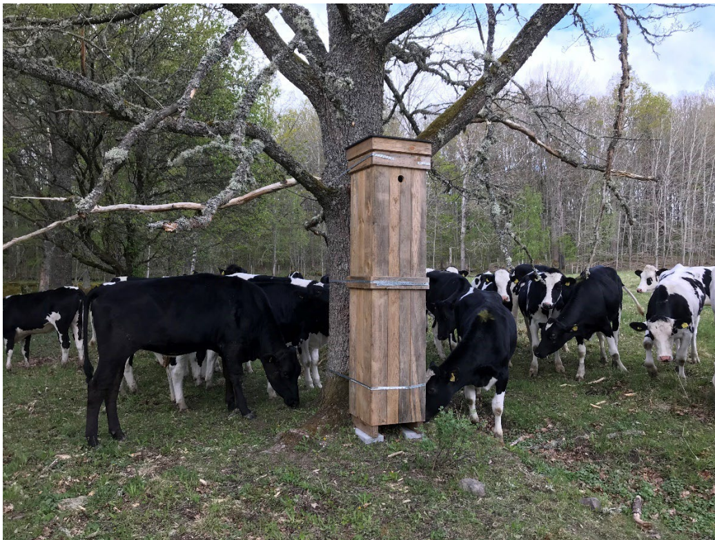
Figure 9. Curious grazing animals around a wood mould box at Viggeby nature reserve.

The plan was to put out 443 wood mould boxes at 28 sites in total. 480 boxes have been put out in the 28 sites. The number of boxes varies from a minimum of 2 (Borga hage) to a maximum of 58 (Tinnerö). This means that 8% more boxes than planned have been set up.