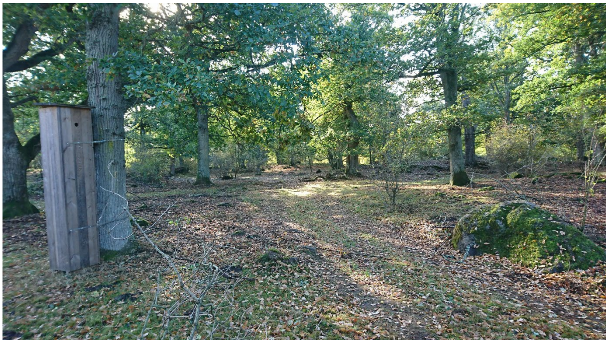
Figure 3. After restoration at Kummeln at the same spot as above.