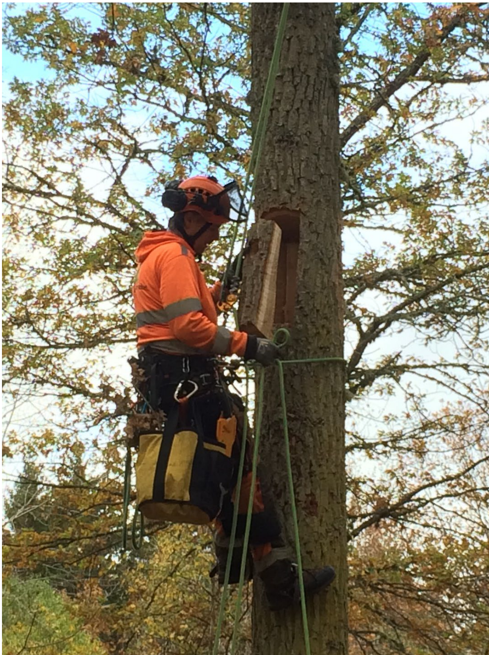
Figure 11. An arborist making a nest box in a tree.

The plan was to veteranise 1236 trees at 27 sites in total. 1458 trees have been veteranised. The number of veteranised trees varies from a minimum of 5 (Haglö and Ullstämna) to a maximum of 273 (Halltorp).