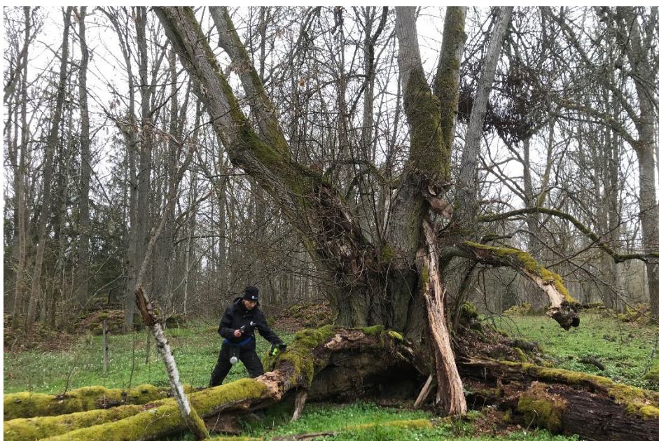
Figure 13. Monitoring of ancient trees in Getebro.

The survey of the Natura 2000 areas showed a large number of trees with high conservation value. In total, there were an average of 10.9 trees of conservation value per hectare (3–35 trees per hectare) in the survey areas, which is significantly higher than the average for Östergötland county's oak habitats, which is 0.12. The number of younger oak trees and other tree species other than oak becoming the next generation of old trees (0.50–0.99 meters in diameter) are also high, 37 and 26 trees per hectare, respectively. The average for Östergötland county is 5.2 younger oaks per hectare. A total of 57 percent of the trees with high conservation value were hollow.