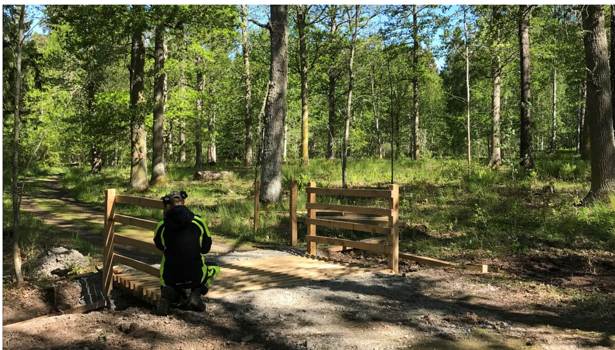
Figure 7. One of the cattle grids at Viggeby is installed.

In the application cattle grids should be installed in 3 sites whereby the grazed pasture crosses a public road. The action is completed at two of these Viggeby (SE230387) and at Strandskogen (SE0330205). At the last one two instead of one cattle grid was installed. At the third site Åtvidsnäs, the action was not done. When detailed planning of the work was done, it became clear that there was no need of this action here.