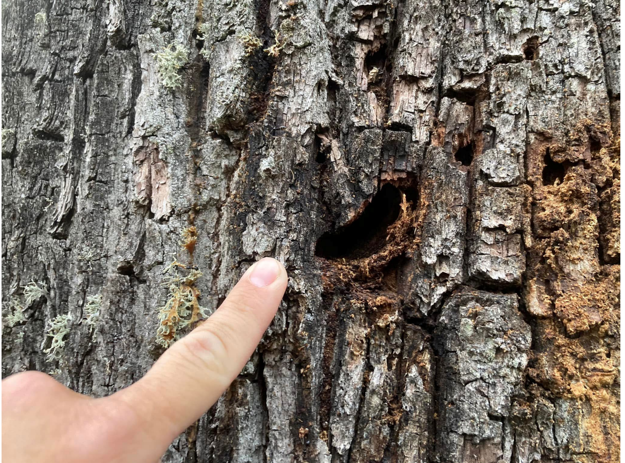
Figure 18. One of the exit holes from a hatched Cerambyx cerdo

Deliverable: 9.1.7 Uppföljning av större ekbock inom projektet LIFE Bridging the Gap