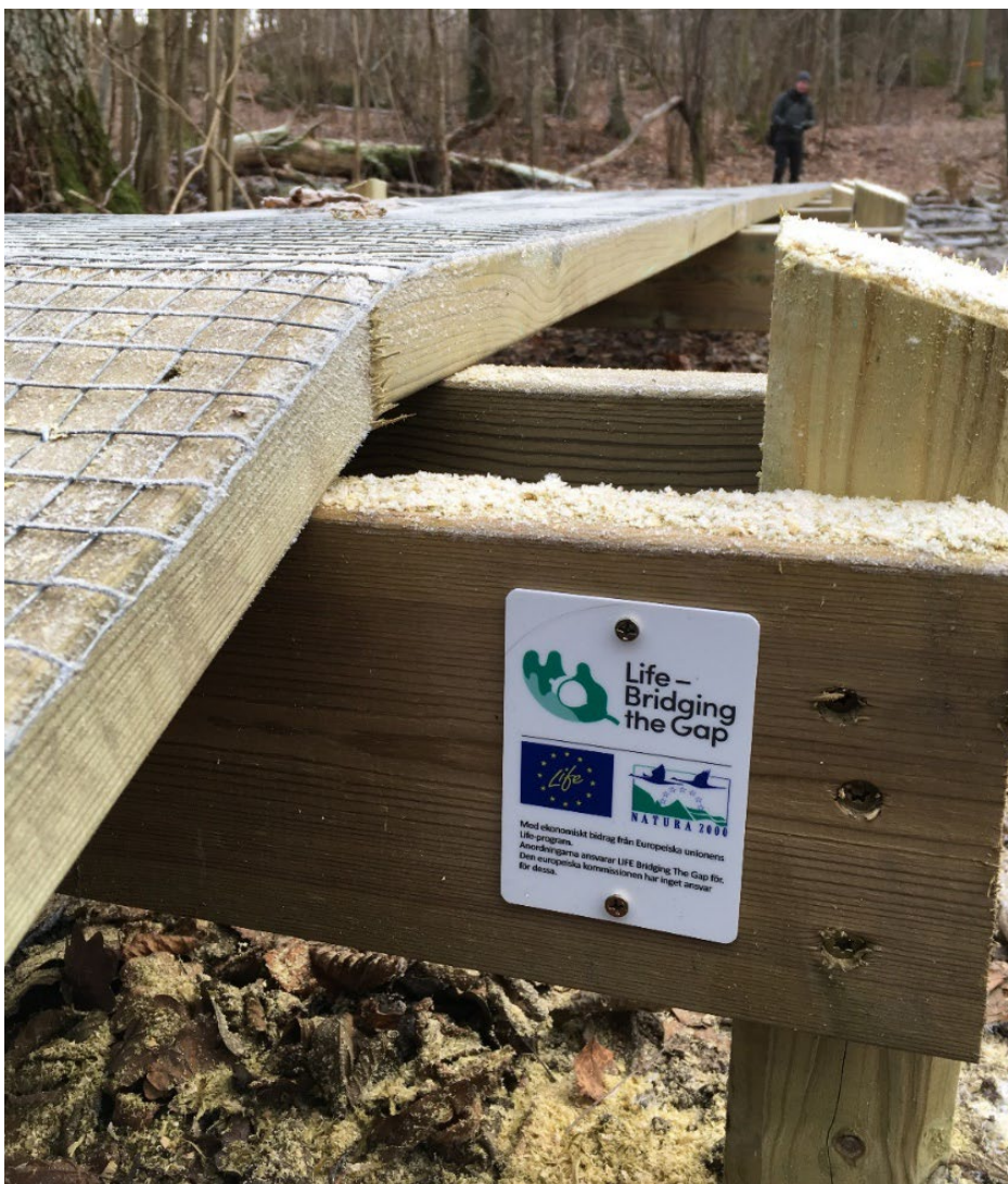
Figure 20. One of the boardwalks at Västerby with the small sign on so that all could see that the boardwalk has been produced in the project.

This action has taken place at 12 sites and the action is a mix of different actions. In total the result is three walking trails with a total distance of 7,9 km, 5 picnic tables, 9 carparks, 3 boardwalks, 2 mobile guides, 14 benches and two barbeque areas. See Annex 9.2.6 E-actions per site, for more details.