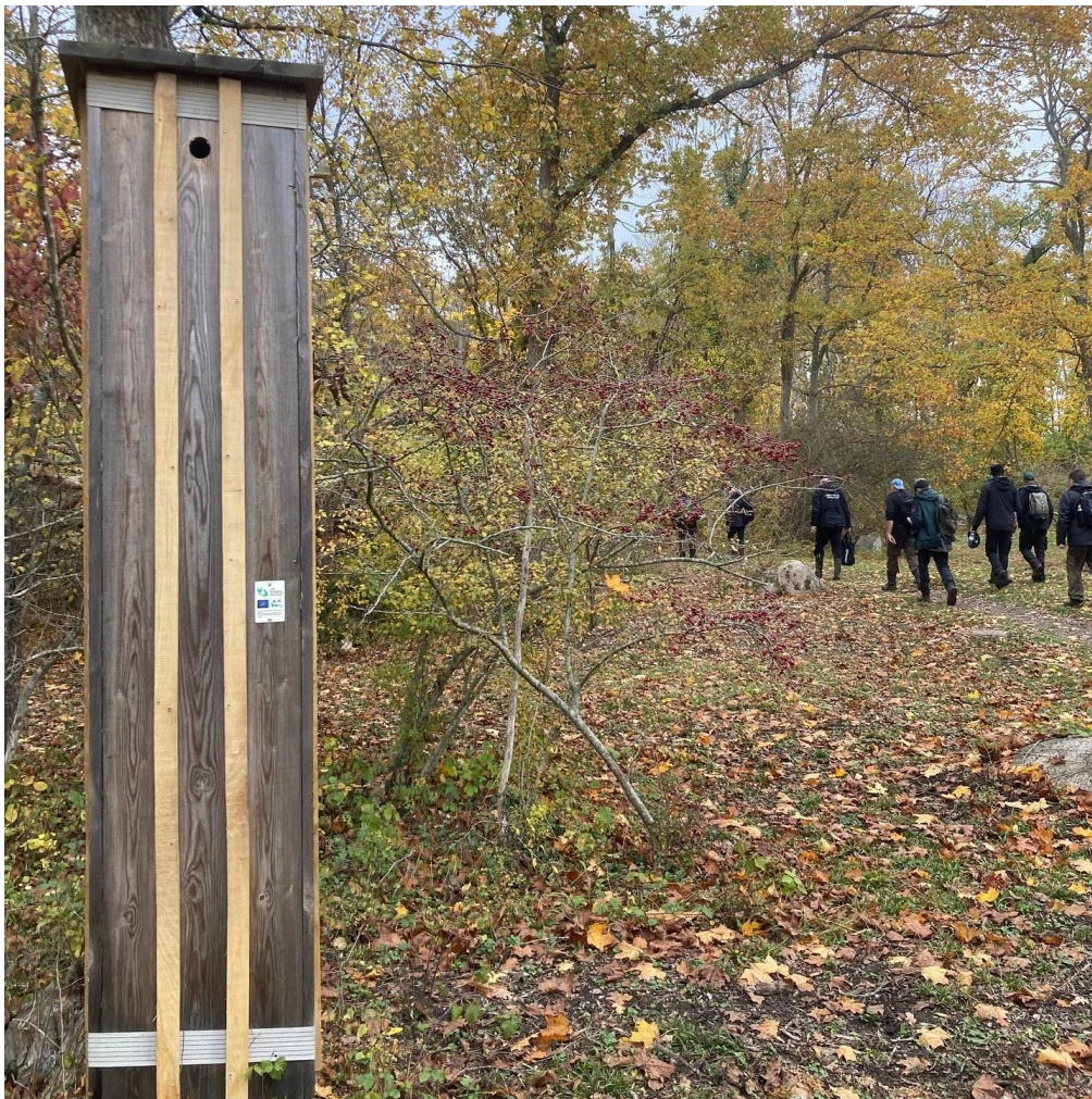
Figure 26. One fixed wood mould box with new battens.

The wood mould boxes used in the project are much larger than those previously used. The boxes are clearly visible and have received a lot of attention from both nature conservation managers and the public.