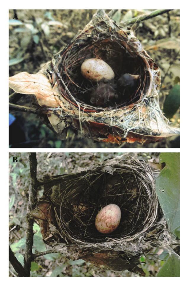
Figure 3. The nest of the Helmeted Manakin Antilophia galeata with an egg and a freshly hatched nestling. Nests of this species are a cup attached by its top lip in the angle of a forked branch ( A ). Nest constructed between two nearby parallel branches, evidencing the presence of leaf petioles and some unidentified vegetable fibers in the inner layer of the structural zone ( B ).

Spider silk was collected within a radius of ~100 m from the construction site, as suggested by the several observations of females collecting material for nest construction. At each visit in which she brings material, the female sits in the unfinished nest and, with the wings held close to the body, she makes circular movements in the nest, shaping it with her legs while compressing the nest material with her breast and flanks. The female then perches on the edge of the nest and arranges the leaves and petioles with its beak, sits again in the nest and compresses and shapes the newly added material