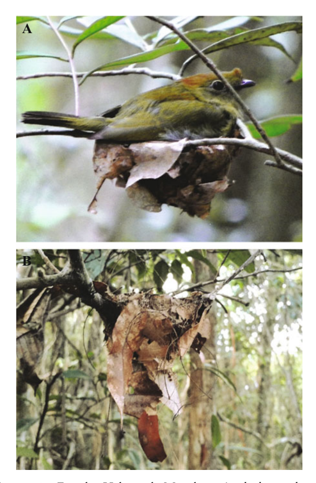
Figure 2. Female Helmeted Manakin Antilophia galeata incubating its eggs ( A ). Note that the crest, nape and back of this bird is slightly washed with red, what suggests that it is an old female, as previously reported for the species (Marini 1989) and members of Chiroxiphia (Kirwan & Green 2011). Side view of another nest, showing a long tail made of dry leaves, leaf petioles, and horsehair fungus hanging on its outer walls and lower part ( B ).

Nests (Figs. 2 & 3) show three well-delimited zones: attachment, structural, and decorative. The nest was attached to the fork mostly with spider silk. The structural zone is constructed with dry broad leaves, leaf petioles, and horsehair fungus ( Marasmius ), which