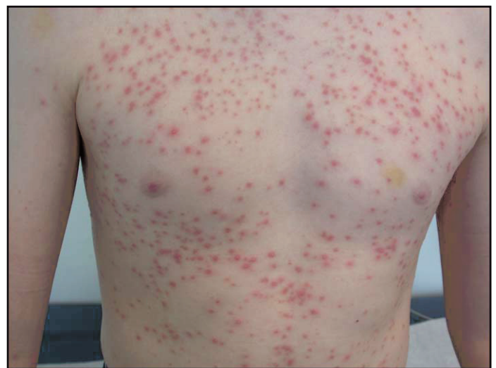
Fig. 3. Folliculitis on the trunk, featuring erythematous papules. Culture yielded Pseudomonas aeruginosa .

P. aeruginosa bacteremia is a life-threatening disorder that may feature cutaneous lesions with characteristic morphology. Investigators have suggested that P. aeruginosa bacteremia is associated with the greatest mortality of all Gram-negative bacteremias. [39] Early recognition of dermatologic findings may provide critical clues that prompt rapid initiation of appropriate therapy. Cutaneous manifestations of systemic P. aeruginosa infections include subcutaneous nodules, ecthyma gangrenosum, and gangrenous cellulitis. Patients with severe burn wounds are also highly susceptible to deadly pseudomonal infection. Finally, patients with AIDS who then become opportunistically infected with P. aeruginosa can display unique cutaneous manifestations.