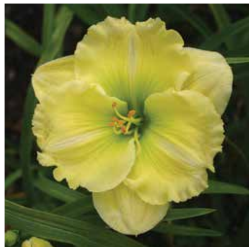
H. 'Emerald Splendor' (T. Wilson) Dip: 24", 5"; HM 1997