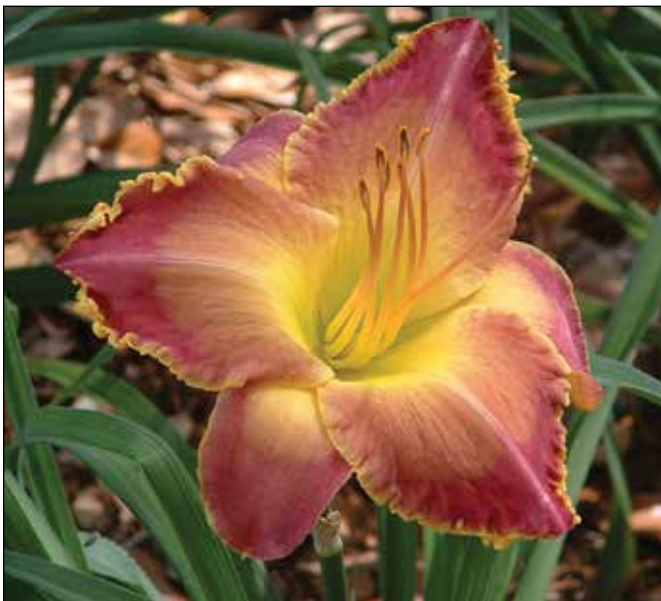
H. 'Elizabeth's Magic' (Salter 1990)