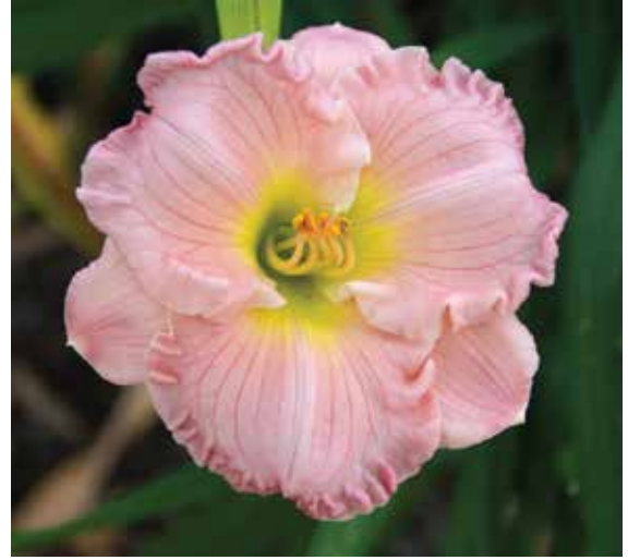
H. 'Bonny Pink Ruffles' (Sikes) Dip: 21", 4.5"; HM 1997