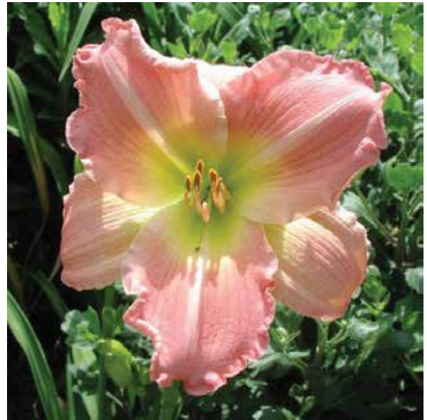
H. 'Neon Pink' (Hansen) Dip: 26", 5"; HM 2000