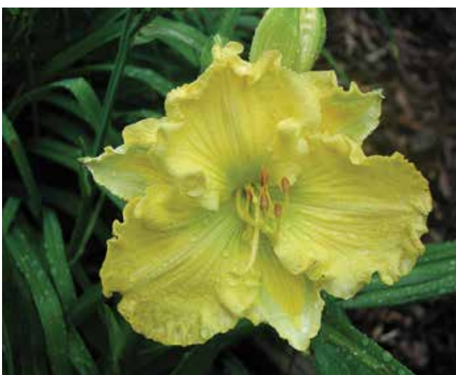
H. 'Siloam Extra Special' (P. Henry) Dip: 20", 7"; HM 1998