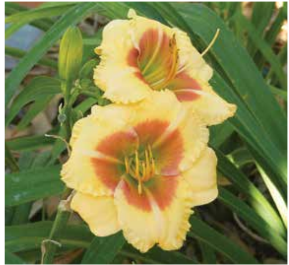
H. 'Sweet Pepper' (Joiner) Dip: 24", 3.5"; HM 1999