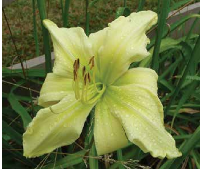
H. 'Give Me Eight' (Reinke) Dip: 48", 8" polymorous; HM 1998