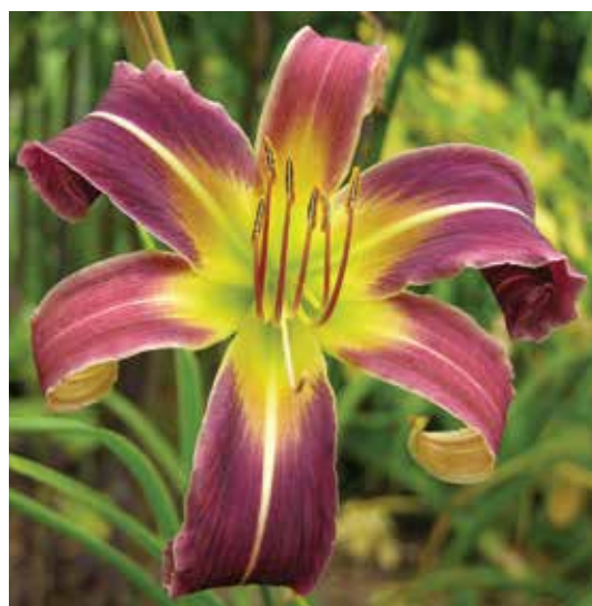
H. 'Prince of Purple' (G. Couturier) Dip: 34", 5.5" spider ratio 4.10:1; HM 2009