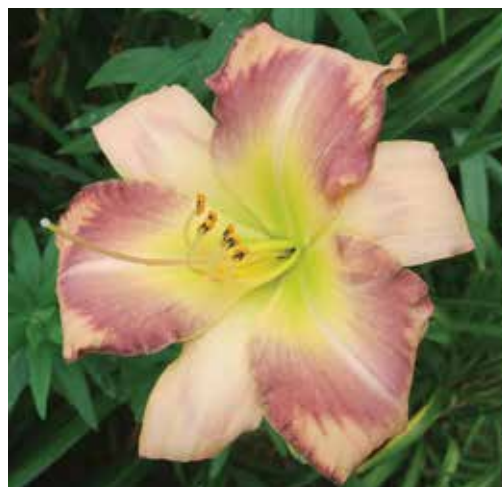
H. 'Sophia's Love' (Yonski) Tet: 30", 7.5"; HM 2000