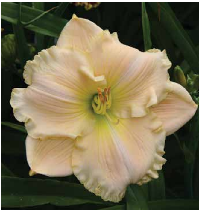
H. 'Siloam Ralph Henry' (Henry-P. 1988)

Glawson' (1986), a 16", 2.87" blush pink with a deep burgundy eyezone and a green throat, won an HM in 1990. 'Siloam Leo Sharp' (1986), an 18", 2.87" blue orchid with a smoky gray eyezone and a green throat, won an HM in 1991. 'Siloam Paul Watts' (1988), an 18", 4.75" red self with a green throat, won an HM in 1992 and an AM in 1995. 'Siloam Ralph Henry' (1988), an 18", 5.5" pale blush self with a green throat, won an HM in 1993 and an AM in 1997; it also became a significant parent in its diploid form and as a tetraploid conversion. 'Si-