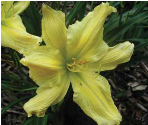
H. 'Claws' ( Zahler ) Dip: 30", 6" HM 2001