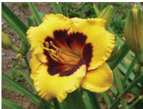
H. 'Witches Wink' (E.H. Salter) Tet: 26", 3"; HM 1997, ATG 1999, FS 2008