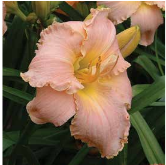
H. 'Concert Tour' ( Sellers ) Tet: 30", 6" HM 1998