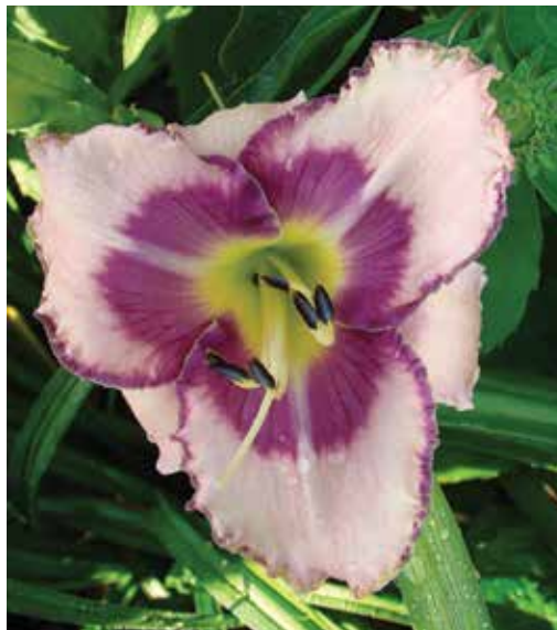
H. 'Edge Ahead' (Sellers) Tet: 28", 5.5"; HM 1997