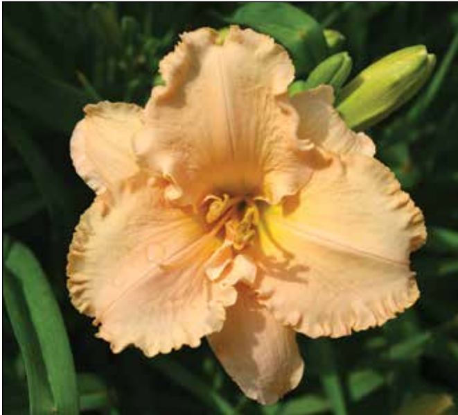
H. 'Elizabeth Salter' (Salter 1990)

orange yellow blend with a green throat, won an HM in 2006. On the other hand, 'Quest for Excalibur' (1989), a 24", 6" purple self with a green throat, remains overlooked. 'Elizabeth Salter' (1990), a 22", 5.5" pink self with a green throat, won an HM in 1995, an AM in 1998, and the Stout Silver Medal in 2000. It remains one of Jeff's most popular cultivars. 'Jungle Mask' (1990), a 28", 6" cream pink edged in purple with a royal purple eyezone above a green throat, won an HM in 1994. 'Elizabeth's Magic' (1990), a 24", 6" lavender purple edged deep gold with a green throat, won an HM in 1995. 'Prince of Midnight' (1990), a 26", 6" dark royal purple with a green throat, also won an HM in 1995. Jeff Salter won the Bertrand Farr Silver Medal in 2003. As of this date, he is credited with 719 cultivars.