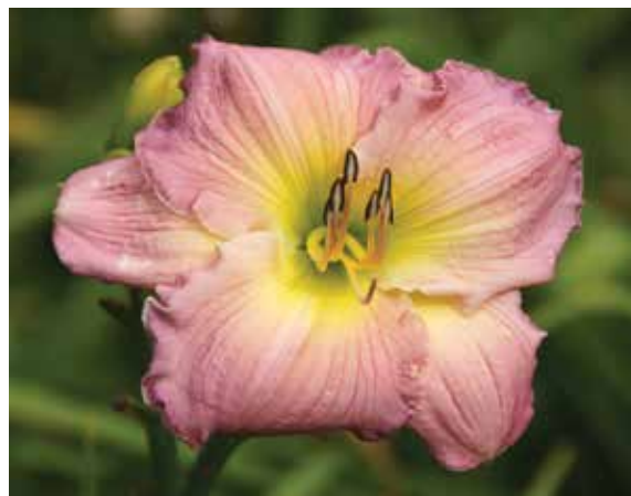
H. 'Island Glamorous Guest' (Rasmussen) Dip: 26", 5"; HM 2008