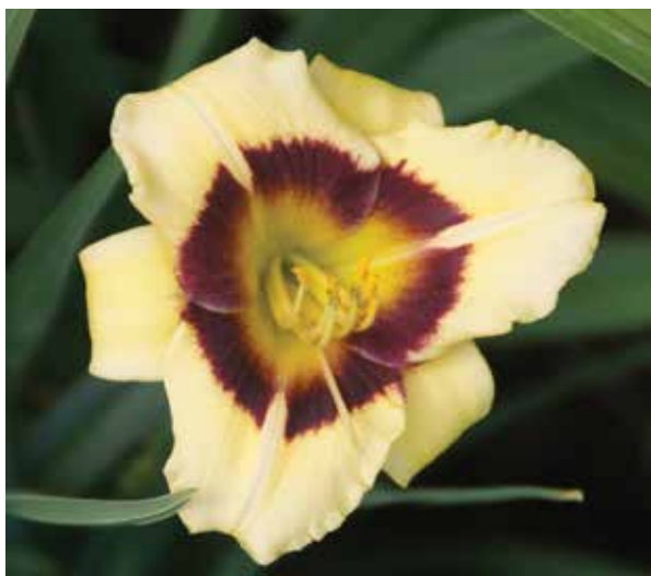
H. 'Daggy' (Joiner) Dip: 20", 3.5"; HM 1996