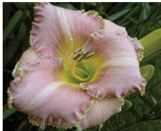
H. 'Be Thine' (Sellers) Tet: 28", 5.5"; HM 1998