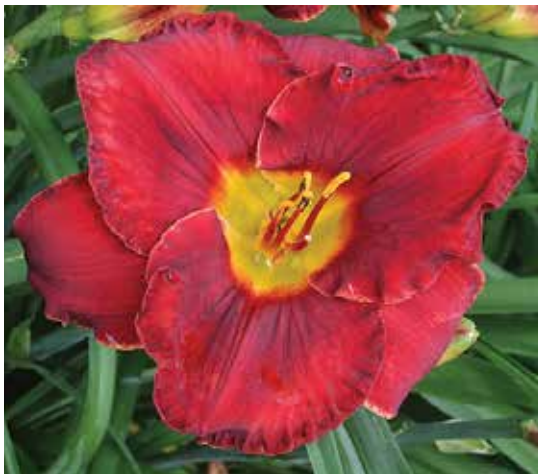
H. 'Forever Red' (D. Kirchhoff) Tet: 25", 5.5"; HM 1999