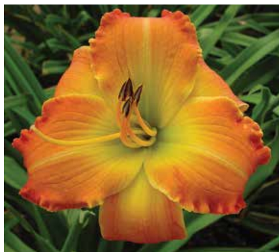
H. 'At Sunset' (Whatley) Tet: 25", 6"; HM 2005