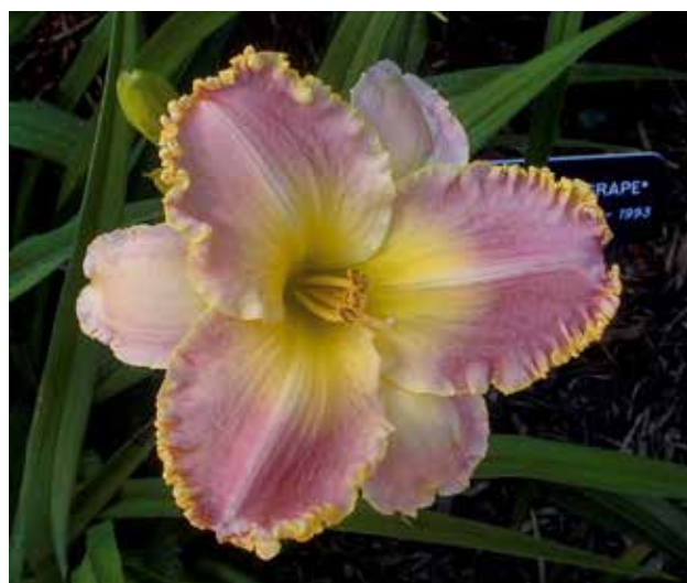
H. 'Chris Salter' (Salter) Tet: 26", 6" HM 1997, AM 2000