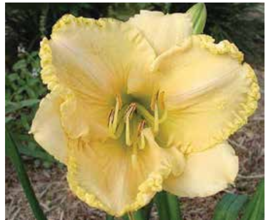
H. 'Grand Marshal' (E.C. Brown) Tet: 28", 6.5"; HM 2002