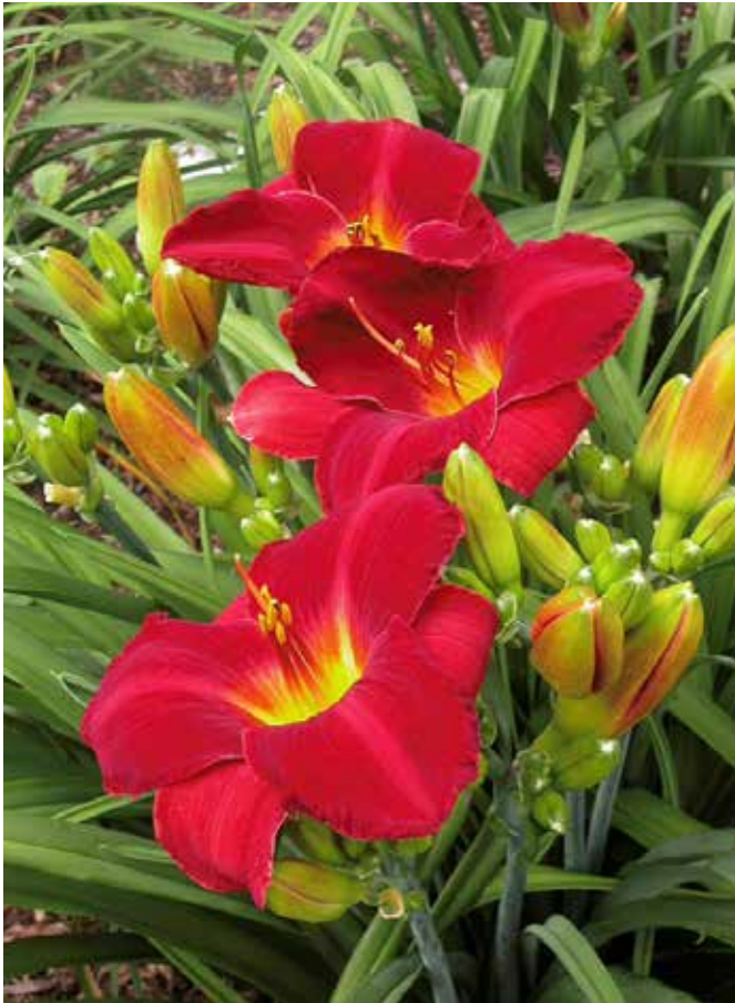
H. 'Sound of Cannons' (Sellers) Tet: 28", 5.5"; HM 2007