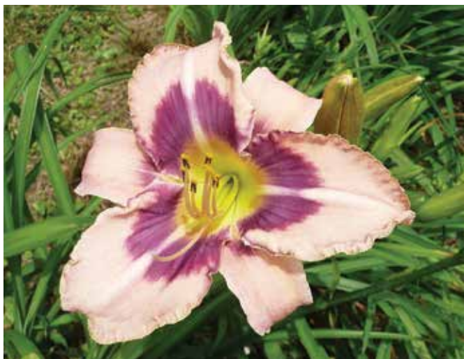
H. 'Butterfly Encounter' (B. Brooks) Tet: 24", 5"; No Awards