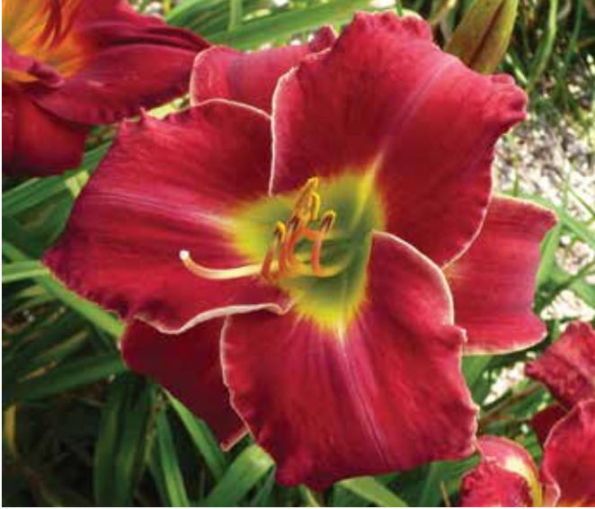
H. 'Red Grace' (Benz) Tet: 34", 5.5"; HM 2000