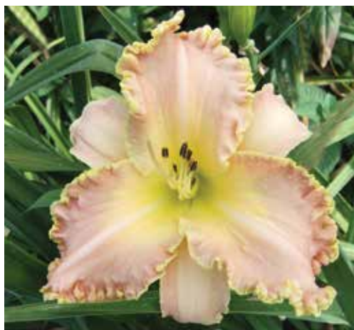
H. 'Enchanted April' (Trimmer) Tet: 24", 5.5"; HM 1999