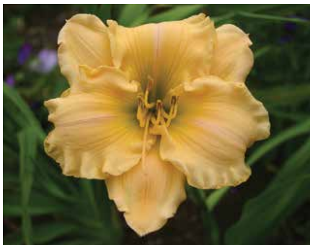
H. 'With Softer Gleam' (Billingslea) Dip: 22", 6"; No Awards