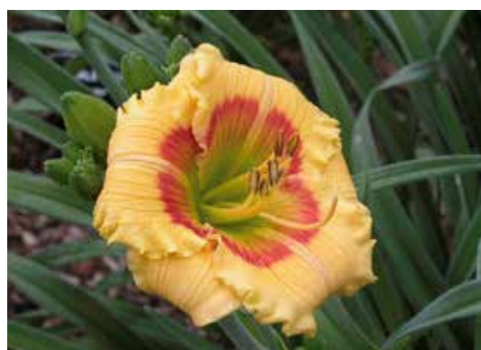
H. 'Pimiento Pepper' (Joiner) Dip: 20", 3.5"; No Awards