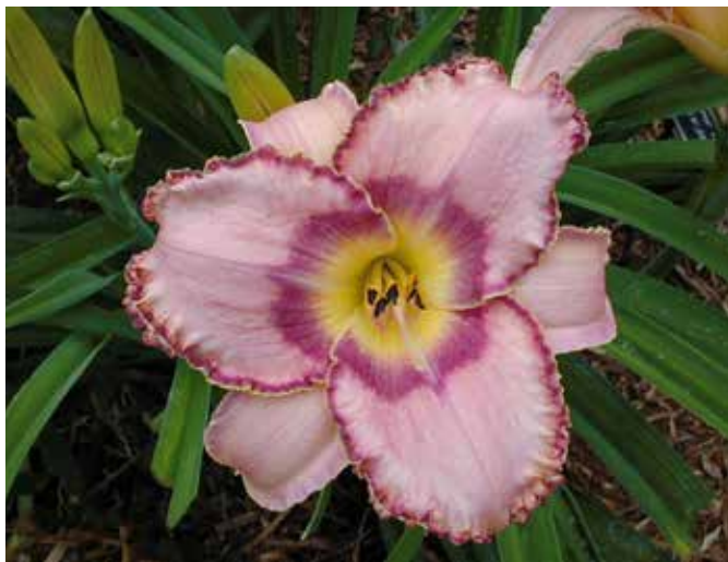
H. 'Creative Edge' (Stamile) Tet: 23", 6" HM 1998, AM 2001