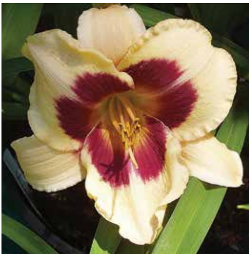
H. 'Yum Yum Plum' (B. Brooks) Tet: 22", 5"; HM 2001