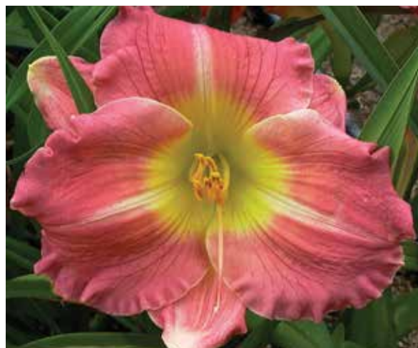
H. 'Be My Valentine' (L. Ward) Dip: 16", 7"; HM 1999