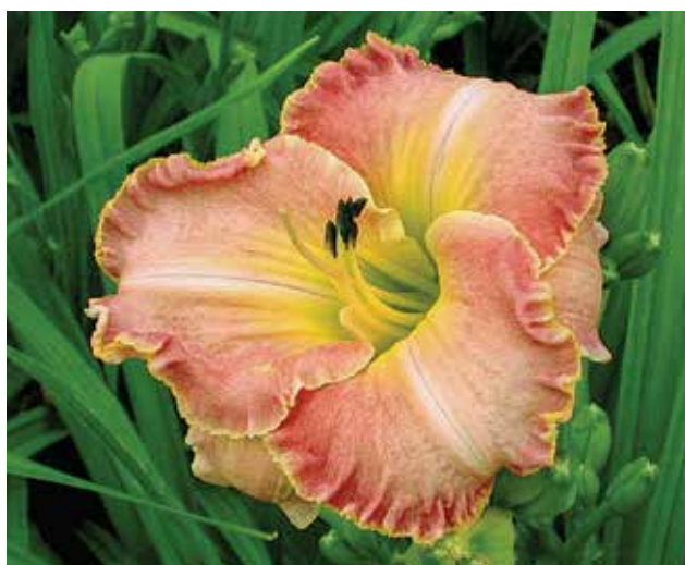
H. 'Calyso Bay' (Salter) Tet: 28", 6"; HM 1999