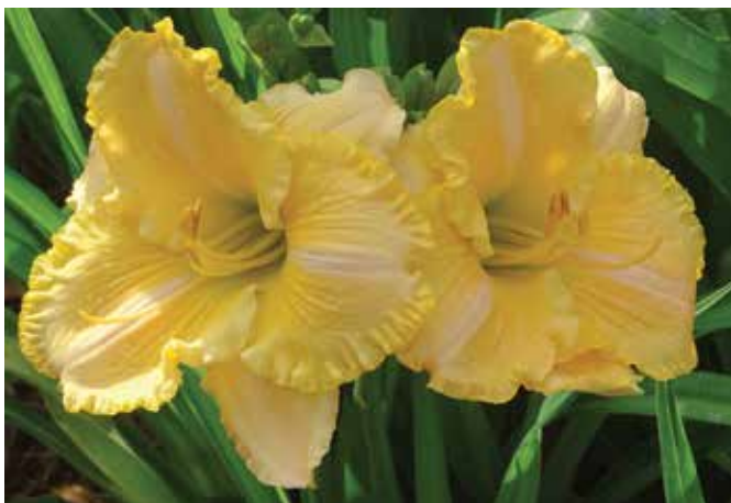
H. 'Sherry Lane Carr' (Carr) Tet: 23", 6.5"; HM 1999, AM 2002