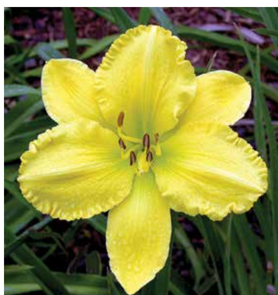
H. 'Solar Music' (Whatley) Tet: 36", 8"; HM 2002, XLD 2003