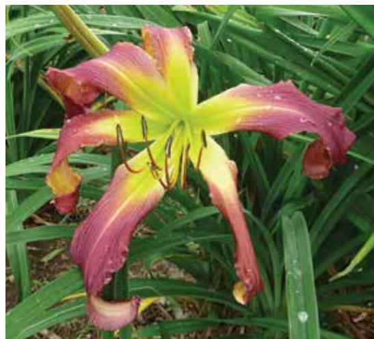
H. "Yabba Dabba Doo" (Hansen) Dip: 30", 10" spider ratio 4.35:1; HM 1997, HOS 1997, AM 2000, ESF 2007