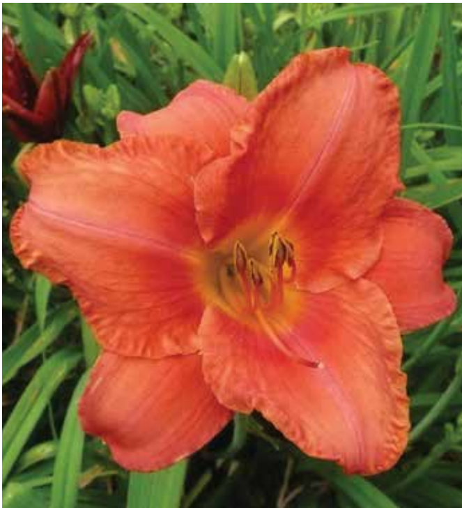
H. 'South Seas' (Moldovan) Tet: 30", 5.5"; HM 1998