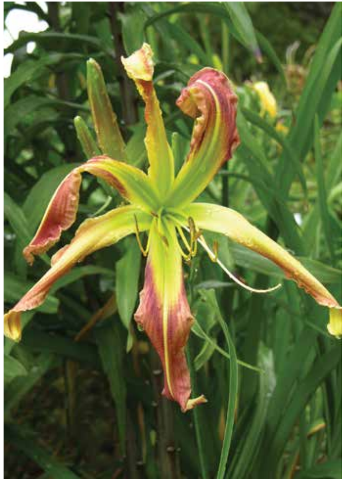
H. 'Wildest Dreams' (Temple) Dip: 26", 10" spider ratio 6.80:1; HM 1998