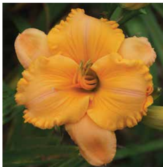
H. 'Pure and Simple' (Salter) Tet: 28", 5.5"; HM 2002, AM 2005