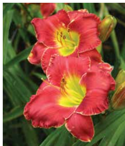
H. 'Radar Love' (Benz) Tet: 30", 5"; HM 2000