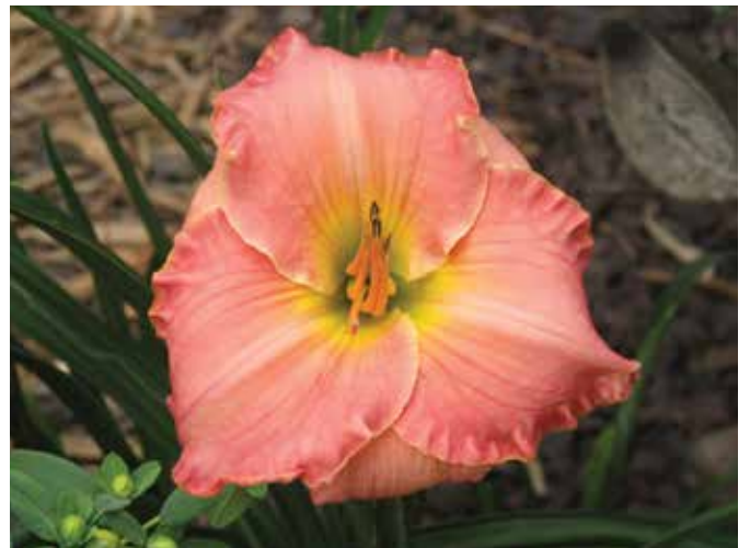
H. 'Seminole Wind' (Stamile) Tet: 23", 6.5"; HM 1998, AM 2001