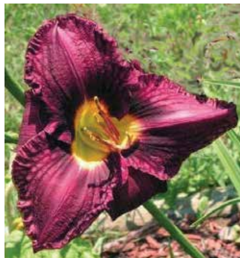
H. 'Caribbean Purple Spires' (Talbot) Tet: 29", 6"; HM 2001