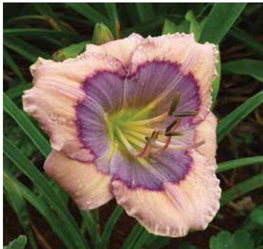
H. 'In the Navy' (E.H. Salter) Dip: 18", 3"; HM 2000