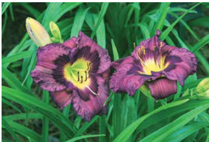
H. 'Marietta Dreamer' (Shooter) Dip: 23", 5"; HM 1999 (Photo by Claude Carpenter)