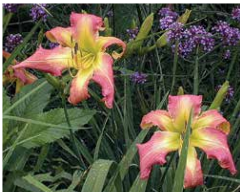
H. 'Apron Strings' (L. Ward) Dip: 22", 7.875"; HM 1999