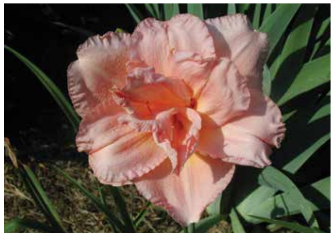
H. 'Peggy Bass' (Joiner) Dip: 26", 7" double; HM 1996