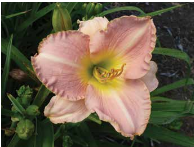
H. 'Uptown Girl' (Stamile) Tet: 27", 5"; HM 1998, ESF 2000