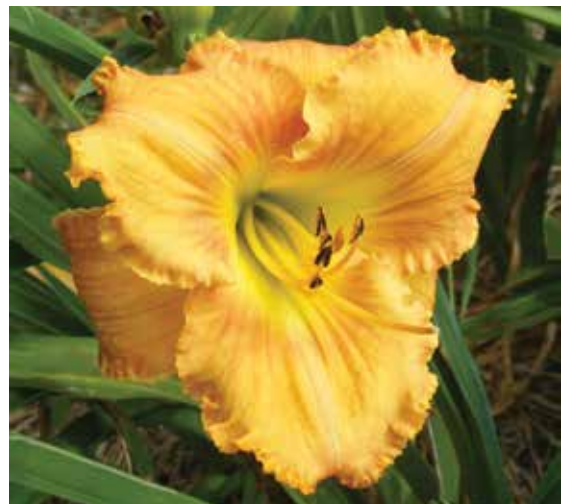
H. 'Texas Toffee' (B. Brooks) Tet: 21", 5.5"; HM 2000