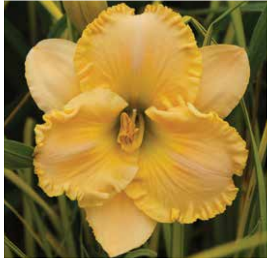
H. 'Collier' ( E.C. Brown ) Tet: 28", 6"; HM 1997