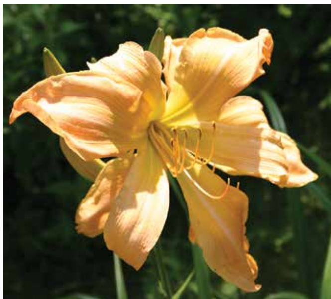
H. 'Persimmon' (Harris-Reinke) Dip: 40", 9"; No Awards