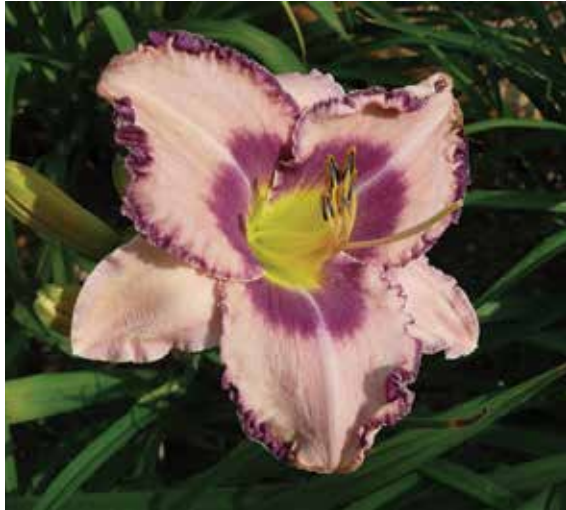
H. 'Royal Braid' (Stamile) Tet: 25", 5"; HM 1997