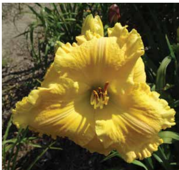
H. 'Majestic Move' (Santa Lucia) Tet: 28", 6"; HM 1998