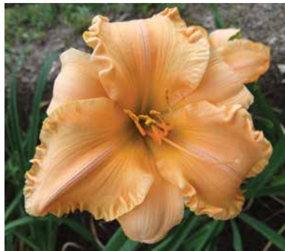
H. 'Awesome' (Kroll) Dip: 24", 6"; HM 1998