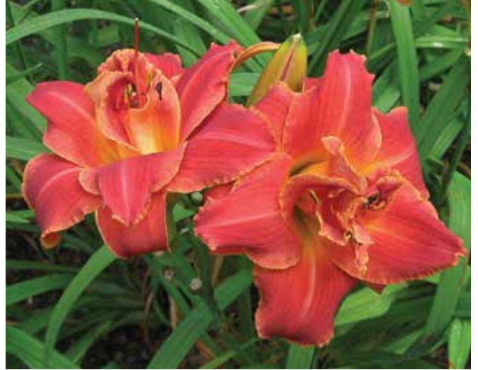
H. 'Scarlet Marie' (Kropf) Tet: 26", 6" double; HM 2009