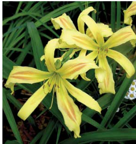
H. 'Lines of Splendor' (Temple) Dip: 25", 8.5" spider ratio 5.20:1; HM 2007