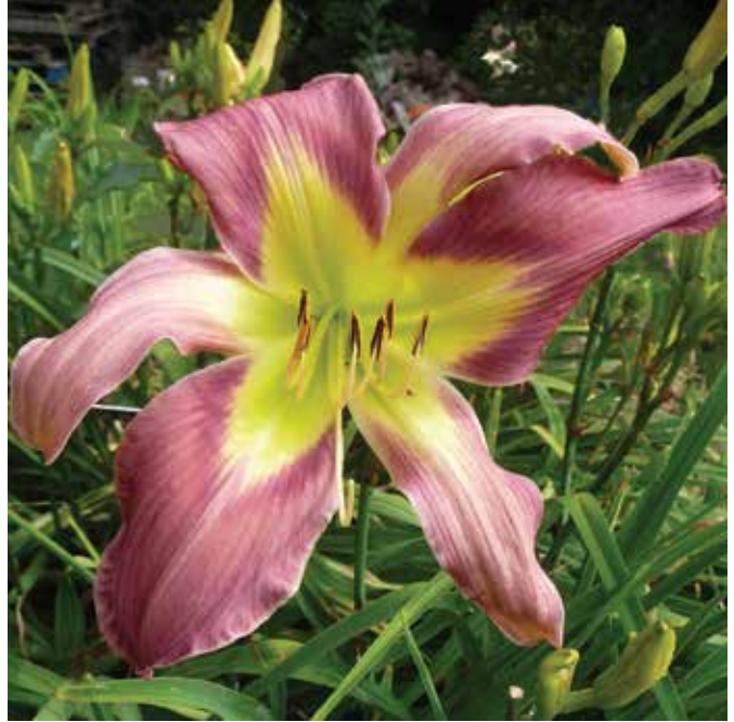
H. 'Victorian Ribbons' (Reinke) Dip: 40", 9"; HM 1999