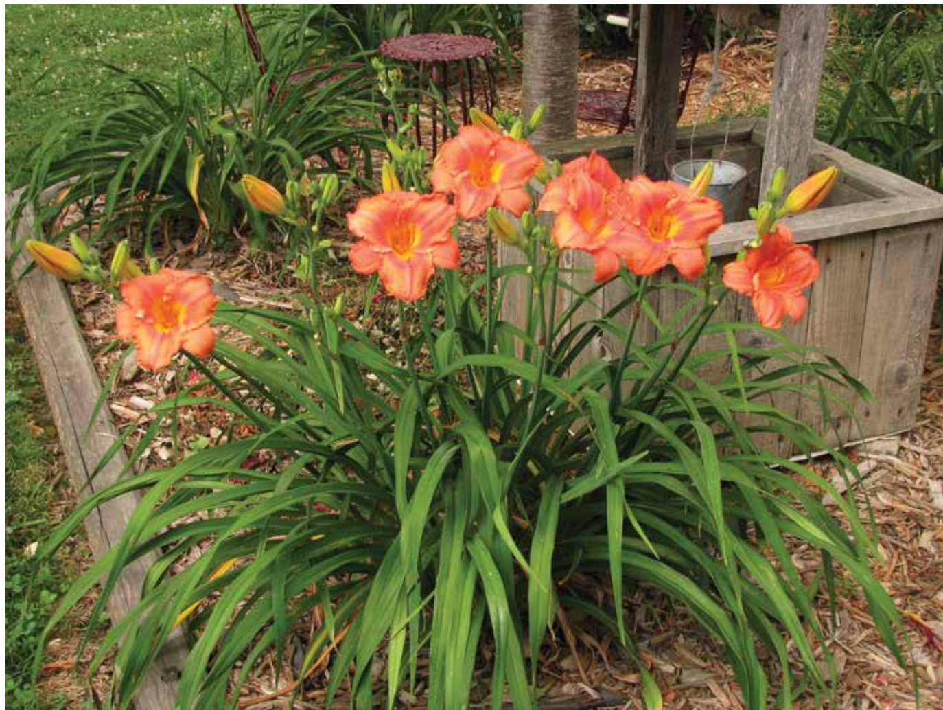
H. 'South Seas' (Moldovan)