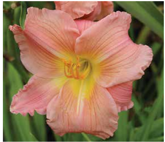
H. 'Seductive Fairy Tale' (L. Gates) Dip: 22", 6"; HM 1999