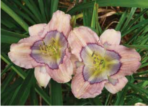
H. 'True Blue Heart' (E.H. Salter) Dip: 18", 3.75"; HM 2004