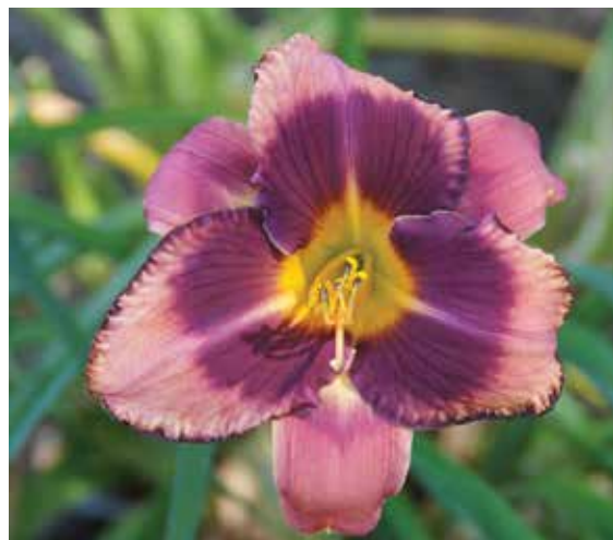
H. 'Mask of Time' (Salter) Tet: 26", 6"; HM 1997, AM 2000