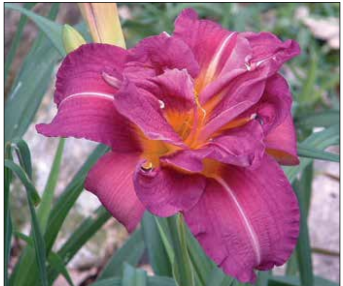
H. 'Double Blueberry Pie' ( Betty Brown 1984 )

Blueberry Pie' (1984), an 18", 5.5" lavender blue self with an orange gold throat, won an HM in 1989. 'Double Peach Charmer' (1985), a 23", 5" peach with a light rose eyezone and rose throat, won an HM in 1991. 'Double Ladybug Ra'