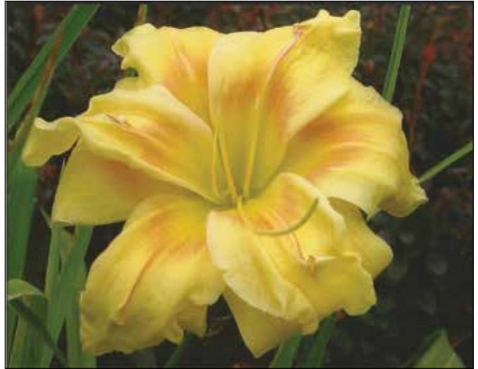
H. 'Double Pop Art' ( Betty Brown 1981 )

During the historical period of the 1970s and 1980s, Betty B. Brown of Orange, Texas, had great success in hybridizing diploid doubles. H. 'Double Overtime' (1981), a 19", 6" peach tan with a wine eyezone and green throat, won an HM in 1986. 'Whopper Stopper' (1981), a 24", 6" rose with a wine eyezone and chartreuse throat, won an HM in 1988. 'Double Tour Time' (1981), a 23", 6" peach self, won an HM in 1992. However, 'Double Pop Art' (1981), a 22", 5" double yellow with a light wine eyezone and a yellow throat, remains overlooked, as does 'Double Purple Thrill' (1981), a 15", 5.5" double deep purple self with a light gold throat. 'Double