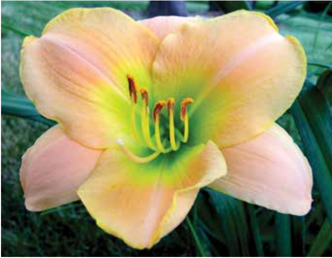
H. 'Classy Cast' ( B. Brooks ) Tet: 38", 5"; HM 1996