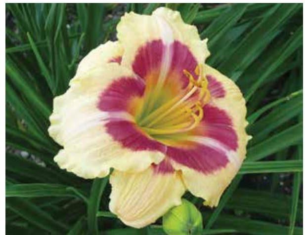
H. 'Broken Heart' (Kroll) Dip: 24", 4"; HM 2002, FS 2005