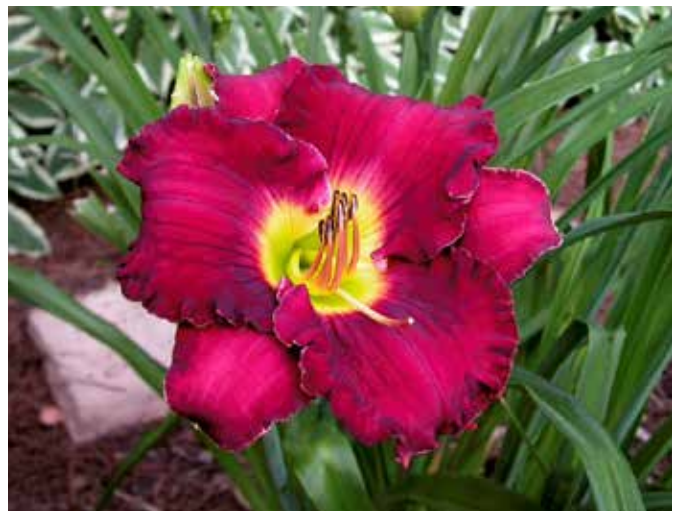
H. 'Taken by Storm' (Salter) Tet: 28", 6"; HM 2006