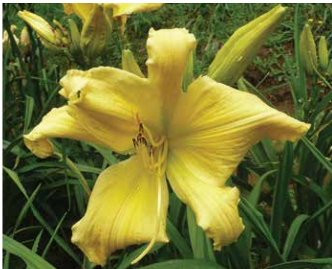
H. 'Green Eyed Monster' (L. Ward) Dip: 30", 8.5"; No Awards