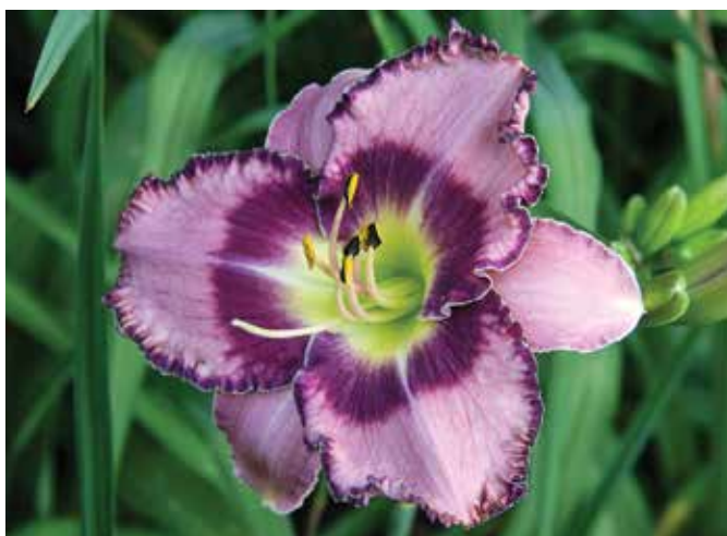
H. 'Druid's Chant' (Stamile) Tet: 23", 6.5"; HM 1997, AM 2002