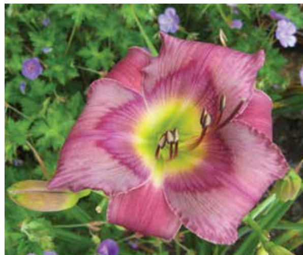
H. 'Priscilla's Dream' (Shooter) Dip: 27", 3.75"; HM 1996