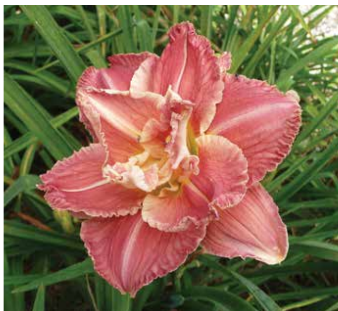
H. 'Totally Awesome' (S.G. Ward)

Dip: 28", 7" double; PC 1994, HM 1997, IM 2003