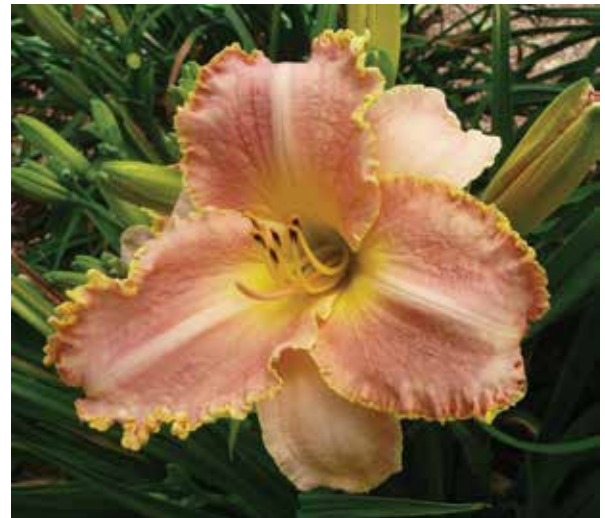
H. 'Golden Tear Drops' (Carr) Tet: 26", 5.5"; HM 2006