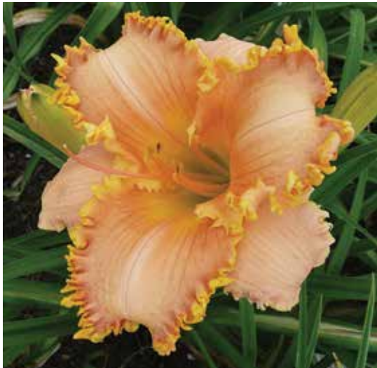
H. 'Forestlake Ragamuffin' (F. Harding) Tet: 28", 5.5"; HM 2005, AM 2009