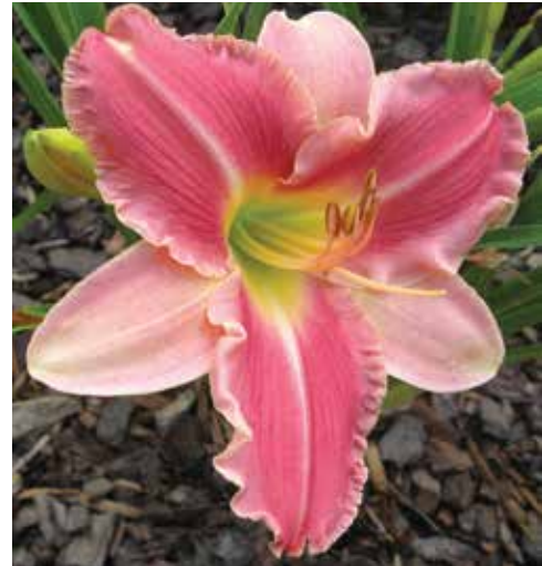
H. 'Border Crossing' (Dougherty) Dip: 24", 5.5"; HM 2000