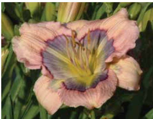
H. 'Navy Blues' (E.H. Salter) Dip: 16", 2.5"; HM 2001