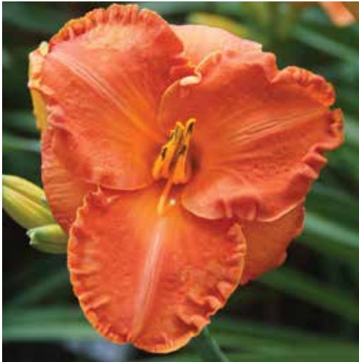
H. 'Bittersweet Destiny' (Salter) Tet: 24", 6"; HM 2003