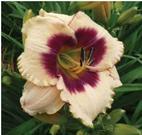
H. 'Blueberry Candy' (Stamile) Tet: 22", 4.25"; HM 1997