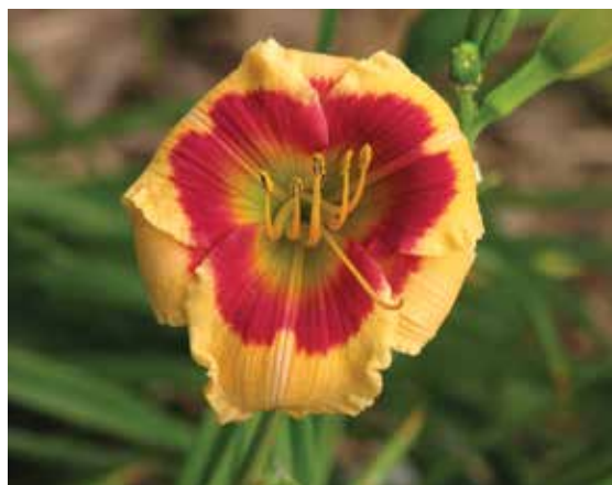
H. 'Hot Pepper' (Joiner) Dip: 20", 3.5"; HM 1999 (Photo by Vicki Goedde)