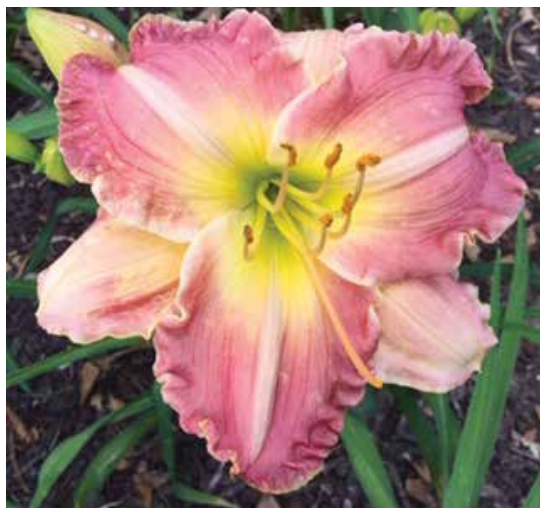
H. 'Joie De Vivre' (L. Gates) Dip: 22", 6"; HM 1998