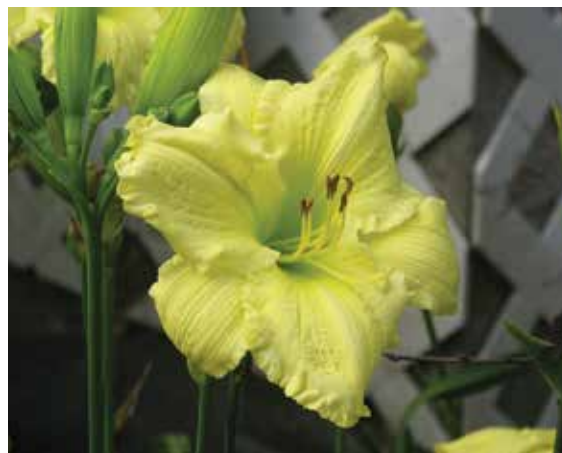
H. 'Megan's Love' (Shooter) Dip: 34", 6"; HM 1997