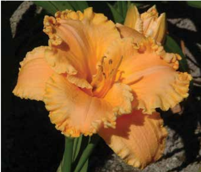
H. 'Yankee Tradition' (Santa Lucia) Tet: 28", 5"; HM 1998