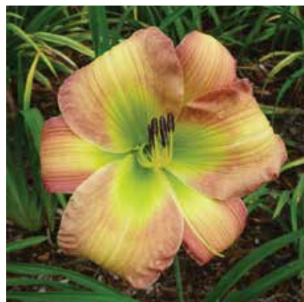
H. 'Wyatt's Cameo' (Lefever) Dip: 24", 5"; HM 1999