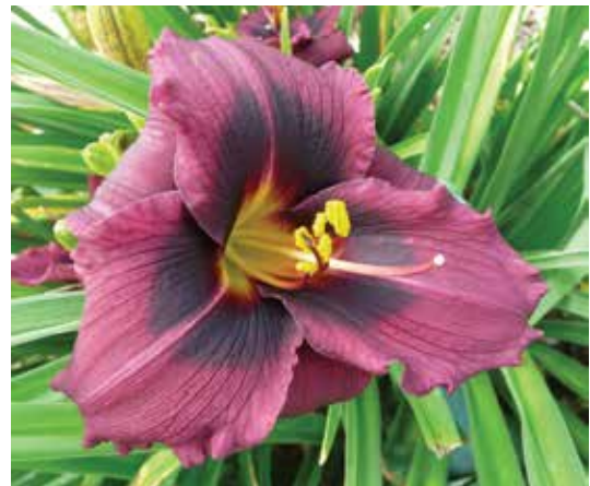
H. 'Night Dreams' (E. Shooter) Dip: 17", 3.5"; HM 2000