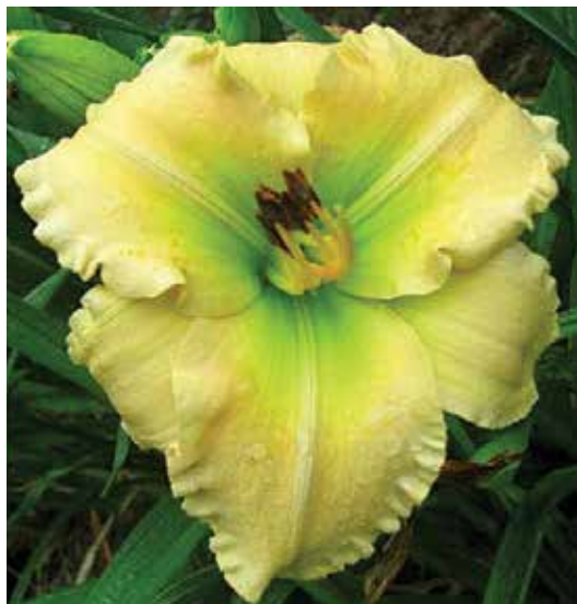
H. 'Almost All Green' (H. Herrington) Dip: 30", 3.8"; HM 2007