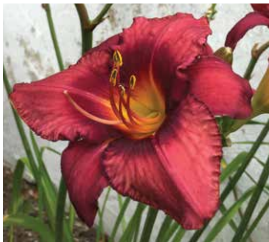
H. 'Katahdin' (Valente) Tet: 42", 5"; HM 2001