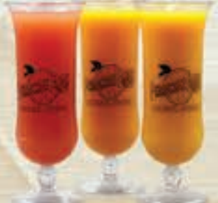
BUY THE HURRICANE - KEEP THE GLASS