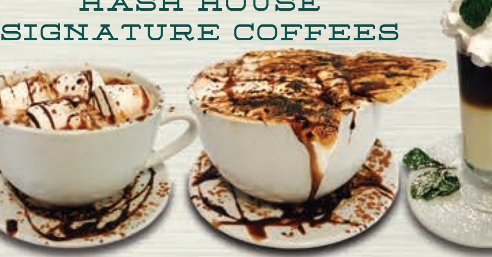
CAMPFIRE SMORES MOCHA 12.50