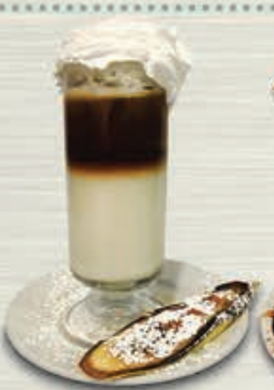
BANANA LATTE 10.50