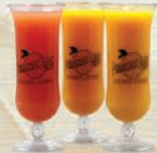
BUY THE HURRICANE - KEEP THE GLASS