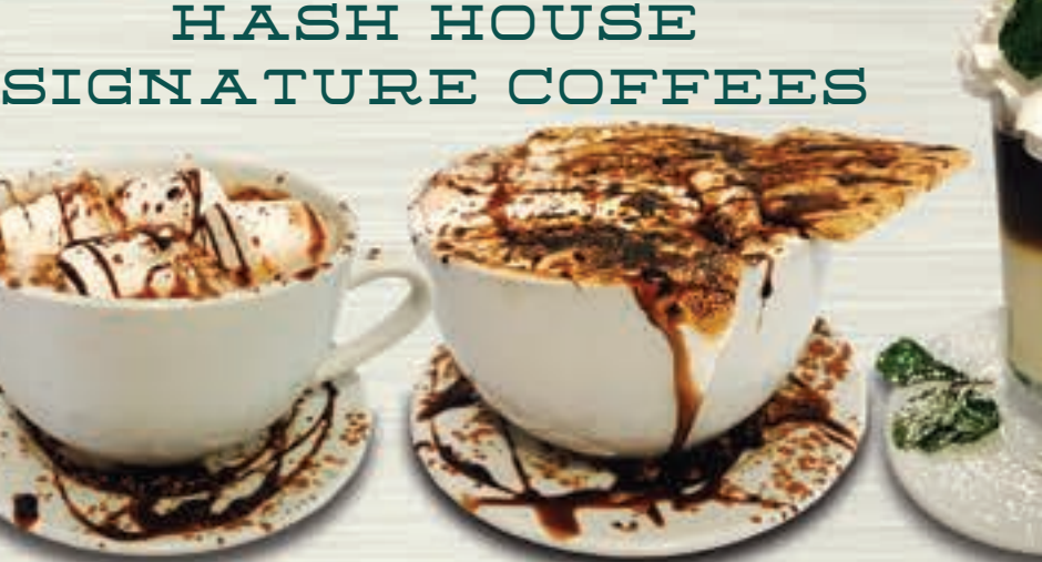
CAMPFIRE SMORES MOCHA 12.50