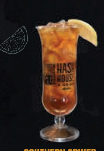
SOUTHERN SPIKED PEACH TEA