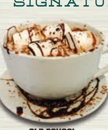
OLD SCHOOL HOT CHOCOLATE 10.50