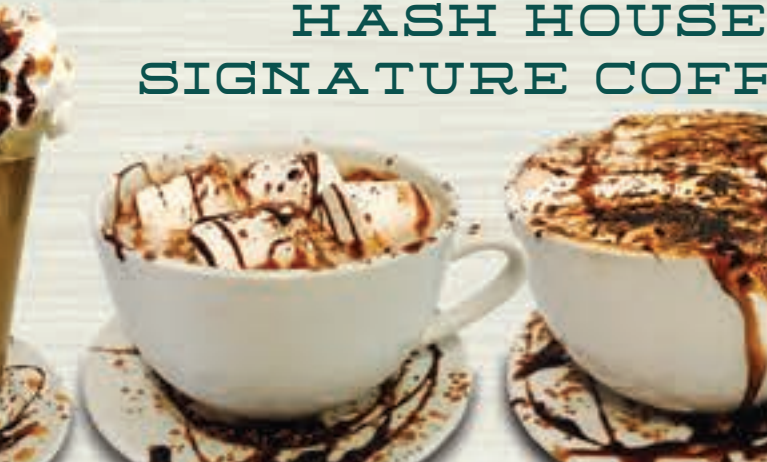
HOT CHOCOLATE 10.50