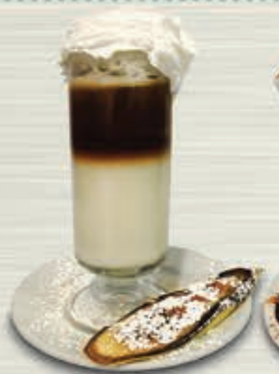
BANANA LATTE 10.50