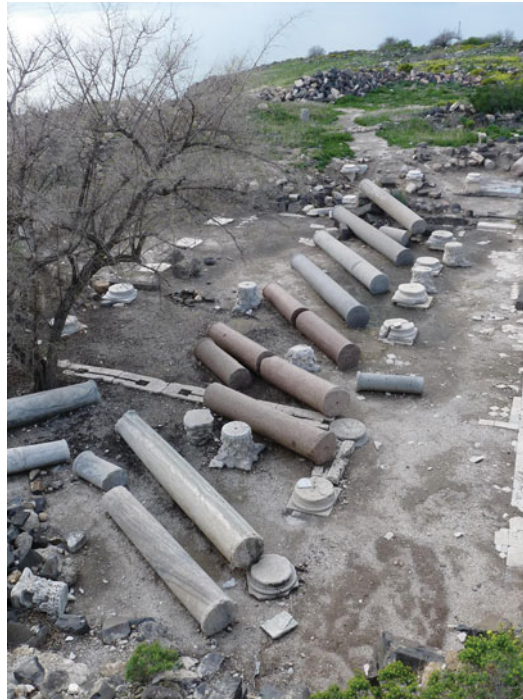
Fig. 8 Perfectly aligned toppled columns at Susita (Golan Heights), classically interpreted as indicative for the direction of strong ground motion caused by a major earthquake. Such earthquake hypothesis does not pass the test of scenario-based ground motion simulations (cf. Hinzen et al. 2011)

sources and focuses on well-documented, high-visibility archaeological contexts, characterized by very rapid ceramic change (~100-year time window) (cf. Jusseret and Sintubin 2012).