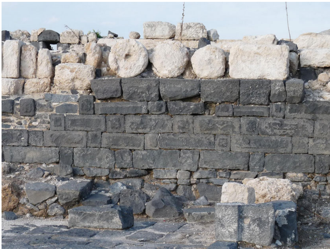
Fig. 5 Recycling of building material in repair works of a wall at Susita (Golan Heights) (cf. Sintubin 2011), possibly after a destructive earthquake

Other issues concerning destruction horizons are preservation and disturbance. Little is known about the way ancient societies coped with the aftermath of a major earthquake. Earthquake debris may have been cleared from streets and buildings and disposed at particular dumpsites, so that the earthquake destruction horizon is no longer preserved in the archaeological record. Valuables and/or victims may have been recovered from the debris, while material may have been reused in rebuilding, leaving behind a highly disturbed earthquake destruction horizon. It is therefore fair to conclude that the visibility of earthquake destruction in the archaeological stratigraphy is rather dependent on social factors than on physical parameters (cf. Jusseret and Sintubin 2012).