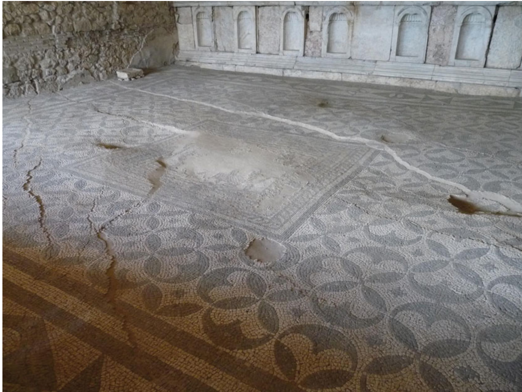
Fig. 3 The mosaic floor of the Roman Neon Library at Sagalassos (SW Turkey) has been cut by a normal fault, of which a post-363 AD activity (terminus post quem) can be inferred based on the archaeological evidence (cf. Similox-Tohon et al. 2006)

structures, aqueducts are ideal cultural piercing features because chances are they cross more than one fault. Also in extensional settings, giving rise to the typical seismic landscapes of the Mediterranean (from Turkey to Spain), faulted relics are often encountered in archaeological sites (Fig. 3) (e.g., Similox-Tohon et al. 2006). In these cases of dip-slip, normal-fault movements, particular caution should be paid to preclude gravitational mass movement that may or may not be seismically triggered (ground failure). Complementary and independent, usually paleoseismological and/or geophysical, evidence to support a tectonic nature of the normal displacement, observed in the faulted relics, is therefore imperative (e.g., Similox-Tohon et al. 2005).