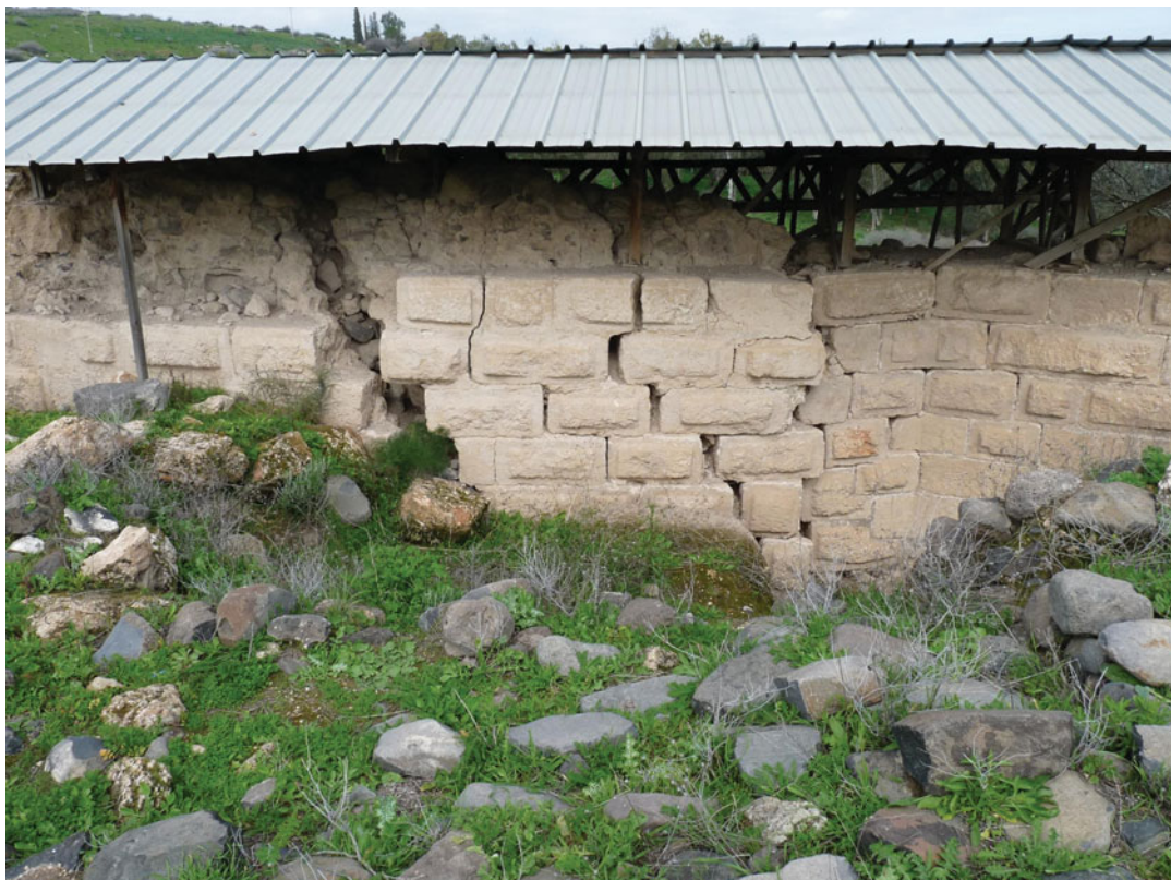
Fig. 2 The wall of the Crusader Fortress of Vadum Iacob (Ateret, Israel) (cf. Marco et al. 1997) is displaced left laterally over more than 2 m. The fortress has been built astride the Dead Sea transform plate boundary between the African and Arabian plates

The most spectacular cases of such faulted relics can be found astride strike-slip faults, in which case there can be no doubt of the tectonic nature of the displacement. Notorious examples are the Crusader Fortress of Vadum Iacob (Israel) (Fig. 2) (cf. Marco et al. 1997) and the Al Harif Roman aqueduct (Syria) (cf. Sbeinati et al. 2010), both located astride the Dead Sea fault, a left-lateral transform plate boundary between the African and Arabian plates. By the way, as long, linear