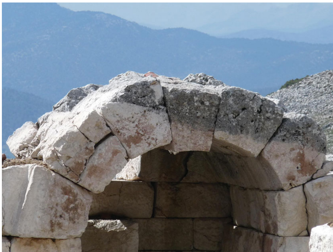
Fig. 7 A dropped keystone in the Roman Baths at Sagalassos (SW Turkey), interpreted as a potential earthquake archaeological effect (cf. Similox-Tohon et al. 2006)

typologies, possibly indicative of ground shaking, the investigator has to be very cautious not to “overinterpret” the potential earthquake archaeological effects. Uncertainties, inherent to any archaeologically based earthquake hypothesis, should moreover be assessed properly (cf. Sintubin and Stewart 2008).