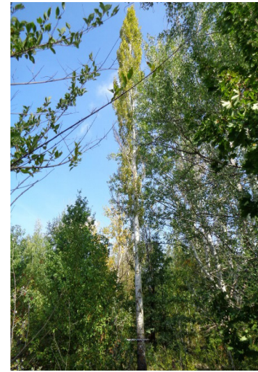
Figure 3 Poplar 'Bolid', which was obtained by A.P. Tsarev from crossing P. alba × P. bolleana . Winter-hardy hybrid with pyramidal crown. The age of tree is 38 years, height is 26 m, diameter 32.2 cm, volume 0.83 m 3 . Voronezh region, Semiluksky collection of A.P. Tsarev hybrids, August 2015.