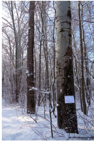
Figure 2 Hybrid poplar 'Veresin-1', which was obtained by M.M. Veresin from crossing P. alba × P. tremula . The age of the trees is 63 years. In the marked tree the height is 40 m, diameter 69.7 cm, volume 5.95 m 3 . Voronezh, collection No 1, January 2016.