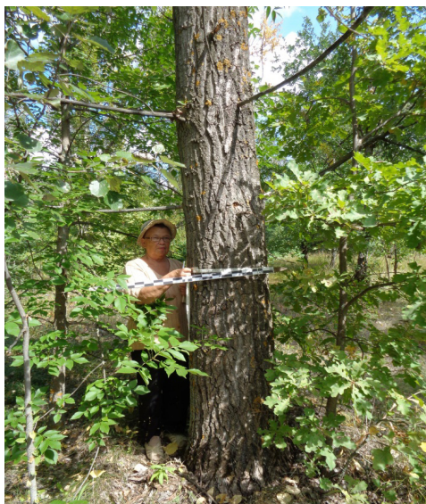
Figure 4 Poplar 'Surprise', which was received by R.P. Tsareva as half-sib of 'I-455' poplar. The age of the tree is 32 years, height 21.5 m, diameter 43.5 cm, volume 1.25 m 3 , Voronezh region, Semiluksky collection of R.P. Tsareva hybrids, August 2015.

volume of 0.43 m 3 the mean family stem volume by 139 % at that age. The clone of Italian cultivar 'I-455' wasn't frost-resistant and was lost after its introduction to the Voronezh region. But before this, it gave some seeds from which one tree was found to be frost resistant and fast growing. It was named 'Surprise'. At age 14 years its stem volume was 0.41 m 3 (Table 3) and at age 32 years it was 1.25 m 3 (Table 4, Figure 4).