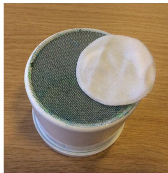
Figure 1 The maintenance of Culicoides in plastic trapping containers. Cotton wool embedded with a 10% sucrose solution was placed on top of the gauze lids for sustenance. The same trapping pots were used for self-marking Culicoides with the fluorescent dusts in the field.

In July 2010 the use of Brilliant General Pigment (BGP, Brilliant Group, Inc., San Francisco, USA) micronized fluorescent dusts in marking Culicoides for dispersal studies was investigated using a series of 11 laboratory studies falling under three areas of interest; 1) dust properties; 2) effect of dust on Culicoides ; and 3) dust application. Culicoides were collected at the University of Liverpool's Leahurst Campus using an Onderstepoort-type down-draught black light trap placed at 2 m in height, and were stored in plastic trapping containers with a gauze bottom with a 10% sucrose solution embedded in cotton wool for sustenance (Figure 1). During the following experiments, midges were incapacitated on a cold plate set to -15^{\circ}\text{C} for 15 seconds to allow for the