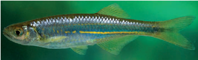
Figure 1: Aranayake Devario.

The invertebrates recorded include, one species of jellyfish ( Carybdea wayamba ) 13 ; one species of grasshopper ( Cladonotus bhaskari from Sinharaja) 14 ;