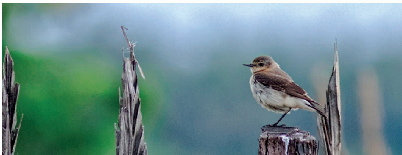
Figure 6: Northern wheatear.

The most recent update on the biodiversity of Sri Lanka was carried out during the preparation of the 6th National Report of the Convention on Biological Diversity which resulted in the compilation of the biodiversity profile 40 of Sri Lanka. This report provided an updated list of species up to the end of December 2018. However, updating the biodiversity inventory should be a continuous process as evidenced by the discovery of 54 new species from Sri Lanka in 2019 41, 42 . This included 26 spiders, (14 cellar spiders, seven jumping spiders, four crab spiders and a tarantula), one scorpion species, five mites and ticks, 14 reptiles (13 day geckos belonging to genus Cnemaspis and one species of snake), one species of shrub frog, one species of orchid and six species of lichens. The table below (Table 1) provides the updated statistics on selected taxa of biodiversity of Sri Lanka up to December 2020 including the new discoveries that were reported in 2020.