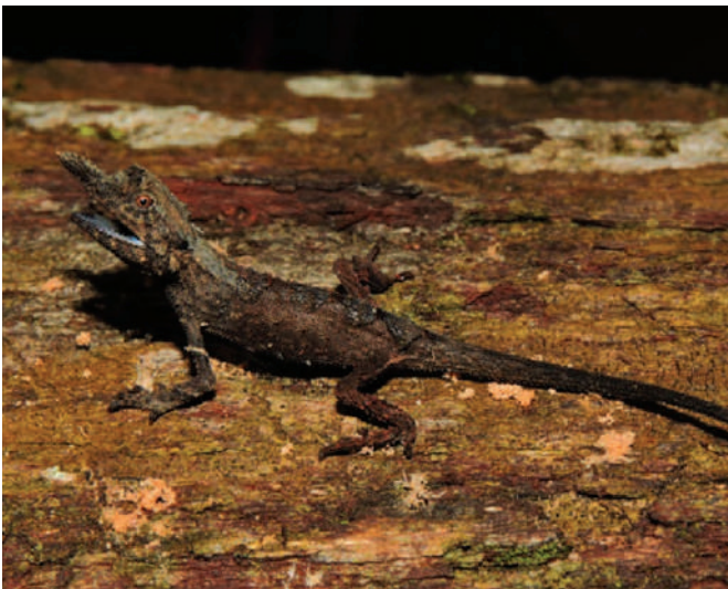
Figure 2: Ukuwela's rough-horn lizard.

one species of scorpion ( Srilankametrus pococki from Ritigala) 15 ; one species of mayfly ( Indoganodes tschertoprudi from Marathenna) 16 ; two species of stalk-eyed flies ( Teleopsis neglecta from Pundaluoya and Teleopsis sorora from Udawattakale) 17 ; four species of water mites [ Piona srilankana , Neumania edytae , Krendowskia (Krendowskiella) srilankana , Mideopsis ewelinae ] 18 ; five species of beetles [( Clidicus minilankanus from Salgala) 19 , ( Neoserica dharmapriyai from Aranayake, Selaserica athukoralai and Maladera galdaththana from the Knuckles Range, Maladera cervicornis from Alic Land Estate, Kegalle) 20 ]; two species of Pholcid spiders ( Wanniyala badulla and Wanniyala batatota ) 21 ; seven new species of jumping spiders ( Habrocestum liptoni , Stenaelurillus ilesai and Tamigalesus fabus ) 22 , ( Synagelides hortonensis , Synagelides lakmalii , Synagelides rosalingae and Synagelides orlando ) where the genus Synagelides was recorded for the first time in Sri Lanka 23 .