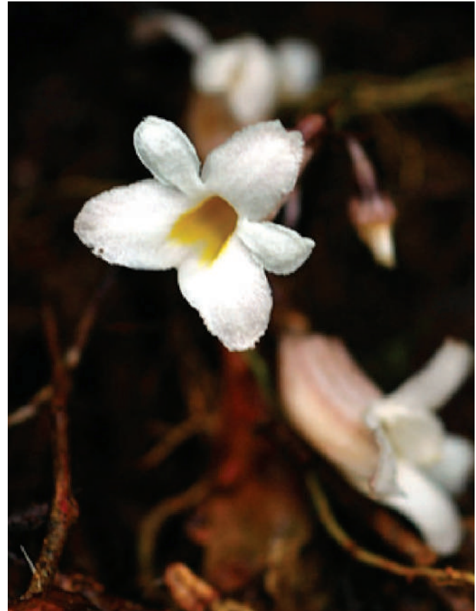
Figure 4: Orchid species Gastrodia gunatillekeorum . (Pic by: Imaduwa Priyadarshana).

Among the new species described invertebrates outnumber vertebrates which is a healthy development as local taxonomists place a greater emphasis on