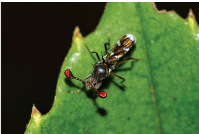
Figure 3: Stalk-eyed fly.

During the year 2020, many new records for Sri Lanka have been documented including five species of birds [European honey buzzard Pernis apivorus 26 red-backed shrike Lanius collurio , black-browed reed-warbler Acrocephalus bistrigiceps , red-naped ibis Pseudibis papillosa , northern wheatear Oenanthe oenanthe (Figure 6) 27,28 ], two species of ants ( Liponera longitarsus 29 and Tetraoponera modesta 30 ), three species of elasmobranch fish ( Maculabatis arabica , Acroteriobatus variegatus , and Centroscymnus owstonii 25 ), three species of jellyfish 13