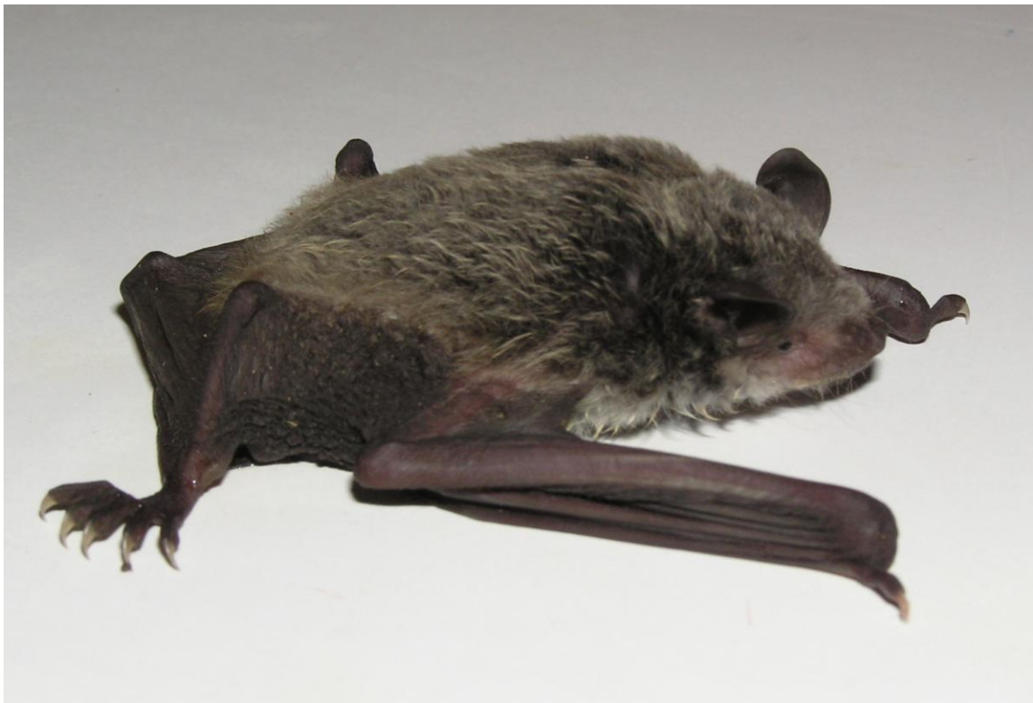
Fig. 1. Dorso-lateral view of Myotis horsfieldii (ZRC 4.8147) in crouching position.

Observation: A colony of these bats was found inside a drain culvert by the reservoir during a faunal survey. A mist net was placed at the entrance of the culvert before dusk. Bats began to emerge as the sun was setting and about ten individuals were caught in the net. Except for a female of fore-arm length 35.8 mm which was collected as a voucher specimen (attached picture shows it in life), the other bats were released. They flew out over the reservoir.