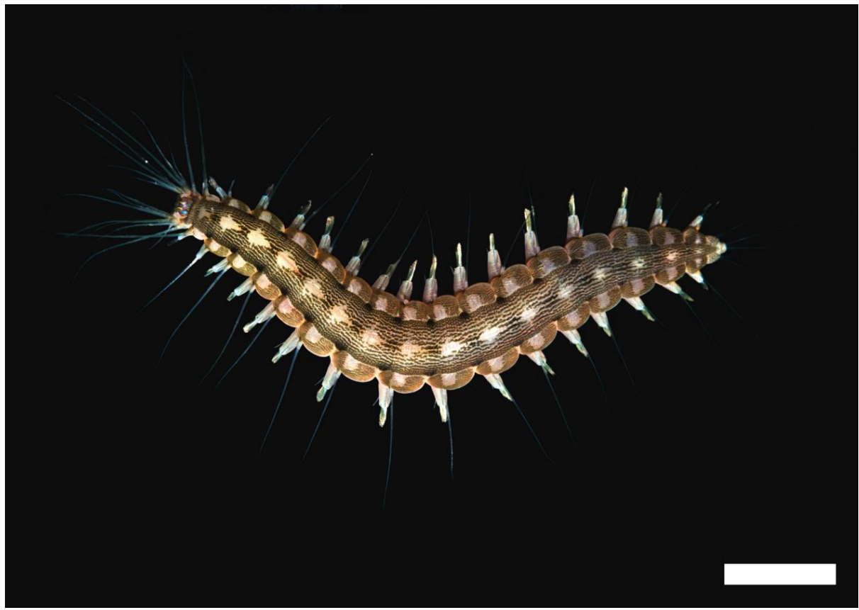
Fig. 3. A live example of Hesione intertexta from Lazarus Island. Scale bar = 10 mm.