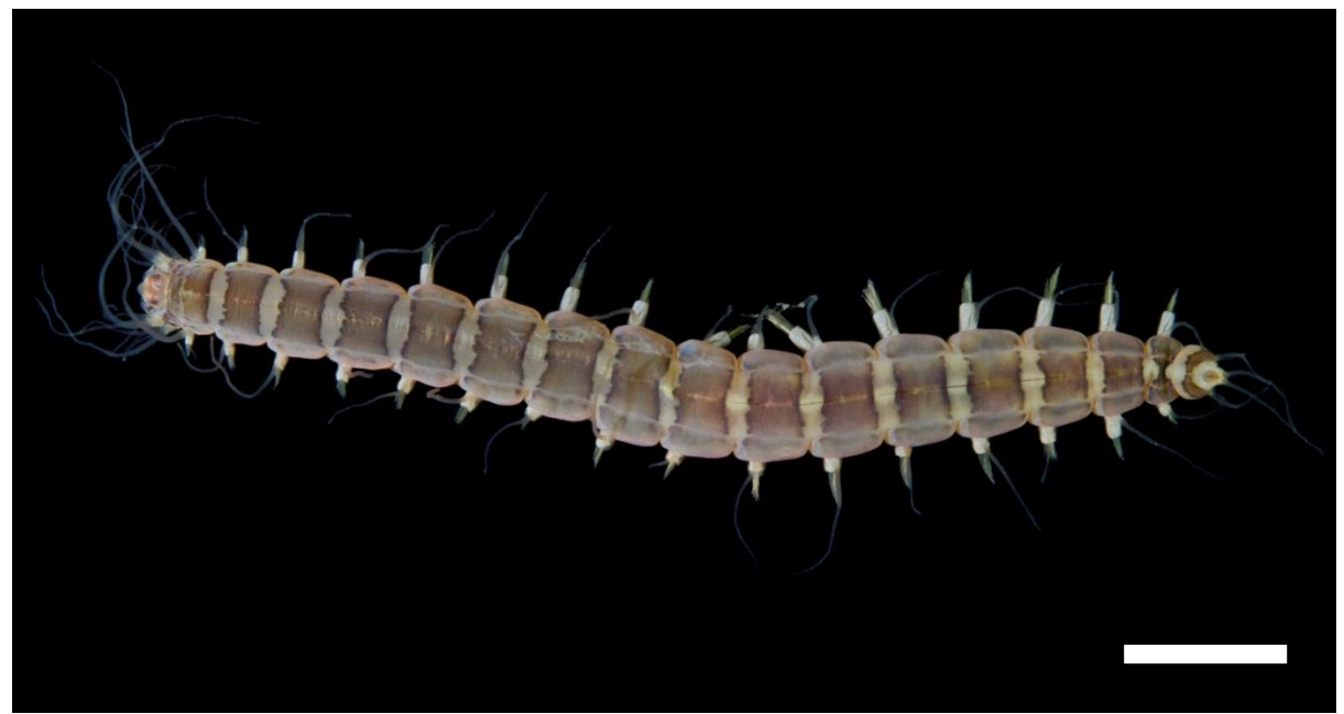
Fig. 1. Live example of Hesione cf. picta (ZRC.ANN.0106), dorsal view. Scale bar = 5 mm.