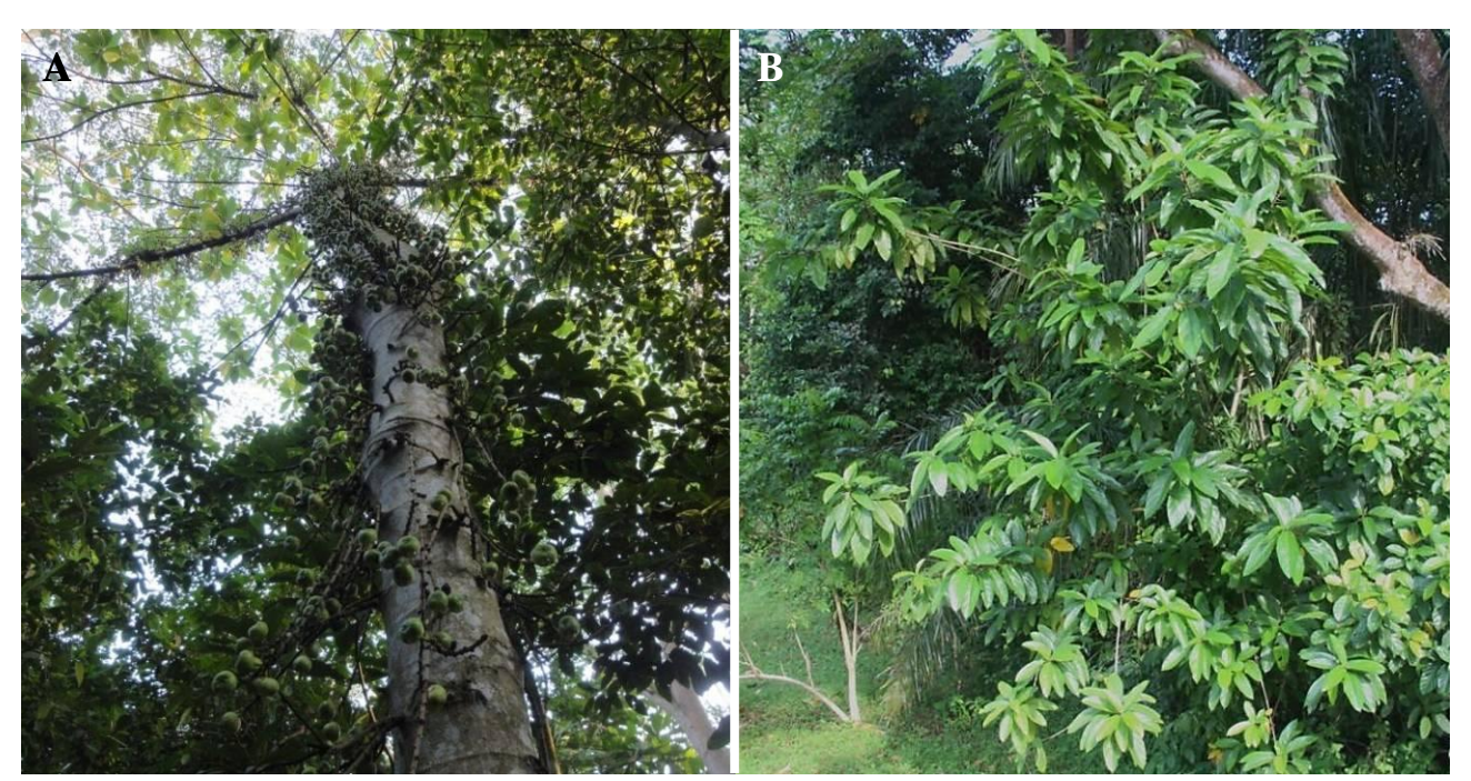
Fig. 1. Ficus hispida individuals at the edge of Bukit Timah Nature Reserve: A, tree; B, shrub.

Ficus hispida is a dioecious species with each individual producing either female syconia that contain female flowers that may develop into single-seeded fruits, or male syconia that contain pollen-bearing and gall flowers. The single or paired syconia are often observed on long, leafless, clustered shoots from the trunk (Fig 3A), even though some syconia