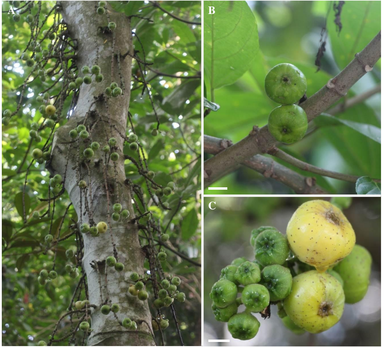
Fig. 3. Syconia: A, on long, leafless, clustered shoots from the trunk; B, on leafy branches; C, a cluster of syconia of different ripeness on the same branch. Scale bars = 1 cm.

female wasps from differentiating between the male or female syconia, so almost half of each batch of fig wasps will enter the female syconia for pollination (Patel et al., 1995; Patel & Hossaert-McKey, 2000; Yang et al., 2002), thus sustaining the fecundity of their host tree. Upon pollination or egg-laying by the fig wasps, the syconia will undergo chemical changes that will make them less attractive to the fig wasps (Song et al., 2001; Hu et al., 2009). The length of time a syconium remains attractive is therefore affected by the number of female wasps that enters it (Hu et al., 2009).