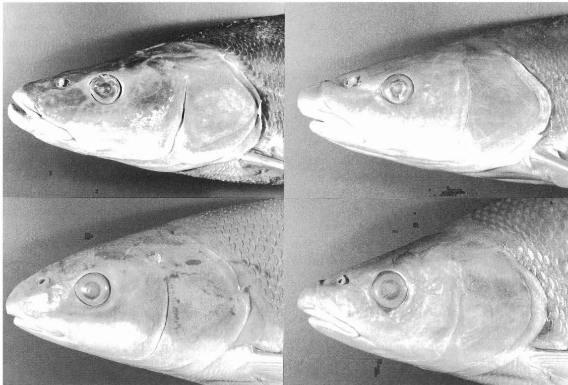
Fig. 3. Tribolodon heads. Left top, T. nakamurai , NSMT-P 19584, holotype, 382.2 mm SL; left bottom, T. brandii , NSMT-P (SK) 3293, 342.7 mm SL; right top, T. ezoe , NSMT-P 14643, 279.0 mm SL; right bottom, T. hakonensis , NSMT-P 52625, 329.5 mm SL.