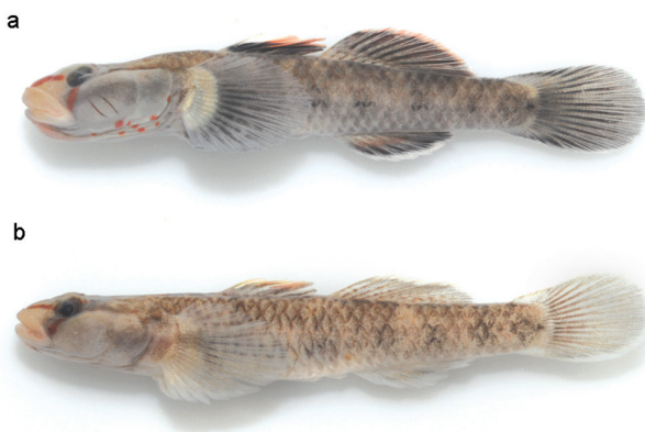
Fig. 1. Rhinogobius rubrolineatus , new species: a, male, holotype, 33.7 mm SL; b, female, paratype, 42.3 mm SL, Wen-chuan-shi, Minjiang basin, People's Republic of China.