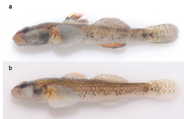
Fig. 3. Rhinogobius sagittus , new species: a, male, holotype, 35.1 mm SL; b, female, paratype, 35.4 mm SL, Nan-shi, Minjiang basin, People's Republic of China.

Fins. – D1 VI, D2 I/8; A I/7; P 16–17 (usually 16); V I/5+I/5 (distribution frequency in Table 2). D1 3rd and 4th spinous rays longest, with rear tip extending near origin of D2 when depressed in male; not extending beyond origin of D2 when depressed in female. Origin of A inserted below origin of 2nd branched ray of D2. The rear tips of D2 and A rays when depressed fall well short of procurrent rays of C. P moderate large and oblong, its rear tip extending as far as vertical line through anus in male, never reaching this vertical in female. V rounded, spinous rays with somewhat pointed membrane lobe. C elliptical, rear edge rounded.