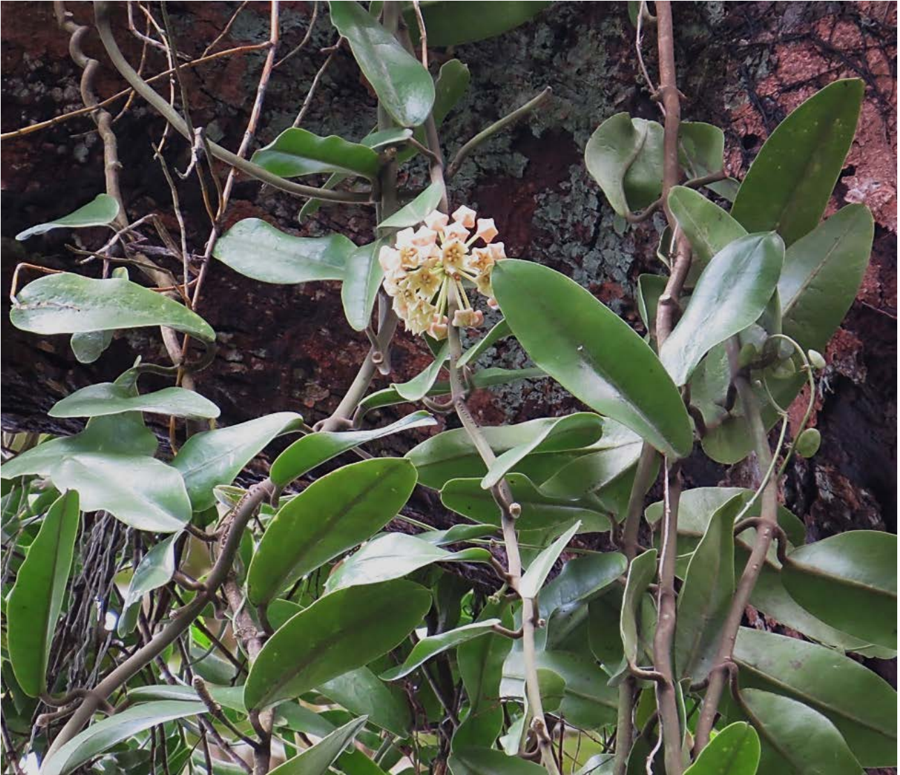
Fig. 2. Inflorescence of Hoya obtusifolia growing on a durian tree in Pulau Ubin starting to bloom.

5 mm in diameter, sparsely pubescent, rachis bearing scars of previous flowerings, up to 9 mm in diameter; pedicels 2–3 cm long, 2–2.5 mm in diameter, sparsely pubescent. Calyx 10–12 mm in diameter, lobes triangular 3–5 × 2–2.5 mm, apex round, outside pubescent, pale yellow with red markings at the edge, inside glabrous, pale yellow with red markings at the edge, ciliate. Calycine colleter missing. Corolla succulent, rotate, ca. 2 cm in diameter (2.5–3 cm when flattened), glabrous, outside white to pale yellow, with a pale pink patch in between the calyx lobes, inside basally purple-pink, progressively fading into pale cream; tube 3.5–5 mm long; lobes triangular, 9–11 × 9–11 mm, apex acute. Staminal corona 8–9 mm in diameter, 4–5 mm high, corona lobes obovate, 3.5–5 × 2–2.2 mm, slightly convex above, sulcate underneath, outer process greenish white, apex obtuse, raised, inner process white, raised with an acuminate tip, incurved over the style head. Style head conical ca. 2 mm in diameter, style head apex acuminate ca. 2 mm long. Pollinarium erect, pollinia, oblong 950–1050 × 300–350 µm, apex and base rounded, corpusculum rhomboid 350–450 × 200–250 µm, caudicles, ca. 250 µm long. Anther appendages membranaceous, hyaline, apically round, ca. 1.5 × 1 mm. Ovary conical, 1.8–2 mm long, ca. 1 mm in basal diameter. Fruit a single follicle, fusiform, ca. 12.5 × 2 cm base with pedicel laterally attached, apex acute, recurved, seeds 3–3.5 × 1–1.2 mm, long comose.