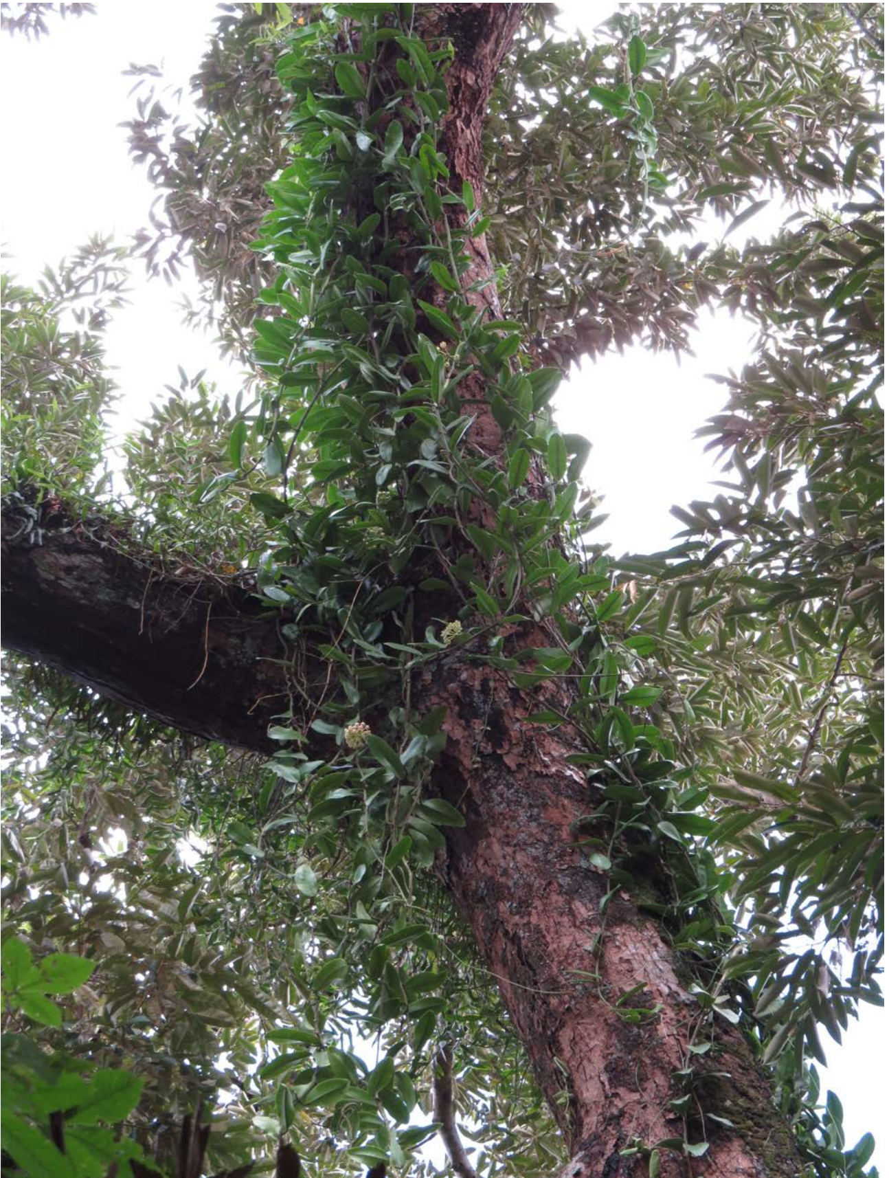
Fig. 1. Large specimen of Hoya obtusifolia growing on a durian tree in Pulau Ubin starting to bloom.

midrib, papillose with pubescent midrib when young, apex obtuse to acute apiculate or cuspidate, base round or very shallowly cordate, midrib raised on adaxial surface, secondary veins 4–10 on each side, branching at ca. 70° from midrib. Colleter one at each lamina base, ovate ca. 0.2 × 0.1 mm, pale brown, often visible on immature leaves only. Inflorescences positively geotropic, bearing 8–15(–30) flowers; peduncle extra-axillary, persistent, 20–50 mm long, 2.5–