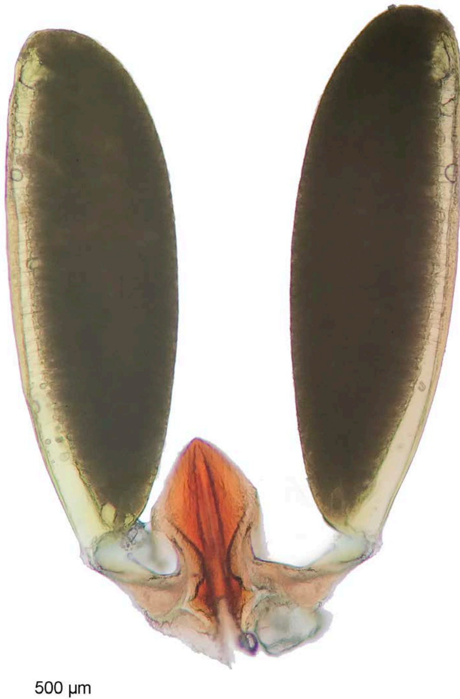
Fig. 4. Hoya obtusifolia . Pollinarium.