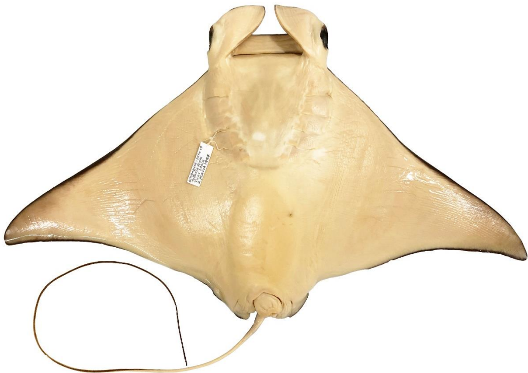
Fig. 2. Ethanol-preserved newborn Mobula kuhlii (ZRC 37454) of 39 cm disc width. Dorsal (top) and ventral (bottom) views.