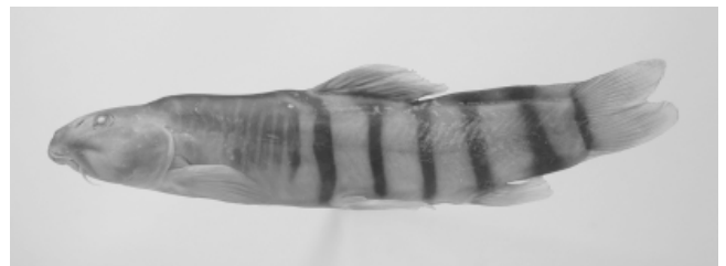
Fig. 1. Schistura disparizona , SWFC 0203035, holotype, 78.0 mm SL.

Diagnosis. – Schistura disparizona is distinguished from all other species of the genus in Southeast Asia by the unique combination of the following characters: conspicuous dorsal and ventral adipose keels on caudal peduncle; 9½ branched dorsal-fin rays; 8-11 very narrow, closely-set, dark bars in anterior part of body and 5 wider bars posteriorly.