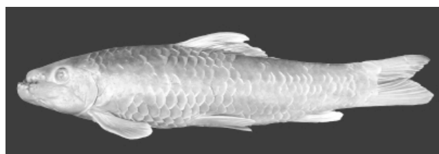
Fig. 1. Garra bispinosa , IHB 78IV1537, holotype, 121.0 mm SL; China: Yunnan: Yingjiang. Lateral view.

Diagnosis. – Garra bispinosa can be distinguished from all other congeners in Southeast Asia and China by having a conspicuous, quadrate and forwards pointed proboscis reflected downwards against the snout and anteriorly bilobed with one large, uniscupid and acanthoid tubercle on the distal end of each lobe, and a combination of the following characters: snout with a deep groove across its tip to form a transverse lobe; 34-35 lateral line scales; 16 circumpeduncular scales; a small mental disc (length 38.1-43.8 % HL); an anterior position of anus (anus to anal distance 25.9-30.6 % of pelvic to anal distance); a slightly pointed snout.