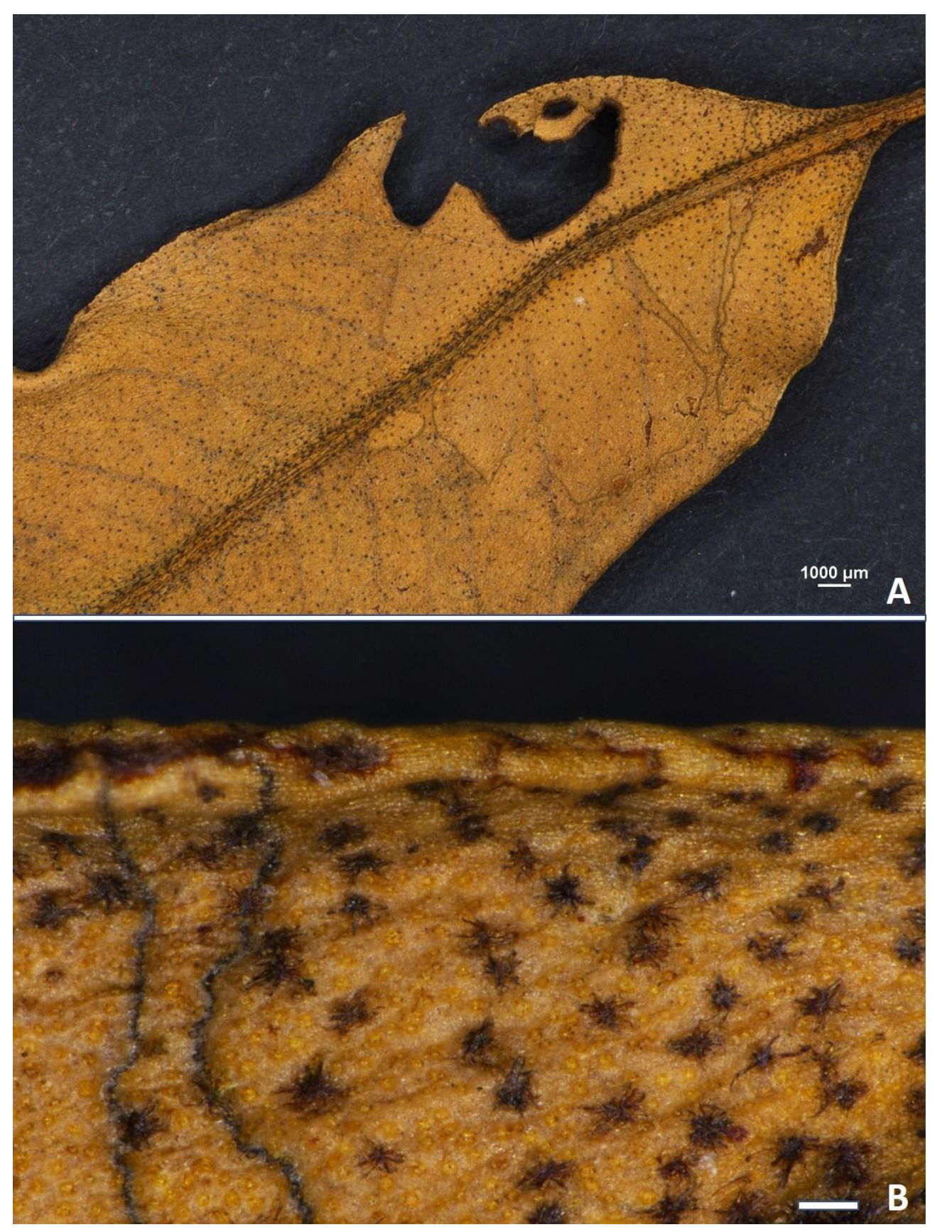
Fig. 2. Aglaia multinervis . A, underside of the leaflet; B, characteristic scales of Aglaia multinervis , scale bar = 0.1 mm.