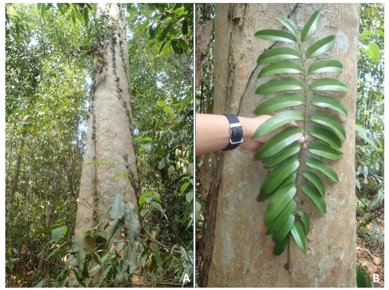
Fig. 4. Another Aglaia multinervis individual at Chestnut Peninsula, Butterfly Trail, Central Catchment Nature Reserve, Singapore. A, trunk; B, leaf and bark (SING 2019-879).

In September 2020, a tree was observed by the authors to be fruiting in close proximity to the HSBC TreeTop Walk in MacRitchie (Fig. 1). The tree was estimated to be about 20 m tall with a girth of 1.5 m in a forest patch consisting of a mixture of primary and mature secondary species. Fallen leaves and dried fruits were collected and identified as Aglaia multinervis by P. K. F. Leong. It was subsequently confirmed to be Aglaia multinervis by C. M. Pannell based on the characteristic peltate scales and venation. However, no young saplings or seedlings were observed in the vicinity of the tree, other than some fallen dried fruits. It should be noted that this particular individual has a unique kink in its trunk, which could be due to a breakage in its main stem resulting in a secondary side shoot taking over the main leading stem (Fig. 1D).