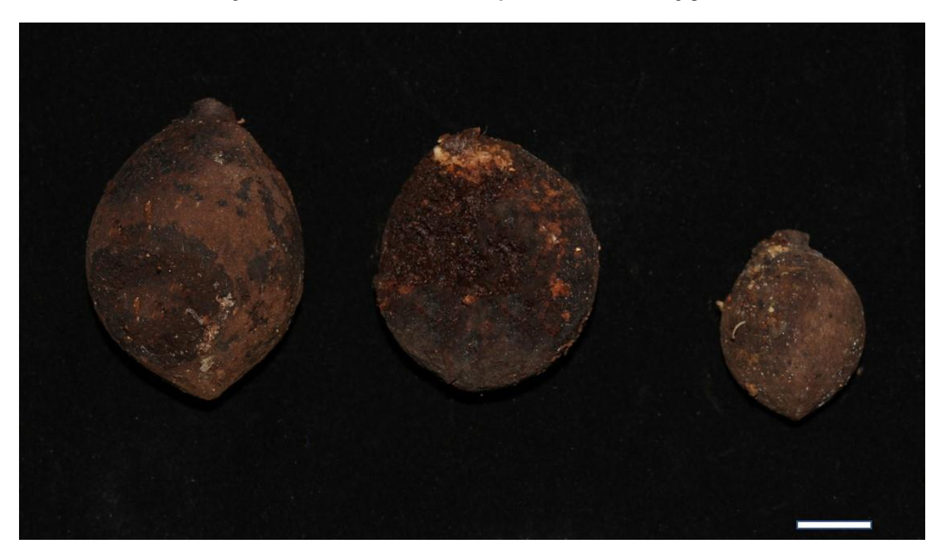
Fig. 3. Fallen fruits of Aglaia multinervis , scale bar = 1 cm.

However, in 2008, Aglaia multinervis was recorded in The Singapore Red Data Book as nationally extinct (Tan et al., 2008). This was most likely because early specimens of this species, collected since 1941 and deposited in the Singapore Botanic Gardens Herbarium (SING), had been misidentified as Aglaia malaccensis . Following the Red Data Book assessment, Aglaia multinervis was listed in a checklist of the total vascular plant flora of Singapore as extinct (Chong et al., 2009). Aglaia multinervis has 15–25 leaflets with at least 20–25 pairs of lateral veins on each side of its midrib and indumentum of peltate scales with a fimbriate margin, whereas Aglaia malaccensis has 11–15 leaflets with only 10–16 pairs of lateral veins and indumentum of stellate hairs or scales. The misidentified specimens had been collected from Bukit Timah Nature Reserve as well as Central Catchment Nature Reserve (Table 1). These specimens were later redetermined by C. M. Pannell in 2012 as Aglaia multinervis . Therefore, Aglaia multinervis had been mistakenly considered as extinct in Singapore by Tan et al. (2008) and Chong et al. (2009).