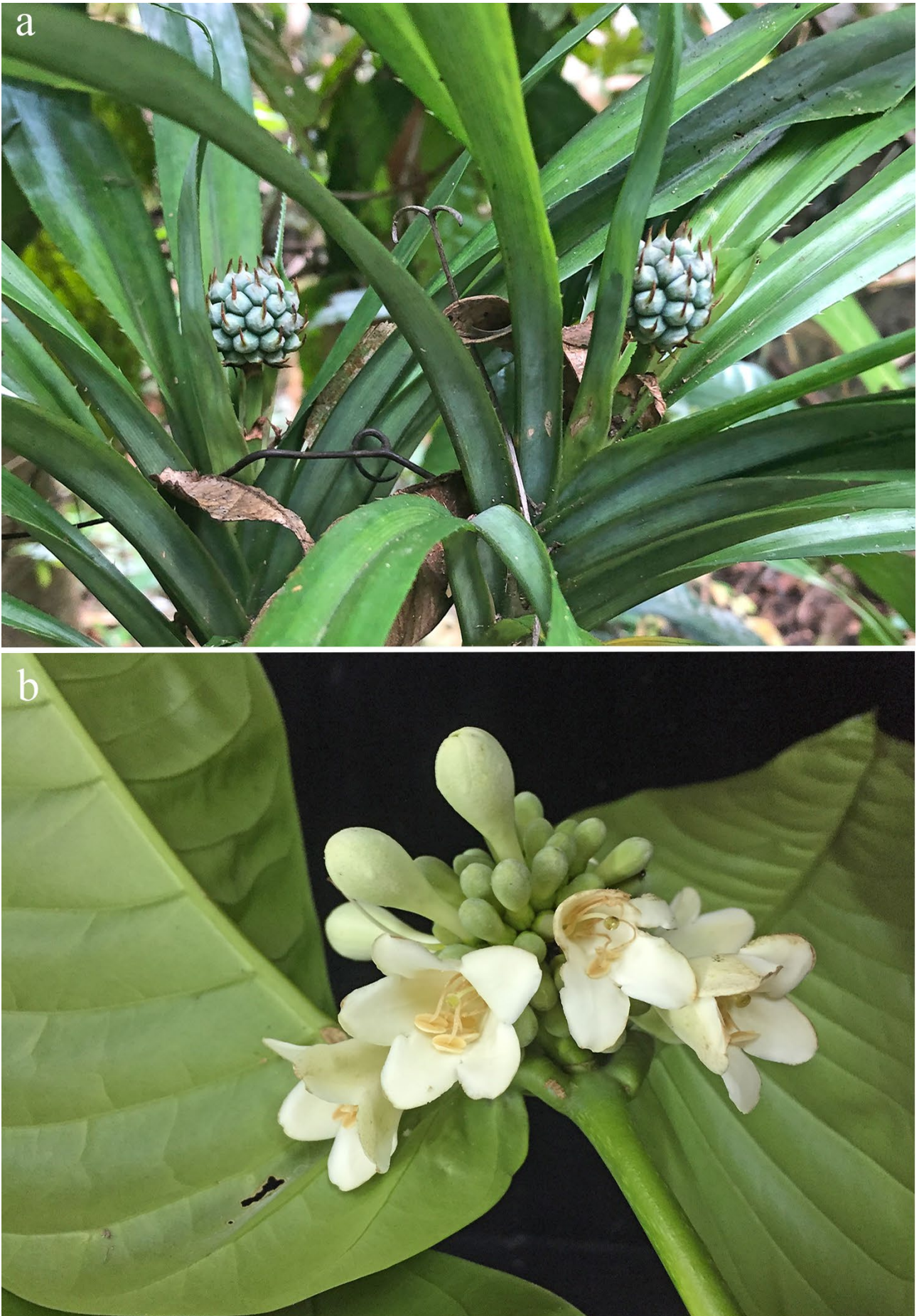
Fig. 7. Examples of species for which Pulau Ubin is the type locality: (a) Benstonea parva , (b) Utania nervosa . (Photographs by: Ng Xin Yi).