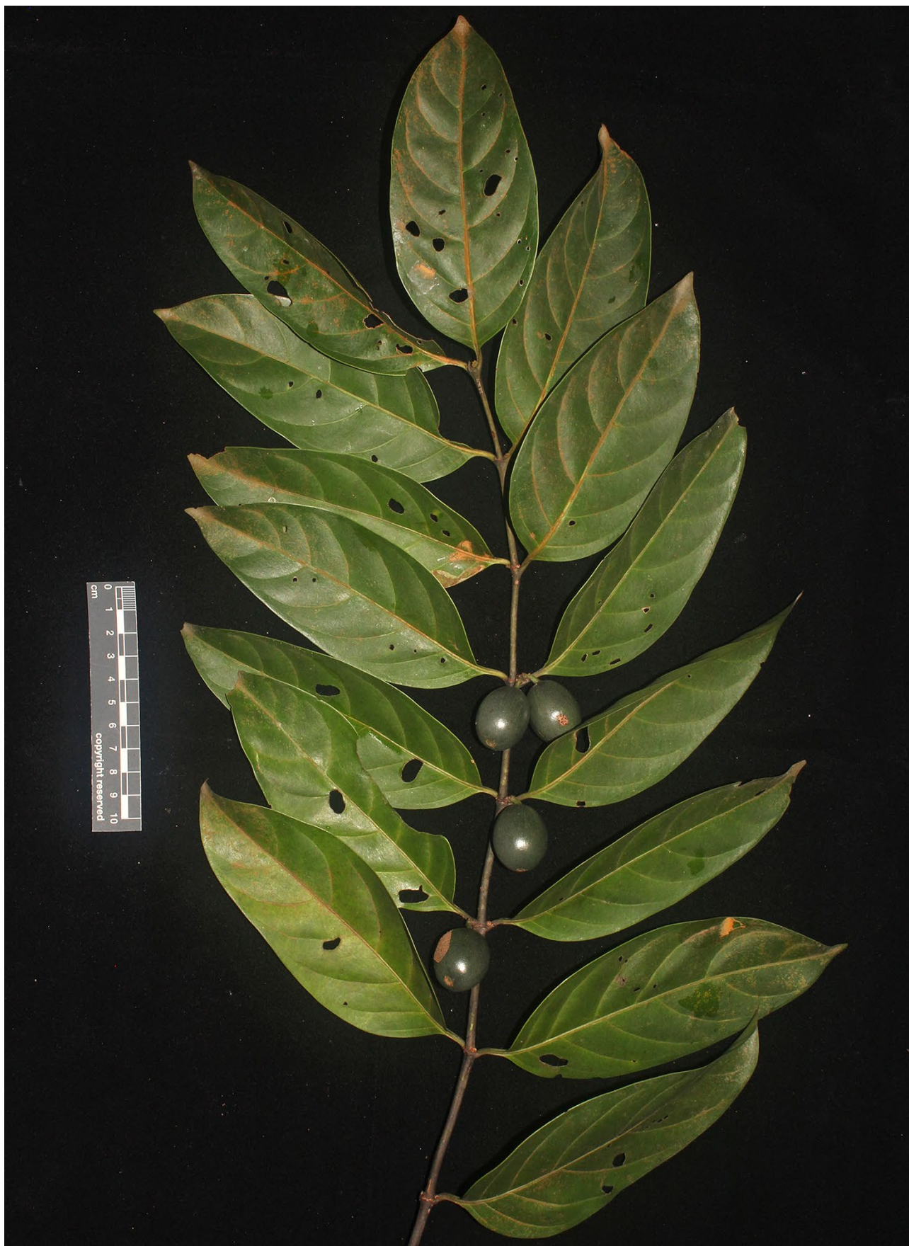
Fig. 1. Canthiamera robusta , an example of a species with a holotype collected in Singapore.

S.K.Ganesan, Utania austromalayensis Sugumaran, Utania nervosa K.M.Wong & Sugumaran and Zingiber singaporense Škorničk. Lasianthus attenuatus var. minor H.Zhu is an example of an infraspecific taxon with a Singapore holotype.