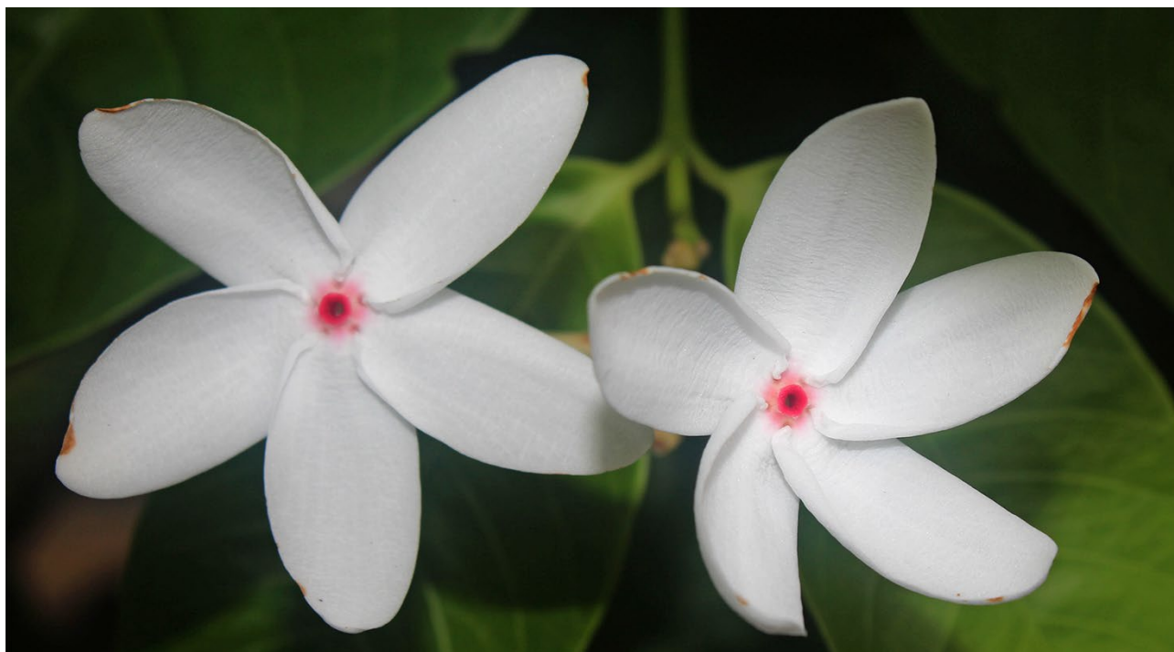
Fig. 3. Kopsia singaporensis , an example of a species with a lectotype collected in Singapore which was selected from original material including specimens from Singapore and from outside Singapore. (Photograph by: Ng Xin Yi).

Examples of names with a neotype from Singapore are: Calamus oxleyanus Teijsm. & Binn. ex Miq. (Henderson, 2020), Dillenia pulchella (Jack) Gilg (Hoogland, 1952), Eurycoma longifolia Jack (Turner, 2021) and Hypolytrum nemorum var. proliferum (Boeckeler) J.Kern. (Simpson, 2019).