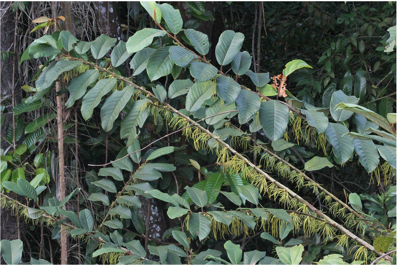
Fig. 2. Drepananthus ridleyi , an example of a species with all syntypes collected in Singapore. (Photograph by: Ng Xin Yi).

Vagueness and confusion may also have to be taken into account. Wallich sometimes seems likely to have confused his collections between Singapore and Penang, and it may be that he included collections from what are now Johore or Riau with his ‘Singapore’ material. For instance, Wallich noted that he found Jackia ornata Wall. [now Jackiopsis ornata (Wall.) Ridsdale] on several of the ‘small islands in the immediate vicinity of Singapore’. Similarly, Trichosanthes wawrae Cogn. was described as being from ‘prope Singapore’ [near Singapore] though the specimens state simply ‘Singapore’.