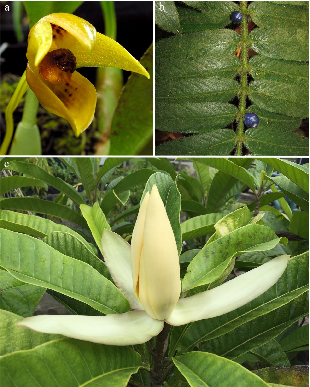
Fig. 5. Examples of species for which Nee Soon swamp forest is the type locality: (a) Bulbophyllum rugosum , (b) Lasianthus attenuatus var. minor , (c) Magnolia singaporensis .