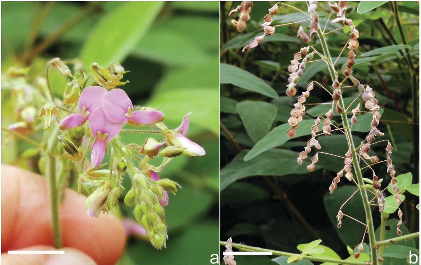
Fig. 2. Desmodium tortuosum . a, Flowers with pinkish-purple corolla (scale bar = 1 cm); b, Mature inflorescence with twisted pods, each subtended by an elongated pedicel (scale bar = 2 cm). All from M.W.S. ONG SING2022-847 (SING).

subshrub. Vegetative specimens may be confused especially when Desmodium tortuosum can sometimes have fused stipules that are clasping the stem (amplexicaul) (Fig. 1e) like those typical of Desmodium scorpiurus . Apart from the characters already mentioned above, the loment segments or articles of Desmodium tortuosum are nearly isodiametric, i.e., as long as wide, whereas those of Desmodium scorpiurus are linear, at least 10 times longer than wide.