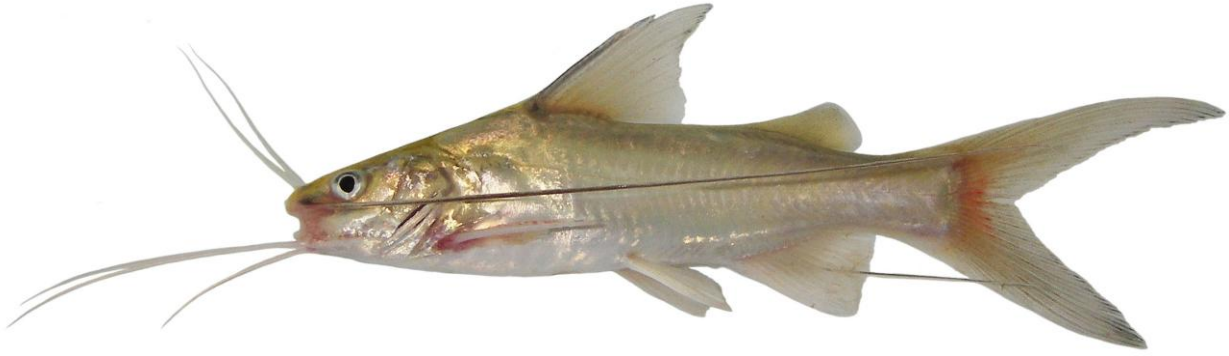
Fig. 1. Mystus wolffii , ZRC 53260, 61.2 mm SL; Singapore: Punggol Reservoir..

Diagnosis. — Mystus wolffii is easily distinguished from Southeast Asian Mystus species by the combination of extremely long maxillary barbels (reaching to or beyond the middle of the anal-fin base), a relatively short adipose-fin base (12–15% SL) that is approximately as long as the anal-fin base and a uniformly gray body devoid of any other markings.