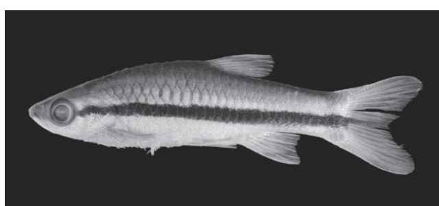
Fig. 3. Rasbora einthovenii . ZRC 50123, 32.1 mm SL; West Kalimantan: Sambas.