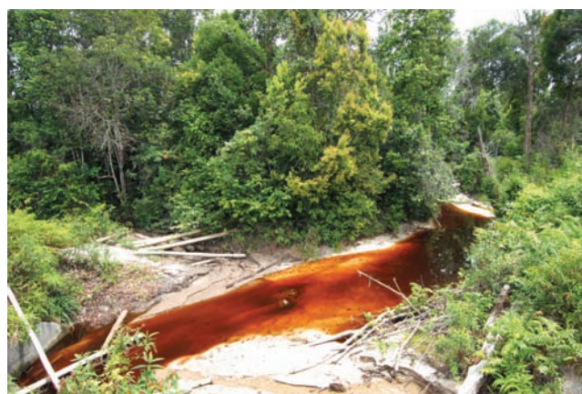
Fig. 5. Type locality of Rasbora patrickyapi (March 2008).