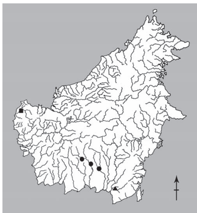
Fig. 4. Map of Borneo showing distribution of Rasbora patrickyapi (circle); type locality of Rasbora einthovenii (square); type locality of Rasbora kalochroma (triangle).

Rasbora patrickyapi can be differentiated from the rest of striped rasboras occurring in Borneo (namely R. agyrotaenia , R. cephalotaenia , R. dusonensis , R. gracilis , R. rutteni , R. sarawakensis , R. tornieri and R. trifasciata ) by the following characters: it is a stenotopic inhabitant of peat swamps (vs. riverine habitat of R. agyrotaenia , R. dusonensis and R. tornieri ; vs. hill stream habitat of R. rutteni , R. sarawakensis and R. trifasciata ; vs. swamp forest habitat of R. cephalotaenia and R. gracilis ), lateral scale count of