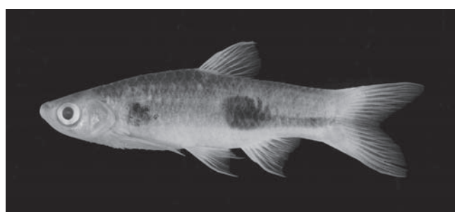
Fig. 2. Rasbora kalochroma . ZRC 51752, 37.9 mm SL; Central Kalimantan: Rungan.