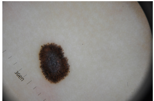
Fig. 3. Reed nevus. Dermoscopy of Reed nevus showing the classical starburst pattern.

more on beliefs than on proper scientific evidence. In this review, we answer the most frequently asked questions posed by parents and caregivers, basing our responses on scientific evidence.