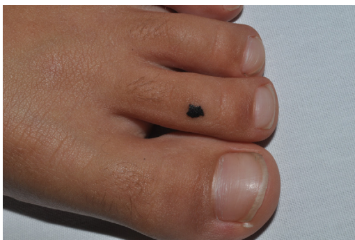
Fig. 2. Reed nevus. Hyperpigmented irregularly bordered lesion on dorsum of toe.

MN appear mainly in childhood and are a cause for concern in parents and caregivers, because of the aesthetic consequences and the risk of malignant transformation, and other uncertainties based