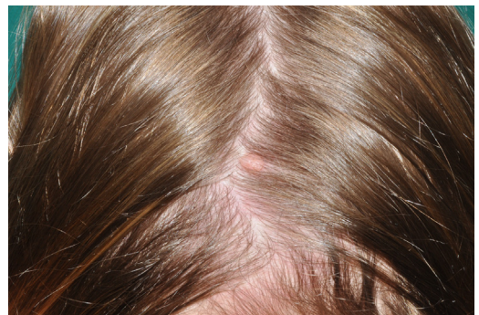
Fig. 6. Raised acquired pink melanocytic nevus on the scalp in a 14-year-old girl. The lesion was excised because of repeated traumatization of the lesion during hair styling.

Physicians and school policies play a crucial role in educational interventions to promote sun-protective behaviors, but, most interestingly, only 44% of adolescents and their parents reported receiving advice on photoprotection from their physicians, whereas only 22% of physicians acknowledged giving recommendations on the subject to their patients. 62 A recent survey among pediatricians showed that sun protection ranked low among preventive topics