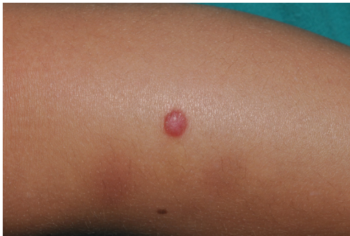
Fig. 1. Spitz nevus. Red dome-shaped papule on the lower limb of a 3-year-old boy.

general, dysplastic nevi are rare in childhood except in the context of dysplastic nevus syndrome, defined by the existence of a history of melanoma in one or more first- or second-degree relatives, the presence of 50 or more MN with the aforementioned “atypical” clinical appearance, and their distinctive histologic characteristics. Despite their low frequency, patients with atypical or dysplastic nevi compose a particular subgroup to consider because of their increased likelihood of developing melanoma. 9