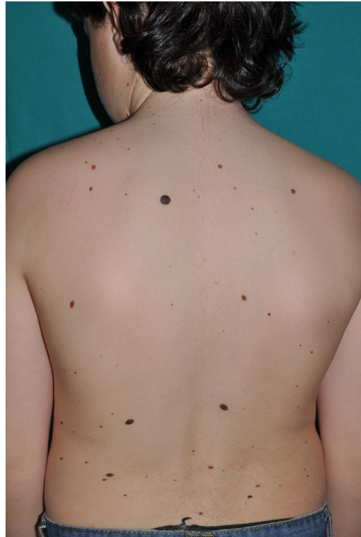
Fig. 4. Acquired melanocytic nevus. Twelve-year-old boy showing numerous acquired melanocytic nevi on the back. Note the different size, morphology, and color.

Regarding sun exposure, it seems that the intensity of sun exposure is proportional to the number of AMN, 30,31 whether it is intermittent or continuous. 32 The beneficial effect of sunscreens during childhood in reducing the appearance of MN is controversial. A meta-analysis of the literature published in 2013 found no evidence that the use of sunscreens in childhood prevented the appearance of MN, 33 but another more recent study observed this beneficial effect if the sun protection factor (SPF) is higher than 30. 29 On the contrary, the use of sunscreens with an SPF less than 30 is related to a tendency to develop a vaster number of nevi, probably caused by the combination of insufficient protection and a false sense of security. 29