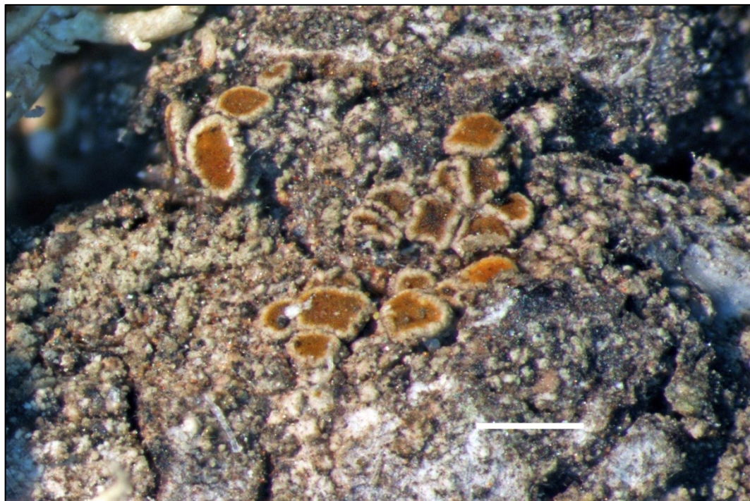
Figure 3. Caloplaca marchantiorum . Holotype. Scale: 500 \mu m.

Caloplaca marchantiorum : Australia. New South Wales : North Western Slopes, between Delungra and Warialda, along the Gwydir Highway, Eucalyptus woodland, on bark, 2004-01-17, S. Kondratyuk 20458 (CANB, holotype) (fig. 3).