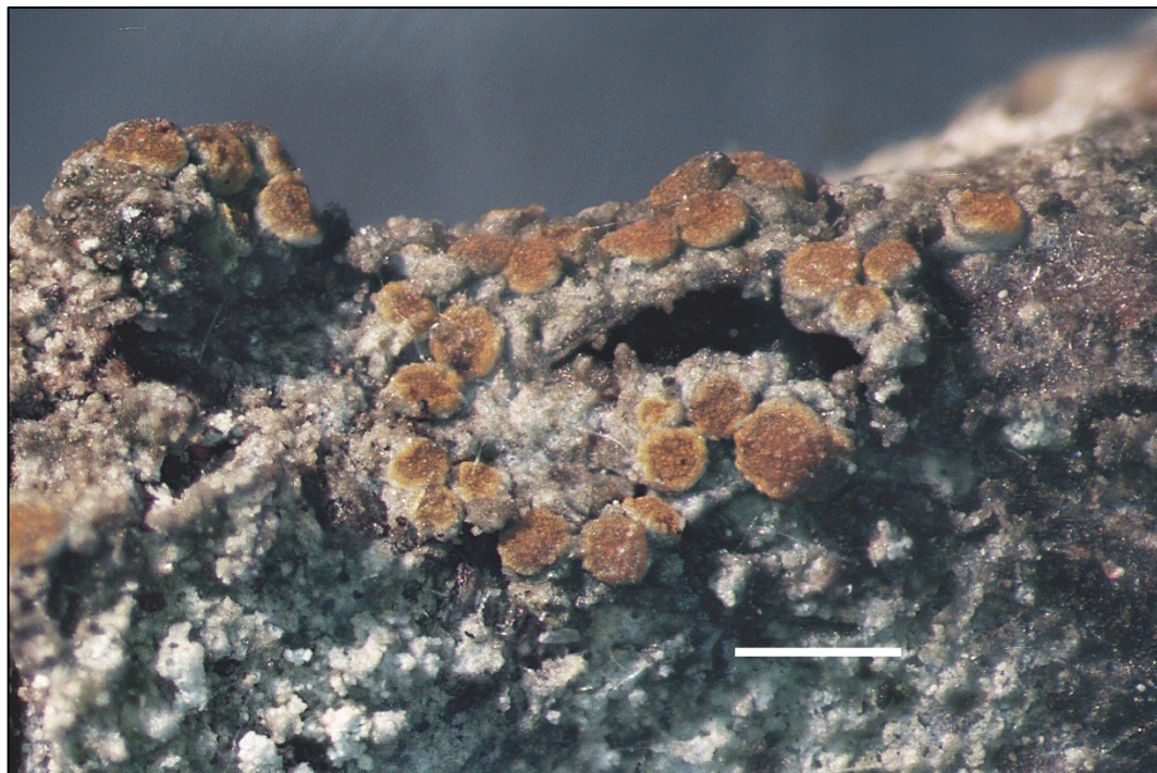
Figure 1. Marchantiana asserigena . Thy. Hanstholm Reservatet. US 12.238 (C). Scale: 500 \mu m.

it has since been found on thin, dead twigs of dwarf bushes like Calluna , Empetrum and Vaccinium in heathlands both in Jutland and Zealand.