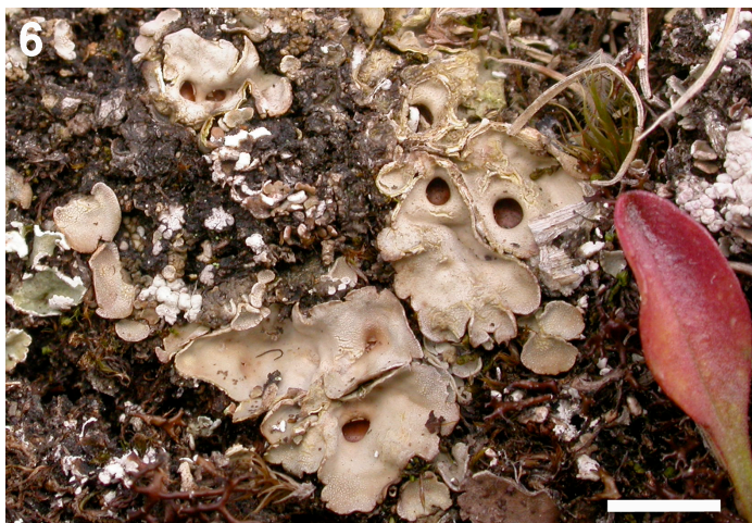
Figure 6. Solorina octospora , 4 Aug. 2011, Berglund (herb. Berglund). Scale bar = 5 mm.