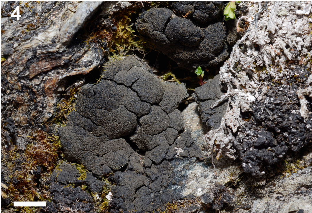
Figure 4. Placynthium pulvinatum , Westberg P113 (S F263268). Scale bar = 5 mm.

Specimens examined: Pältsan, on NW slope below the highest ridge. 69.01138°N, 20.23852°E. 3 Aug. 2011, Nordin 7215 (UPS L-548927); 800 m ENE of the middle peak (1444 m.) alt. 1110 m, 69.01167°N, 20.24187°E. 3 Aug. 2011, Svensson 2219 (herb. Svensson).