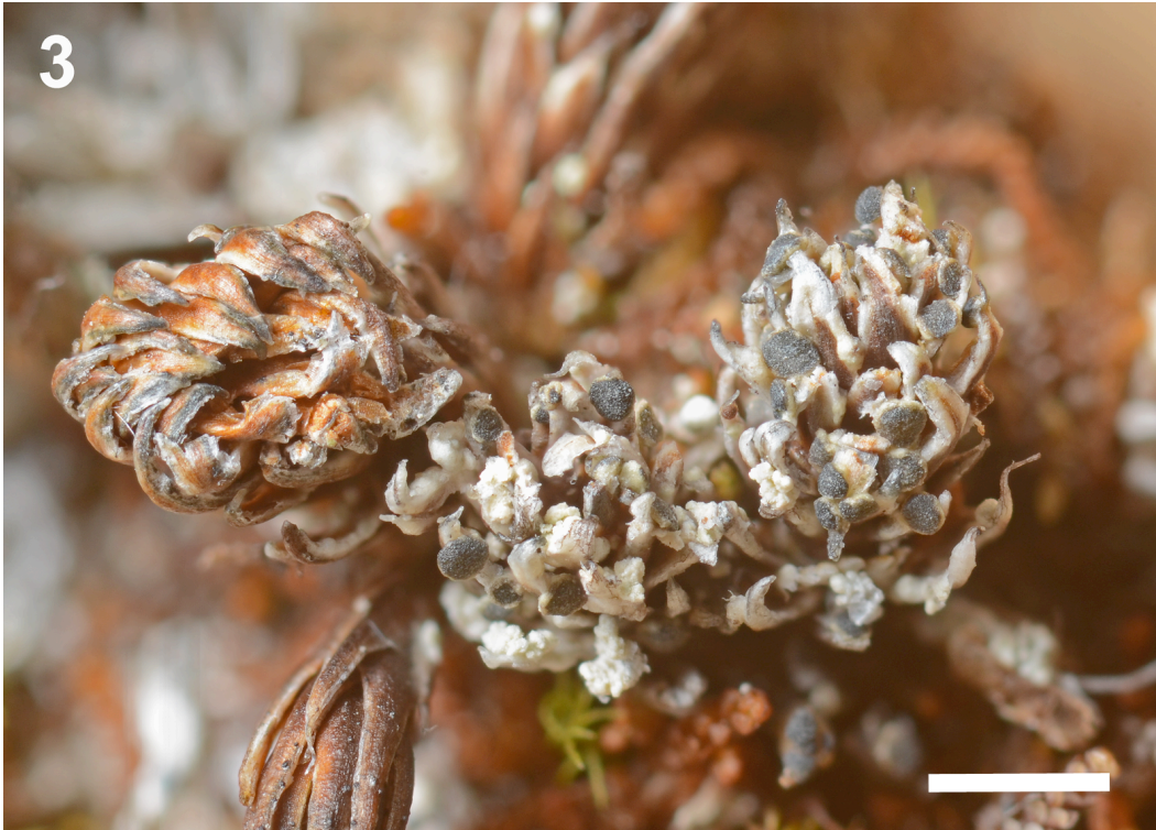
Figure 3. Lecanora leptacinella , Westberg P124 (S). Scale bar = 1 mm.

Specimen examined: Pältsan, on N-facing slope c. 1.7 km NW of the middle peak (1444 m), alt. 1110 m, 69.01953°N, 20.19675°E. 6 Aug. 2011, Berglund (herb. Berglund).