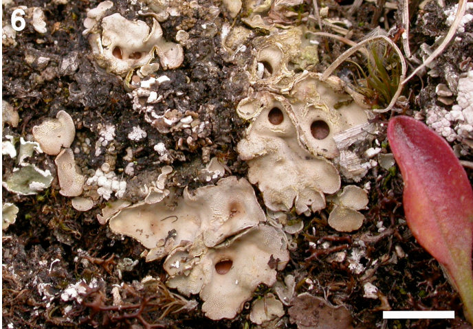
Figure 6. Solorina octospora , 4 Aug. 2011, Berglund (herb. Berglund). Scale bar = 5 mm.