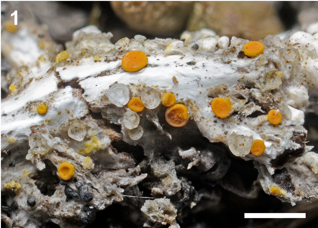
Figure 1. Austroplaca subtiroliensis , Arup L11057 (LD). Scale bar = 1 mm.

Specimen examined : Pältsan, on N-facing slope of a central peak (1267 m), alt. 1125 m, 69.01951°N, 20.19434°E. On dead Dryas with Blastenia ammiospila . 5 Aug. 2011, Arup L11057 (LD).