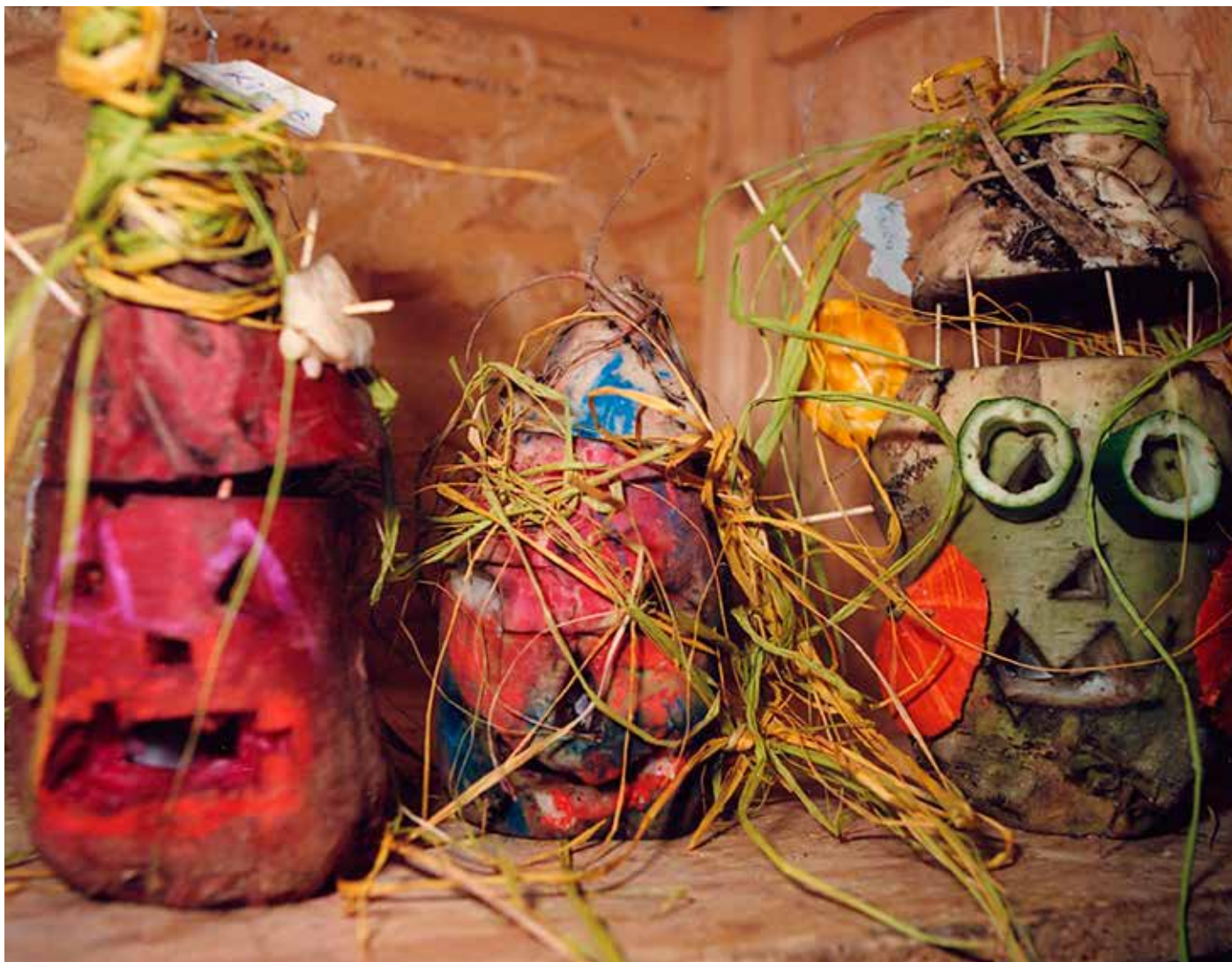
Halloween in Luxembourg: d'Trauliicht brennen