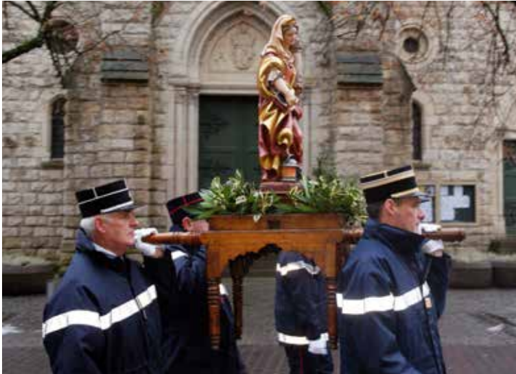
Bärbelendag in the south of the country

The Oesling village of Munshausen has a very special connection to Saint Hubertus: since 1983, its coat of arms features the stag with the cross between its antlers. In addition, ever since 1989, on the Sunday after Saint Hubertus' Day, the village of Munshausen holds the Munzer Haupeschaart (Munshausen Hubertus market), which is said to have already existed in the 17th century. To celebrate the occasion, the open-air museum A Robbesscheier puts on a spread of mostly regional delicacies. This day also sees a revival of the old traditions and customs surrounding rural life in the Oesling.