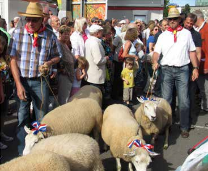
Opening of the Schueberfouer with the Hämmelsmarsch

to this day in the capital, a sheep was taken along. The origin of the name Schueberfouer , on the other hand, has to date not met with an unequivocal explanation. It appears to be derived from either its original location, the Schuedbierg , or else from Schober , the German word for store room that was adjacent to every farm house and used to store animal feed, since ultimately the original fair took place around the day of Saint Bartholomew, i.e. around harvest time.