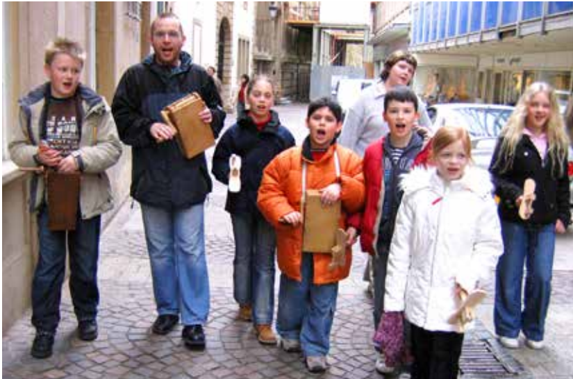
The children go klibberen