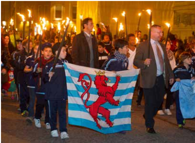
Torch procession on the eve of national day

The actual celebrations start on the eve of 23 June with a torch procession followed by large-scale fireworks with musical accompaniment in the capital and elsewhere in the country. Visits by various members of the grand-ducal family also take place to mark the occasion in other localities throughout the country. On national day itself, parades, church services, concerts and receptions are held. The capital also hosts a military parade and a celebratory Te Deum in the Cathedral of Our Lady. Gun salutes end the day in honour of the Luxembourg monarch and his people.