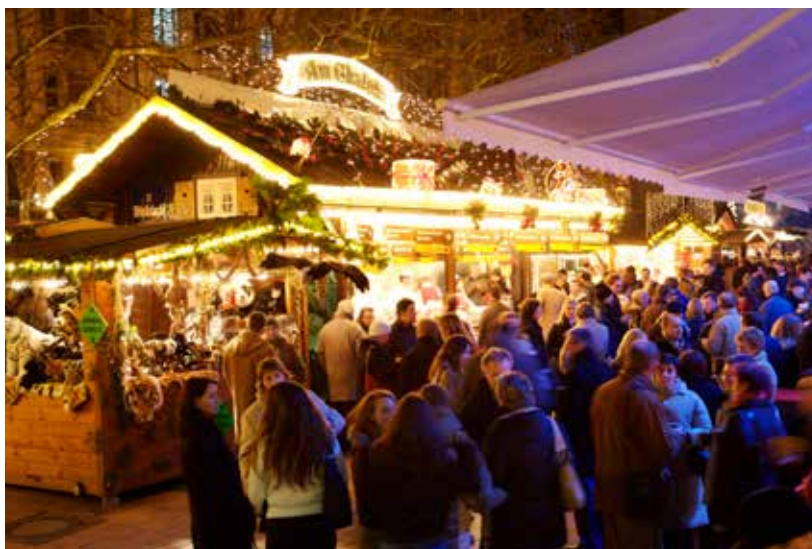
Chrëschtmaart with wooden chalets

Incidentally, Luxembourg's Kleeschen must under no circumstances be mistaken for the American Santa Claus or the French père Noël – these are thoroughly distinct gentlemen. It is also useful to know that Luxembourg is the only country in which children attending fundamental school get a day off on 6 December, so that upon waking they can focus their attention on opening their presents.