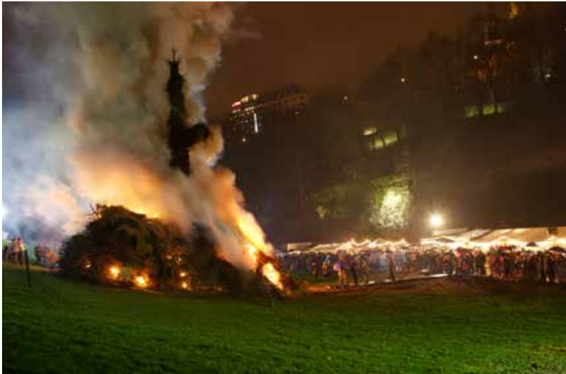
Buergbrennen in the capital