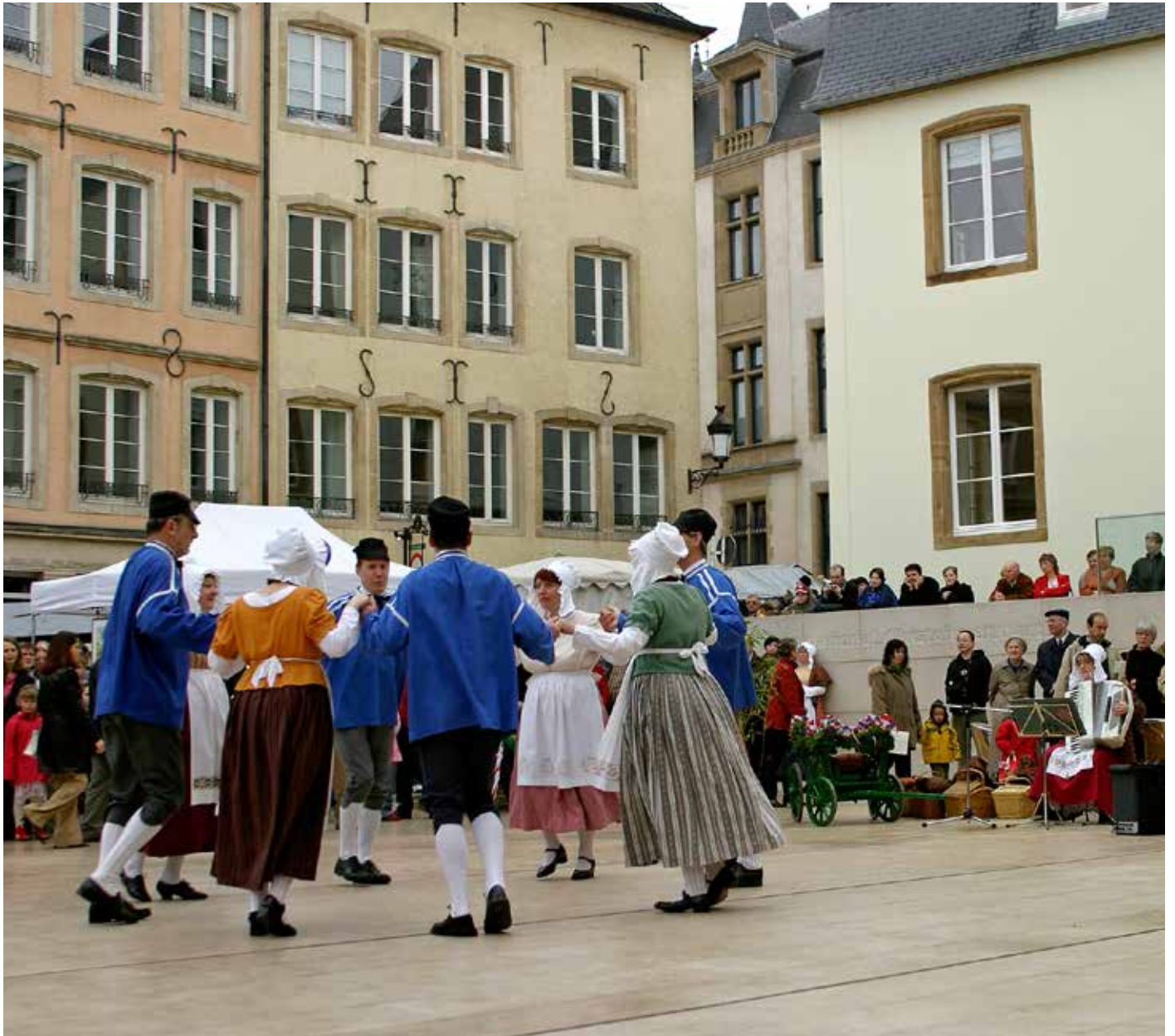
Folkloristic dance group in Luxembourg City