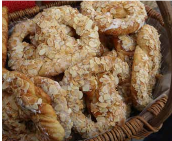
Bretzelsonndeg

The exact origin of this incendiary celebration is not known. The earliest documented mentions date back to the year 1884. In the past, a Stréimännchen was also set ablaze in Echternach, in the country's east. In the meantime, however, this tradition no longer features on the events calendar of the small abbey town.