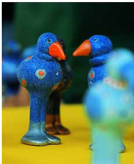
Péckvillercher at the Éimaischen