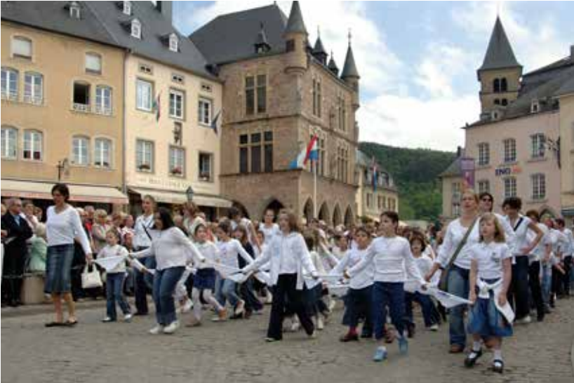
Sprangpressessioun in Echternach