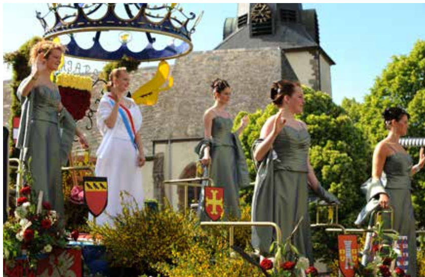
Geenzefest in Wiltz