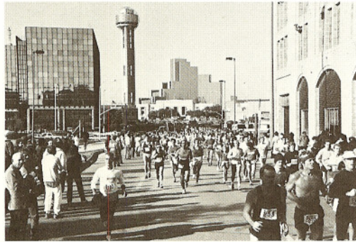
MALE AGE GROUP 30 - 34