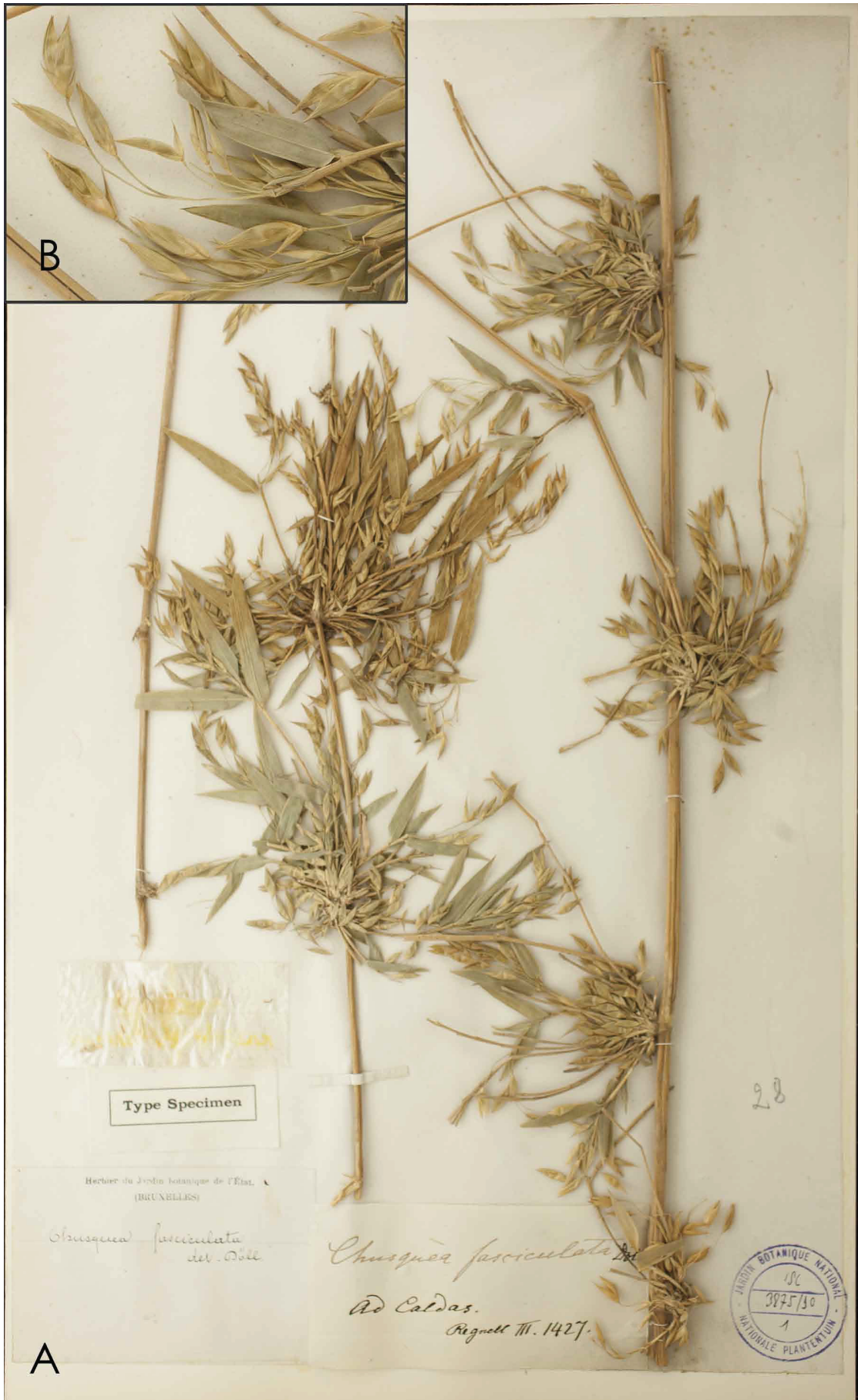
FIGURE 3. Chusquea fasciculata . A. Portion of flowering stem, B. Close-up of spikelets. A and B were taken by P. Klahs based on Regnell III 1427, lectotype sheet (MB).