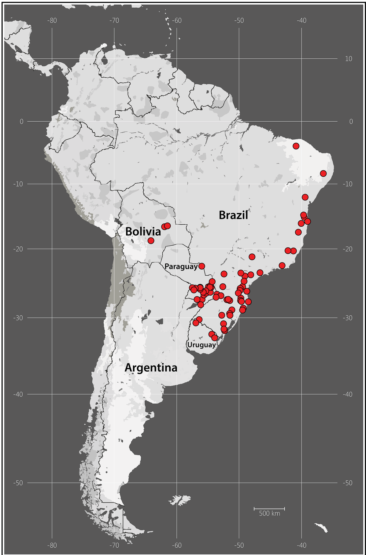
FIGURE 2. Distribution map of Chusquea ramosissima .