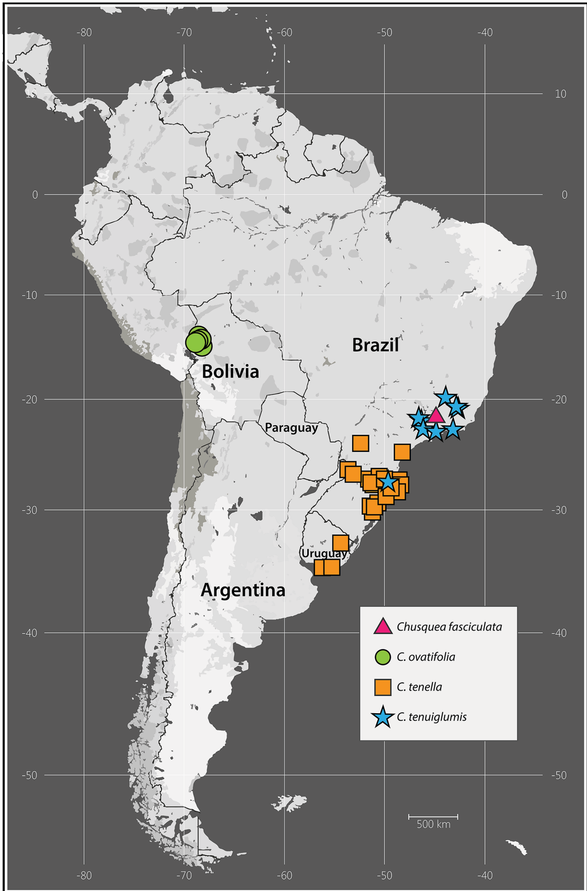
FIGURE 1. Distribution map of Chusquea fasciculata , C. ovatifolia , C. tenella and C. tenuiglumis .