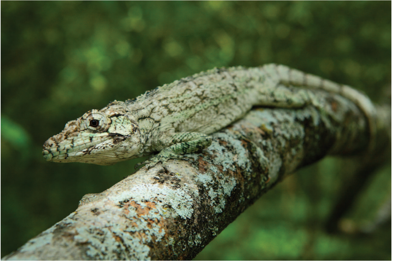
Figure 1: Anolis landestoyi sp. nov. (DLM_DR2011_11), posed in natural habitat.

online). Distinguishable from similar anoles in the Cuban chamaeleonides clade by dewlap color and pattern; absence of a large, rugose parietal casque in adults; presence of nuchal ocellus; presence of a single scale between nasal and rostral, flank scales in partial contact; weakly to strongly keeled ventrals; and multicarinate supradigitals (table S3). Additional diagnostic information is provided in section S1(c) of the appendix and table S3.