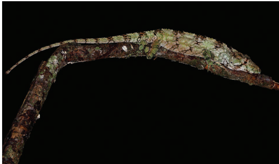
Anolis landestoyi perched on a branch.