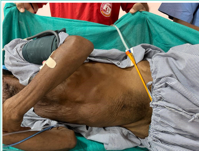
Figure 1: Log Rolling Technique for patient.

and any adverse effects e.g. nausea, vomiting, urinary retention, nasal congestion were noted.