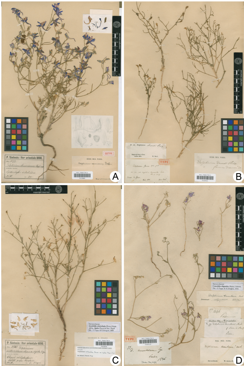
Figure 2. Three lectotypes (and one isolectotype) selected among the 21 lectotypes designated in this article A isolectotype of Delphinium armeniacum Huth (P00195865; http://coldb.mnhn.fr/catalognumber/mnhn/p/p00195865 ) B lectotype of D. deserti Boiss. (P00197319; http://coldb.mnhn.fr/catalognumber/mnhn/p/p00197319 ) C lectotype of Delphinium sclerocladum Boiss. var. rigidum (Frey & Sint.) Hossain & P.H.Davis (P00195794; http://coldb.mnhn.fr/catalognumber/mnhn/p/p00195794 ) D lectotype of D. tomentosum Boiss. (P00201127; http://coldb.mnhn.fr/catalognumber/mnhn/p/p00201127 ). All four specimens are kept at P Herbarium.