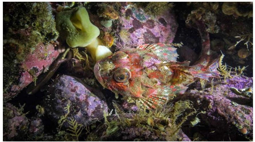
Red irish lord ( Hemilepidotus hemilepidotus )

Algae and seagrasses were not a diverse biota group at the areas surveyed at the Hoeya Sill. Agarum, filamentous red algae, and Ulva spp. were moderately common in shallower depths. Deep water and glacial till likely limit their persistence to intertidal or shallow subtidal areas.