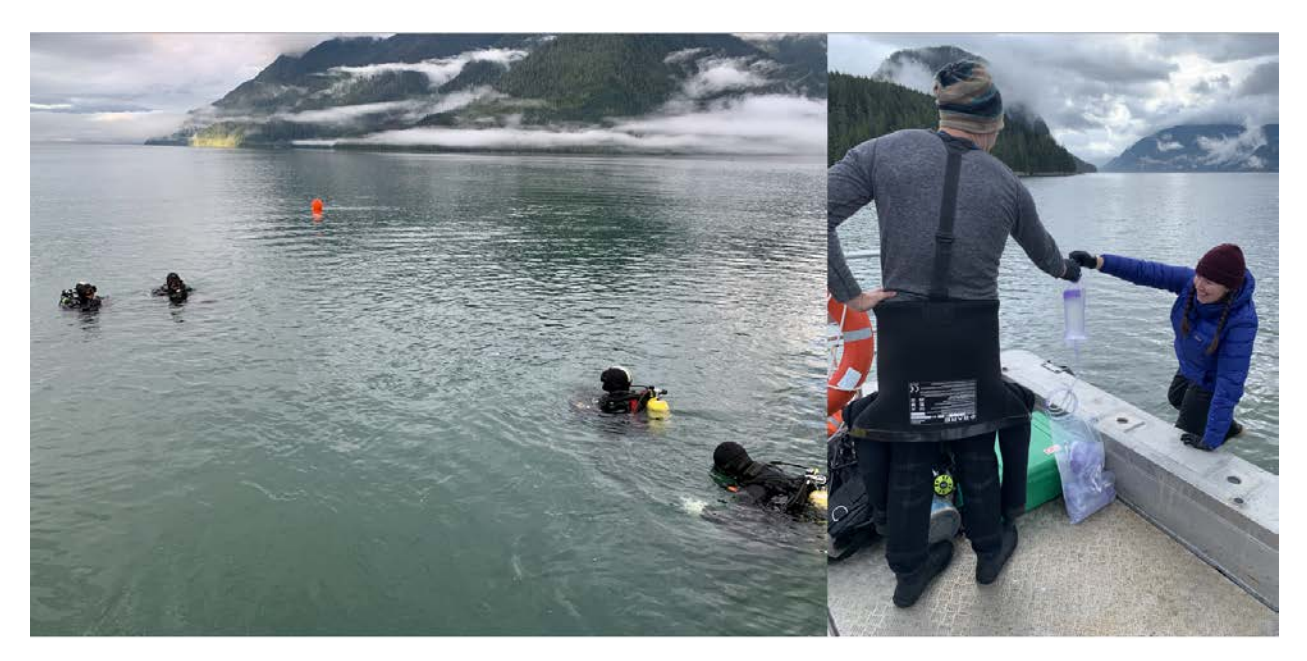
Left: Scuba divers at Hoeya Head. Right: Collecting eDNA water samples at the surface.

Environmental DNA (eDNA) water samples were also collected during dives at maximum depth, mid-column, and at the surface in 1L bottles. Each depth had 3 replicate samples taken for up to n = 9 samples per site. Water samples were filtered with Sterivex and fixed with Longmires solution until lab processing at the Hakai Institute genomics lab on Quadra Island for winter 2020.