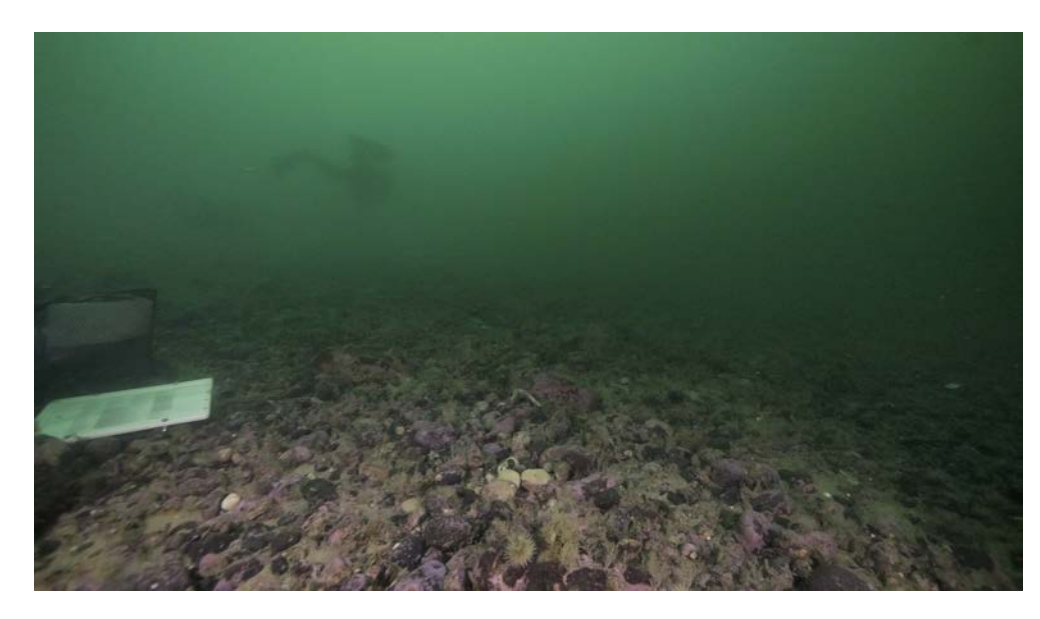
Photo 1. Substrate of KNI1 at 17 m depth. Bottom left: A diver's slate for scale.

KNI1 - Substrate was dominated by cobbles embedded in sand with some boulders present. Slope was 10-20°. Halocline was deep with glacial till reaching down to ~13m. Below 18m, the current appeared strong enough to move boulders. Biological cover included encrusting corallines, colonial hydroids, and seastar aggregations.