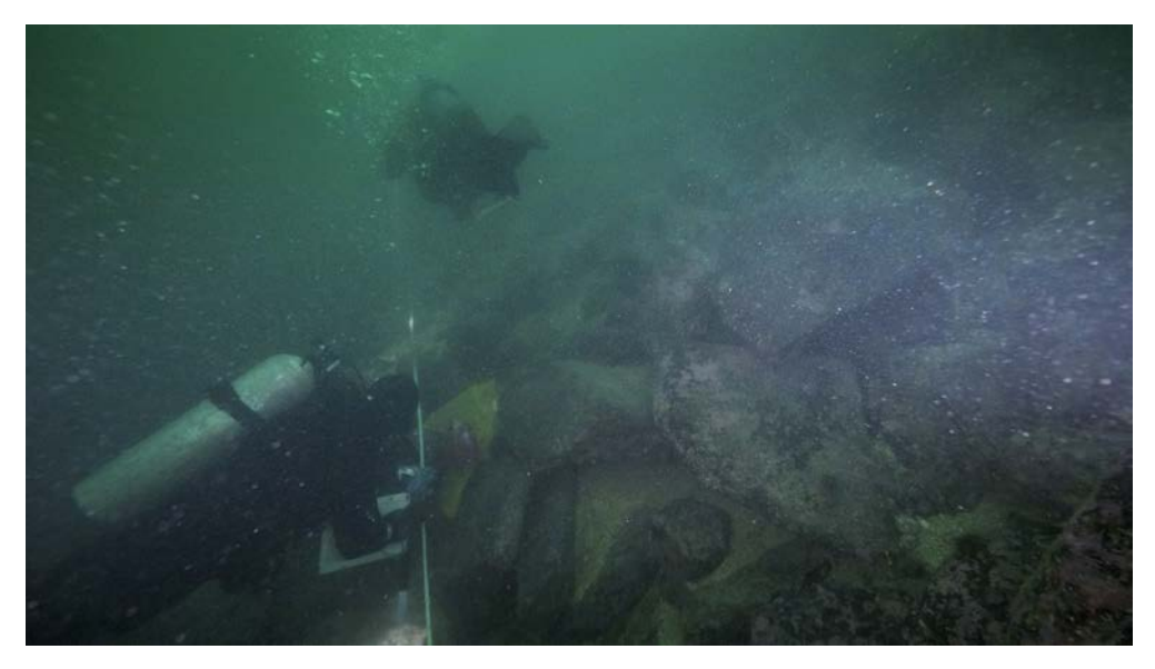
Photo 2. Habitat at KNI2 at 15 m depth where boulders were the dominant substrate. Photo shows divers conducting a 30 m seastar transect.

KNI2 - Steep wall approximately 0.5 km east of Hoeya Head. Substrate was primarily boulders next to a bedrock wall. Biological cover included seastars at greater depths, and barnacles and mussel beds in the intertidal.