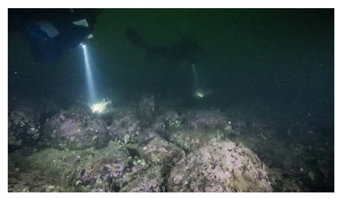
Photo 3. 15m depth at KNI7. Boulders were the dominant substrate. Divers for scale.

KNI7 - Habitat consisted of 95% medium boulders (1 - 3 m in size) and 5% shell hash. Low gradient slope (5°). Biological cover consisted of primarily hydroids, feather stars, and encrusting coralline algae.