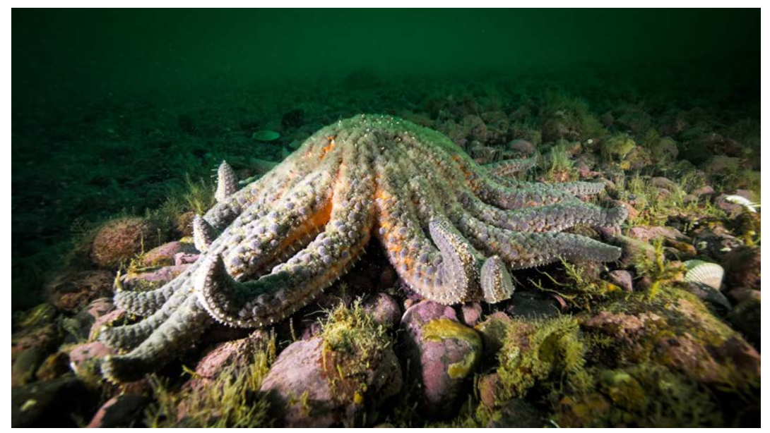
Adult Pycnopodia helianthoides

Common large mobile invertebrates surveyed were multiple species of seastars, Coonstripe shrimp ( Pandalas danae ), decorator crabs ( Chorilia longipes, Oregonia gracilis ), red-veiled chitons ( Placiphorella rufa ), and aeolid nudibranchs ( Flabellina spp.). Seastars were particularly specious and high in abundance at the sill (see Table 1). Most notably, aggregations of large (radius: mean = 12.7 \pm 6.3 cm, max = 32 cm) sunflower stars ( P. helianthoides ) were commonly observed with a mean density of 0.5 individuals per m<sup>2</sup>. The full size spectrum of sunflower stars at Hoeya Sill (Fig. 2) is a relatively rare finding on the Northeast Pacific coast. Sunflower seastars have shown an unprecedented decline starting in 2015 due to wasting disease. BC specificalled had a 96% decline in population abundance (Harvell et al. 2019). On exposed outer coastlines, anecdotal observations report primarily juvenile populations of small sunflower stars.