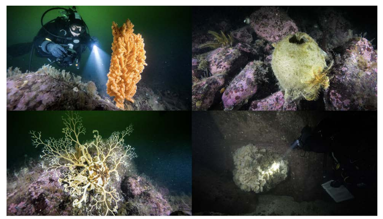
Top left: Red-tree gorgonian coral ( P. pacifica ). Top right: Sharp lipped boot sponge ( R. dawsoni ). Bottom Left: Basket star ( G. eucnemis ). Bottom Right: Diver observing a cloud sponge ( A. vastus ).

Our surveys indicate high diversity at the Hoeya Sill across phyla (Table 1). We found the deepwater emergence of Cnidarian species that are not generally observed at shallow depths. We recorded red-tree gorgonian corals ( Primnoa pacifica ) between 16 - 19.9 m depths at KNI7. At this site, they were relatively abundant with >10 individuals observed at the maximum survey depth of 19.9 m. At the shallow range edge (16m), they were present, but at lower densities. We did not find them at the majority of our sites (Fig. 1) suggesting they are patchily distributed and/or the majority are deeper than we surveyed (e.g., deeper than 18m). Additional deep-water associated species such as basket stars ( Gorgonocephalus eucnemis ), boot sponges ( Rhabdocalyptus dawsoni ), and cloud sponges ( Aphrocallistes vastus ) were also observed at the sill. The sill was rich in pink branching hydrocorals ( Stylaster verrillii ), and ostrich plume ( Aglaophenia spp. ) and sea fir ( Thuiaria spp. ) hydroids - found at every site in high abundance.