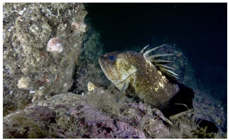
Quillback rockfish (Sebastes maliger)

Rockfish were the most common species of fish at Hoeya Sill, including quillback rockfish ( Sebastes maliger ), yellowtail rockfish ( S. flavidus ), and copper rockfish ( S. caurinus ). A large school of young-of-the-year black ( S. melanops ) and yellowtail ( S. flavidus ) rockfish species-complex was observed at the Sill as well; otherwise juveniles were rare. Moderately common fish species observed were the buffalo sculpin ( Enophrys bison ) and starry flounder ( Platichthys stellatus ). From the transect surveys at KNI2, yellowtail rockfish were seen in schooling abundances (mean count = 125 transect<sup>-1</sup>, 0.26 per m<sup>3</sup>; mean size: 24 cm total length). On average, quillback rockfish were 30 cm and copper rockfish were 31 cm.