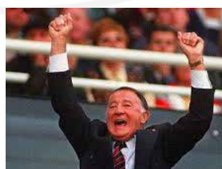
Celebrating a Manly Grand Final try