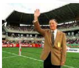
Being honoured at Brookie