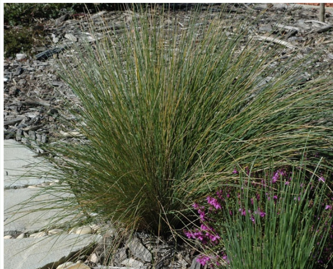
© M. Fagg, Australian National Botanic Gardens

Photographer: Fagg, M., 2007 'Poa morrisii'