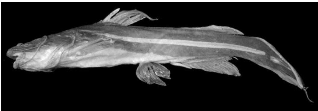
FIGURE 2. Pseudomystus mahakamensis , male, RMNH 7838, 84.6 mm SL.

tle lateral compression; body in shape of elongate cone, widest just behind pectoral fins. Dorsal profile rising evenly but not steeply from tip of snout to origin of dorsal fin, then gently sloping posteroventrally from that point to end of caudal peduncle. Ventral profile horizontal to origin of anal fin, then sloping posterodorsally to end of caudal peduncle. Dorsal origin nearer tip of snout than end of caudal peduncle. Dorsal spine stout, without serrations on posterior edge. Depressed dorsal fin not reaching adipose fin. Pectoral spine stout, with minute denticulations along nearly of all anterior edge and with 11–14 large serrae on posterior edge (Fig. 3a). Anal origin slightly posterior to vertical through adipose fin origin. Caudal fin forked; upper and lower lobes lanceolate, upper lobe about twice as long as lower, with upper simple principal ray very elongate.