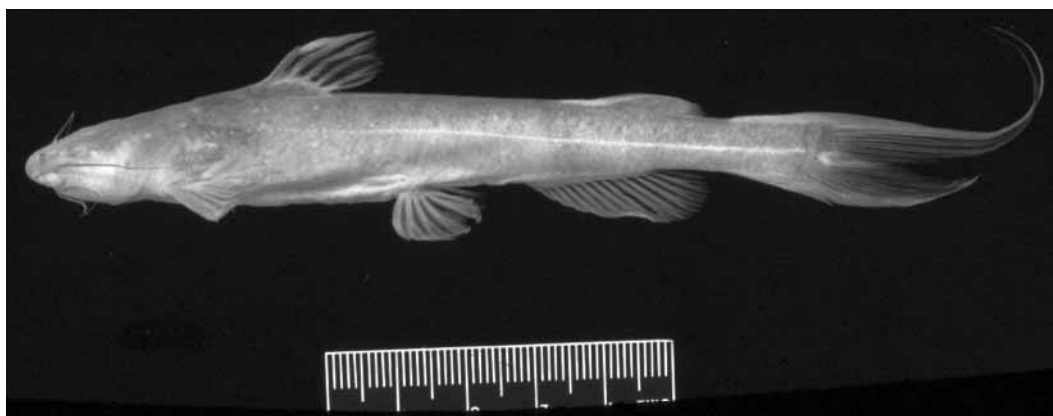
FIGURE 1. Pseudomystus ornatus , paratype, male, ZRC 46152, 80.1 mm SL.

Diagnosis. Pseudomystus stenogrammus (Fig. 1) and P. mahakamensis (Fig. 2) are immediately distinguishable from all other Pseudomystus by a pigmentation pattern of a light, midlateral stripe on a dark back ground instead of either a uniform colour pattern in adults ( P. inornatus and P. robustus ) or a colour pattern of light, transverse bands and/or blotches on a dark background (all other species). They are also distinguished from all their congeners by a strongly depressed head and deeply forked caudal fin with very long, lanceolate lobes, strongly asymmetric, upper lobe longest (vs. moderately depressed head and caudal fins with triangular lobes that are subequal, with upper lobe slightly longer).