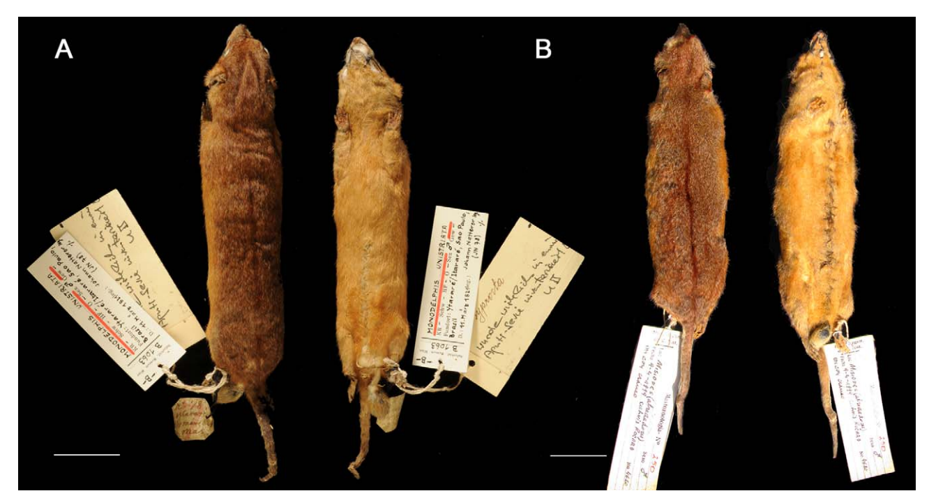
FIGURE 1. A) Dorsal and ventral views of skin of holotype of Monodelphis unistriata (NMW B 1063). B) Dorsal and ventral views of skin of second known specimen of M. unistriata (MACN 250). Scale bars: 20 mm.

(following dorsal line), 211.0; total length (following flat ventral line–most likely the best match to the measurement taken from the fresh specimen flat on its back), 199.6; hind foot c. u., 16.2; ear (crumpled), 5.3. [For illustrations showing "European" and "American" measurements, see Martin et al. (2001)].