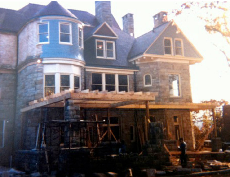
Summer home of H.G. Davis.