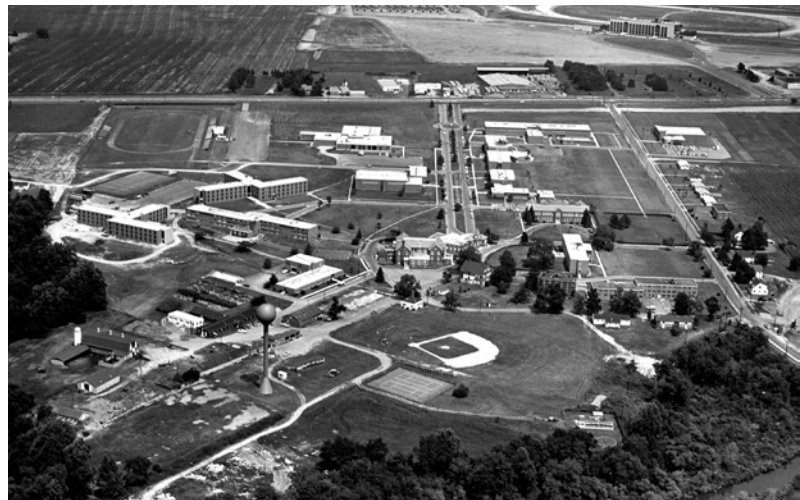
Delaware State University and Dover Downs Speedway, circa 1968.