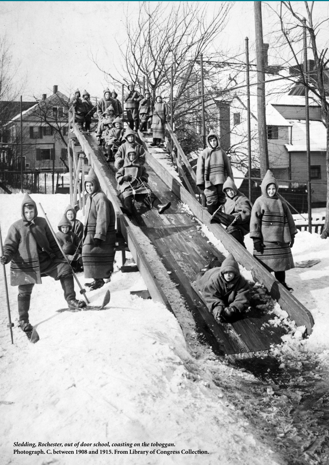
Sledding, Rochester, out of door school, coasting on the toboggan. Photograph. C. between 1908 and 1915.

Delaware | District of Columbia | Maryland | New Jersey | New York | Pennsylvania | Virginia | West Virginia