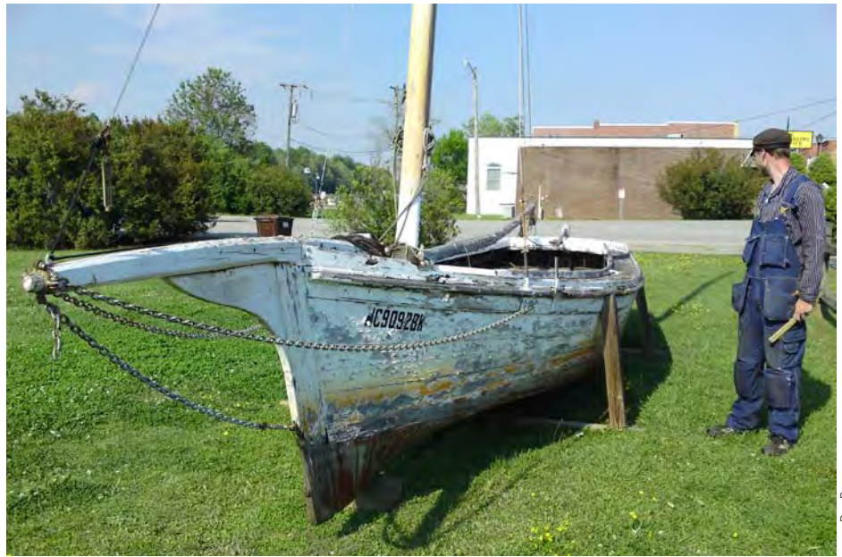
Nat Howe pausing during HIST 6885 Small Boat Recording class in Plymouth, North Carolina.

A small flat bottomed fishing boat, two larger sound boats and a Chesapeake Bay skipjack sailboat were recorded. They were