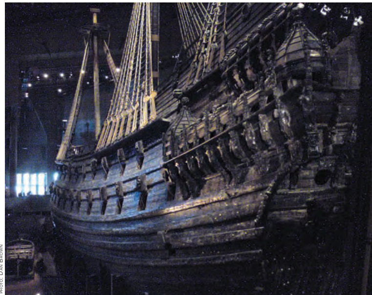
The Swedish Warship Vasa .

During the third week on site, the recording crews moved into the officers’ cabins and the steerage compartment, arranged on two decks in the narrow stern castle aft. Each team took a pair of