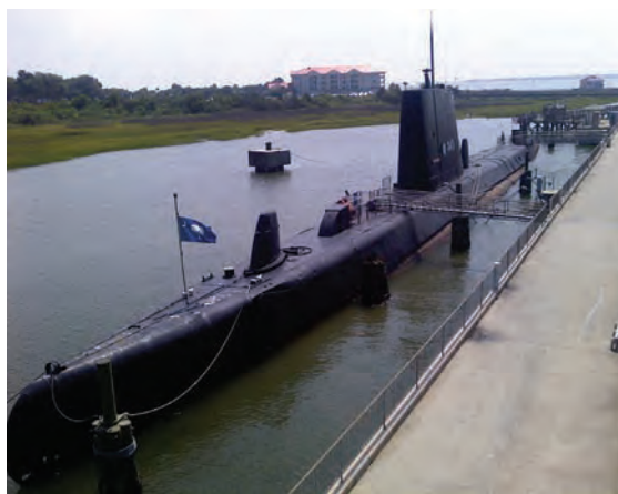
USS Clamagore at Patriot's Point, Charleston, South Carolina.