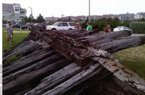
Students examine the remains of a vessel at the Nags Head Town Complex.

Broken hulls, splintered masts, and cargo littering isolated beaches of the Eastern United States were ubiquitous sights prior to the 20th century. For millennia, a sailor's only recourse in case of disaster lay with the solemn duty of his fellow seamen to provide assistance. While wrecks upon the high seas often meant imminent death, the prospect of wrecking upon a deserted shoreline held little hope of rescue. The shifting shoals and barrier islands of North Carolina's Outer Banks epitomized the dangers of an unpredictable and isolated shoreline. Since vessels first starting plying these waters, the coast of North Carolina has become the final resting place for many vessels, earning its nickname: the Graveyard of the Atlantic. During the