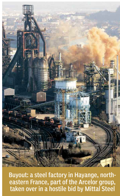
Buyout: a steel factory in Hayange, north-eastern France, part of the Arcelor group, taken over in a hostile bid by Mittal Steel

The Indian billionaire has not been shy in spending his fortune. For tax purposes, Mittal claims 'non-domicile status' – a loophole whereby wealthy foreigners residing in the UK do not pay income tax on their worldwide income. Mittal is an Indian national, temporarily living in Britain, and so he can keep all his foreign capital and income away from the Inland Revenue. Unsurprisingly, all his London properties are owned by offshore companies registered in Jersey. His spending spree started in 2000 when he bought Summer Palace on The Bishops Avenue, Hampstead, for £9 million, which is adorned by photographs of Mittal's encounters with Prince Charles and the Princess Royal. He then upgraded in April