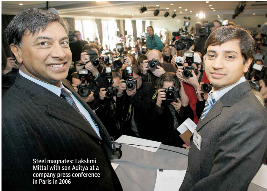
Steel magnates: Lakshmi Mittal with son Aditya at a company press conference in Paris in 2006