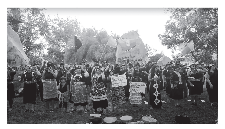
Figure 2: Mapuche women making an afafan with their voices and raising their fists (Wechekeche Ñi Trawün 2019).

been analyzed as a relevant aspect of Mapuche culture in contemporary popular music (Soto et al. 2022).