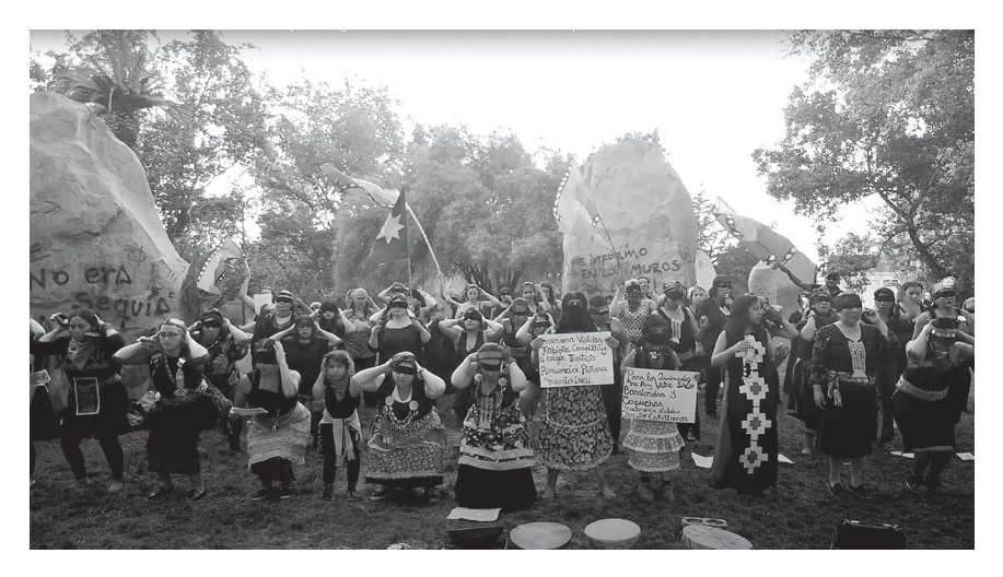
Figure 1: Mapuche women performing squats (Wechekeche Ñi Trawün 2019).