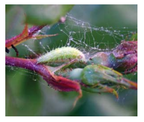
Bristly roseslug larva.