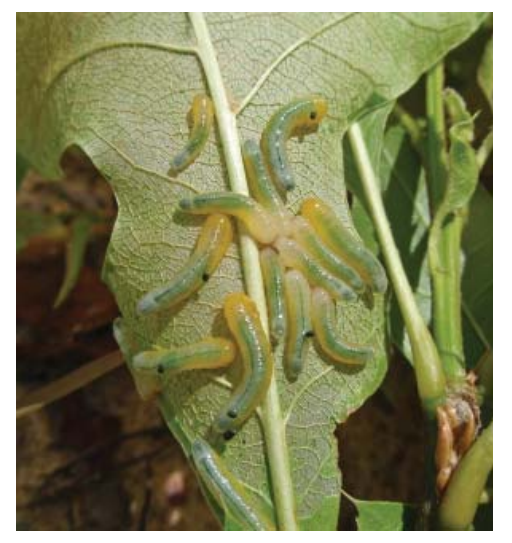
Scarlet oak sawfly larvae.

Pine catkin sawflies , Xyela sp., are odd sawflies and one of PJ's favorites. The adults of these native species are tiny gnat-like creatures and are unlikely to be noticed. As the common name suggests, the larvae live in male pine catkins and drop from the catkins prior to pupation. At the right time, this can be very noticeable when tiny whitish larvae rain down from trees over decks/patios in spring. Naturalist Charley Eiseman has written about this interesting phenomenon on the BugTracks Blog at https://bugtracks.wordpress.com/2013/06/03/larvae-raining-from-pine-trees/.