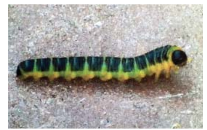
Dogwood sawfly larva.

through the summer, are black, with yellow bars across the back and solid yellow underneath, but often appear white because of a powdery white waxy coating that covers them except during the last instar and following each molt. They can cause guite noticeable defoliation of dogwood shrubs but don't kill the plants. The larvae drop to the ground to overwinter in cocoons made of rotted wood. If the appropriate material is not found on the ground they can invade wood fiberboard or siding of buildings, which may lead to woodpecker damage.