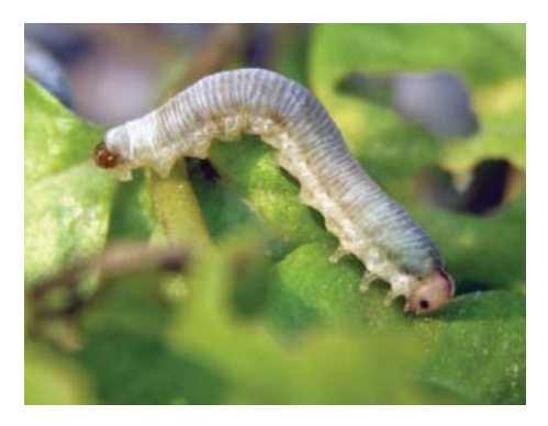
Larva of Monostegia abdominalis.

The eggs hatch in 2-8 weeks (depending on the species and weather) into leaf-feeding larvae which look and often act very similar to caterpillars (the larvae of insects in the family Lepidoptera). Both sawfly larvae and caterpillars have three pairs of thoracic legs, but differ in that caterpillars have 2-4 pairs of prolegs (fleshy, leg-like projections)