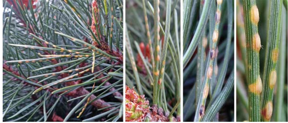
Eggs of European pine sawfly in pine needles.

The adults of sawflies tend to be inconspicuous, and look somewhat like wasps, but do not sting. They feed on pollen and nectar, so may be seen on flowers as well as their larval host plants. They are not very active, making only short flights in sunny weather, and resting on leaves otherwise. Many sawfly species are parthenogenetic; since they do not need to mate to reproduce, males are very rare even in species where males are known to occur. The adults are short-lived, usually only a few days to a week, just long enough to develop and lay eggs. The female sawfly uses its ovipositor to cut into young adult leaves, petioles or stems to deposit her eggs scattered across the leaf surface, along the edge of the leaf, or on a leaf vein, singly or in groups of 30-90 called "rafts" or "pods". Leaf-mining species typically