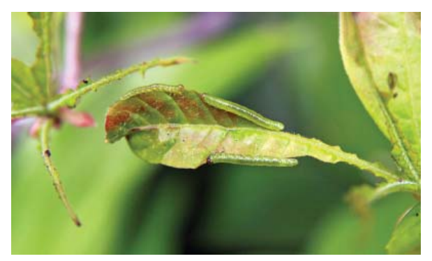
Azalea sawfly on leaf and damage.