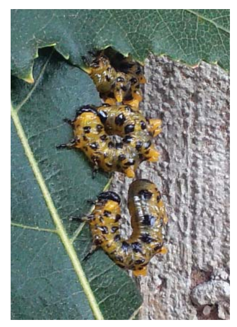
Dusky birch sawfly larvae.

the most common insect pest on this tree. The pale green-yellow larvae with black spots and a black or orange head grow up to ½ to ¾ inch long. The larvae feed in groups and eat entire leaves, leaving only the mid-veins, defoliating an entire branch before moving to another. They overwinter as prepupae in the soil, with adults emerging beginning in early June. Larvae of the first generation can be seen from mid-June through early August, while second generation larvae are usually found in late August or September.