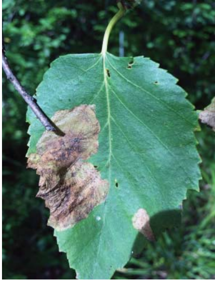
Elm sawfly larvae.

European, white, gray and paper birches, but yellow and river birch can also be affected. The small, flattened white larvae form small, blistered translucent spots on new leaves as they feed between the upper and lower surfaces. Those spots turn brown and papery and the leaves eventually drop off. Most people don't realize the brownish patches on leaves are even caused by an insect, let alone a sawfly. This is usually just a minor cosmetic issue. Once the larvae complete their development they drop to the ground to pupate in the soil, going through 3-4 generations annually.