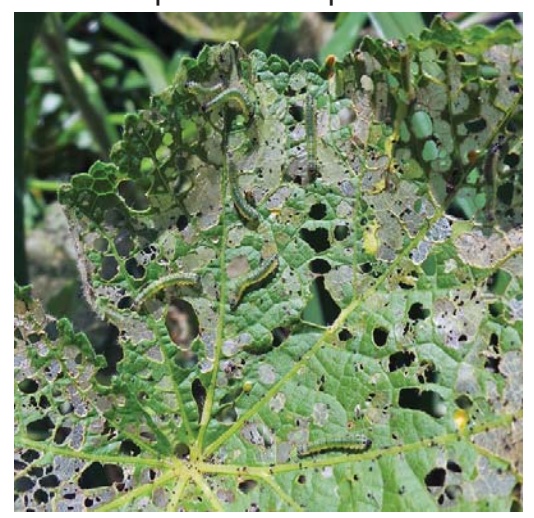
sawflies Hollyhock defoliating а hollyhock leaf.

When numerous, plant-feeding sawflies can cause substantial damage in forests and landscapes. Large trees are rarely seriously