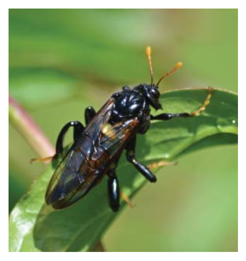
Adult elm sawfly.

plants, although one group (Orussoidea) are external parasites of wood boring beetles. There about 25 families*, with most of the 8,000 species worldwide in the family Tenthredinidae (about 5,500). The rest of this article is about the phytophagous true sawflies.