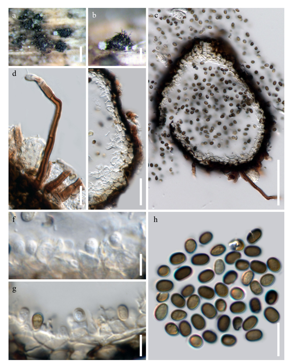
Fig. 2 Coniothyrioides thailandica sp. nov. (MFLU 22-0276, holotype). (a) & (b) Appearance of conidiomata on a submerged decaying woody substrate. (c) Longitudinal section of conidioma. (d) Conidiomatal wall. (e) The appearance of setae. (f) & (g) Conidiogenous cells with developing conidia. (h) Conidia. Scale bars: a = 200 \mu m , b = 100 \mu m , c = 50 \mu m , d = 20 \mu m , e, h = 10 \mu m , f, g = 5 \mu m .

Note – Coniothyrioides gen. nov. is a monotypic genus associated with decaying woody substrates in salt marsh habitats in central Thailand. This genus is characterized in having pycnidial conidiomata with the cells of textura angularis wall surrounded by distinct setae, doliiform to subcylindrical, hyaline conidiogenous cells, and ellipsoidal to obovoid, aseptate and hyaline to brown conidia. Based on some conidial characteristics such as aseptate, hyaline to brown conidia the genus shares similar morphologies to coniothyrium-like taxa<sup>[19]</sup>, by ellipsoidal to subcylindrical conidia sharing similar