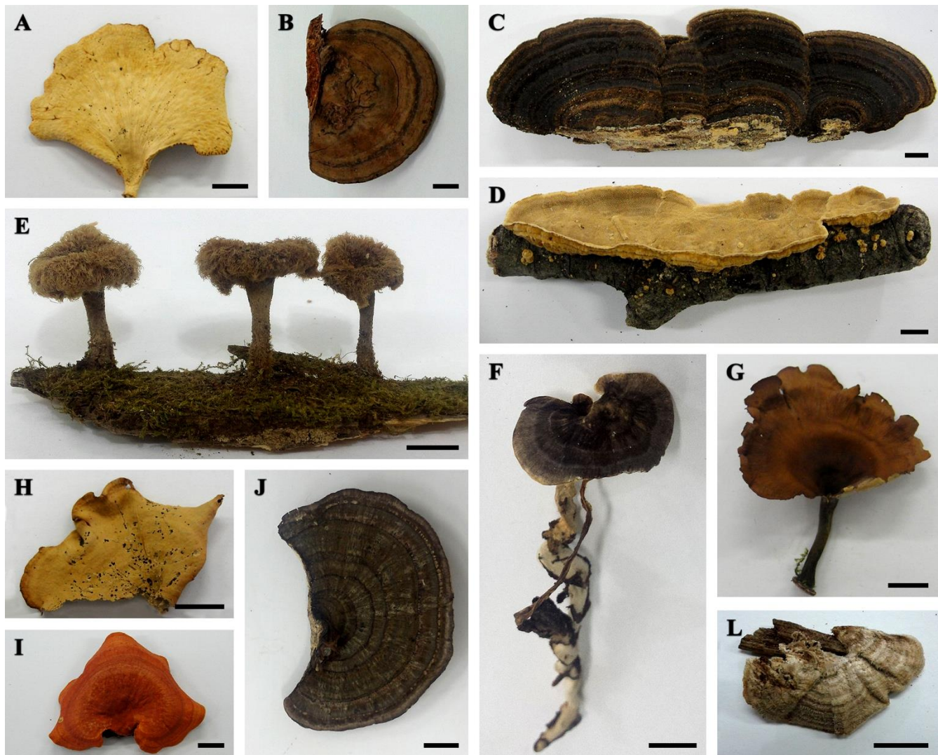
Fig 3. Recorded taxa. Basidiomata of Favolus tenuiculus (A), Fomes fasciatus (B), Funalia caperata (C), Funalia floccosa (D), Lentinus berteroi (E), Microporellus dealbatus (F), Polyporus dictyopus (G), Polyporus guianensis (H), Pycnoporus sanguineus (I), Trametes pavonia (J) and Trametes variegata (L). Bars = 1 cm.

The species accumulation curve generated according to species collected per year, did not reach asymptote, thus indicating that the richness of poroid fungi in the area may increase with the increase in collections (sampling effort). This result is similar to those found by Soares et al. (2014), Medeiros et al. (2015) and Xavier et al. (2019), who despite having found great richness in the studied areas, also obtained non-asymptotic accumulation curves.