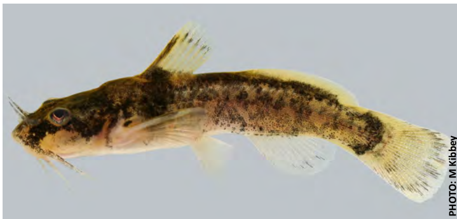
Mountain madtom, Noturus eleutherus .

Justin and Brian have also reconfirmed the presence of northern madtoms in historical localities of the Muskingum River, based on a U.S. Fish and Wildlife study conducted from 1982-1984 by OSUM Curator Emeritus Ted Cavender. Other entities had sampled these localities and