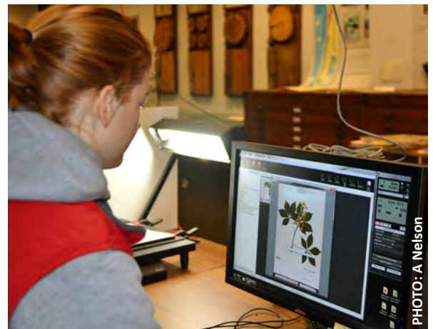
Imaging plant specimen at the Herbarium.