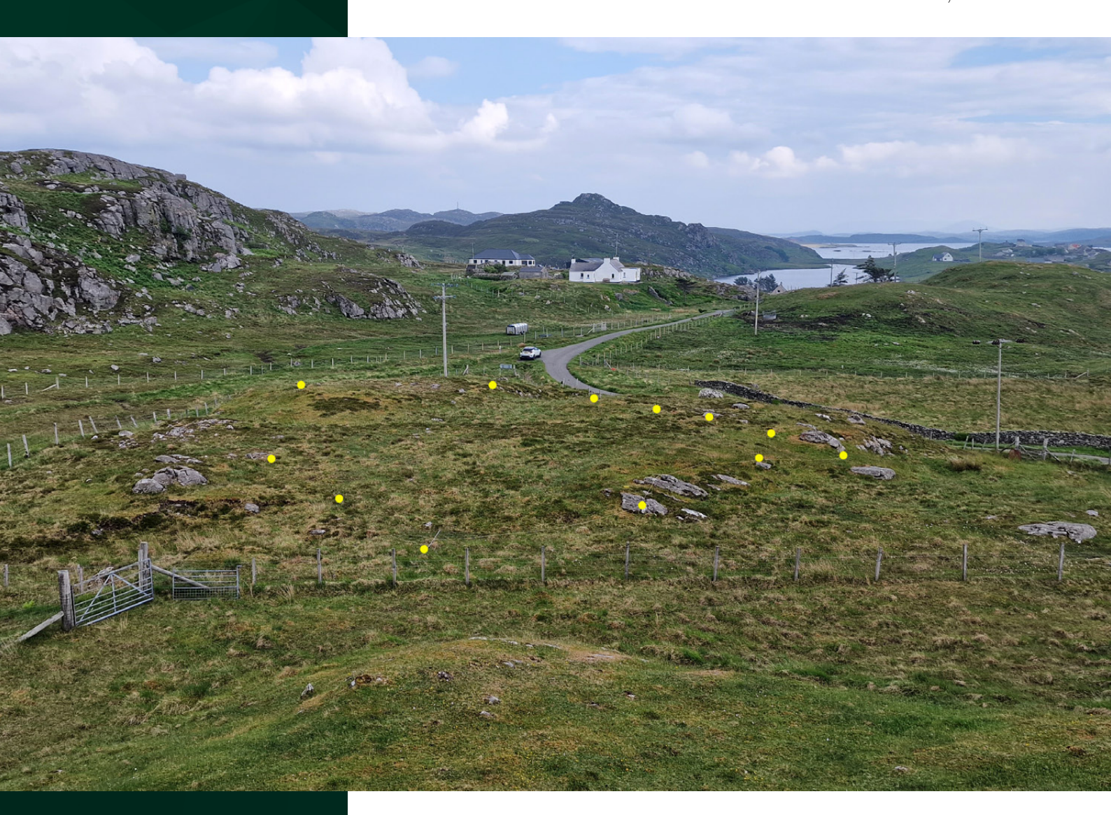
SPECTACULAR AND UNINTERRUPTED VIEWS OF LOCH A' BHAILE